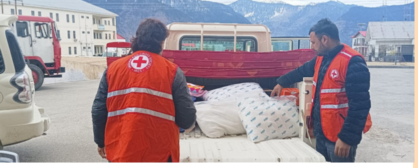
Red Cross Kishtwar district branch of IRCS, J&K provided relief materials to the fire victims of Kharian, Inderwal and Chatroo.