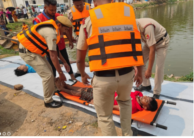
Volunteers from the IRCS Sonamura Sub-Divisional Branch took part in a flood rescue simulation drill at the Sonamura Reserve Tank in cooperation with the Tripura Fire And Emergency Department.