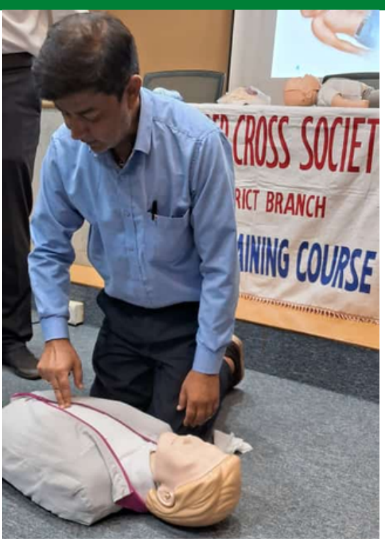
First aid training was held by IRCS Pune district branch, Maharashtra