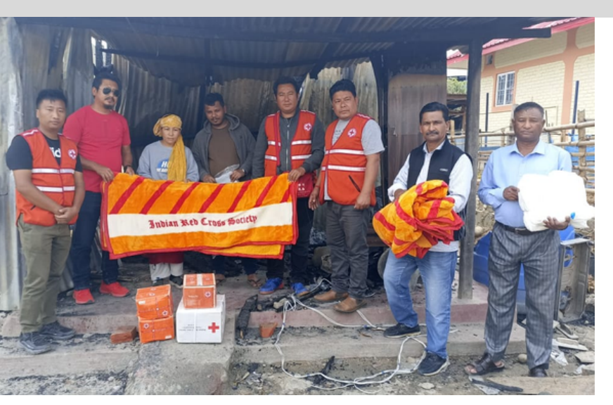
Volunteers from the IRCS Senapati district branch in Manipur visited the fire victims and provided for relief at Kalapahar, Kangpokpi district.