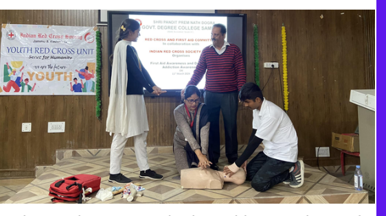
The Red Cross and First Aid Committee of SPPND Government Degree College Samba in collaboration with Indian Red Cross Society (J&K) organised an enlightening awareness programme on First Aid and Drugs Deaddiction.