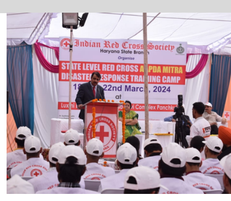
Indian Red Cross Society, Haryana State Branch inaugurated State Level Red Cross Aapda Mitra Disaster Response Camp on 18th March, 2024 in association with Revenue & Disaster Management Department, Govt of Haryana.