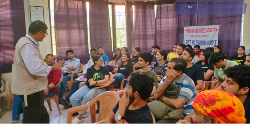
First aid training was conducted for 35 foliage trekkers by Pune district branch, Maharashtra