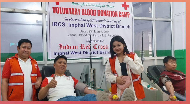
In observance of 21st Foundation day of IRCS Imphal West District Manipur,a voluntary Blood donation camp was organised at JNIMS Blood Center Porompat