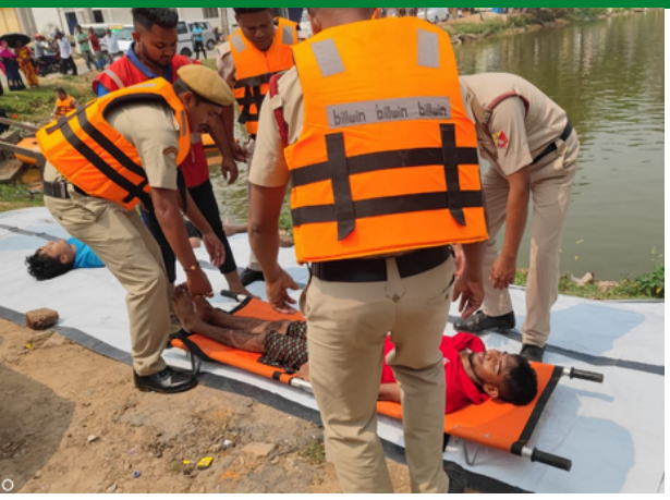
First Aid training program to Employees of Power Grid Corporation of India Limited, Warangal, Telangana