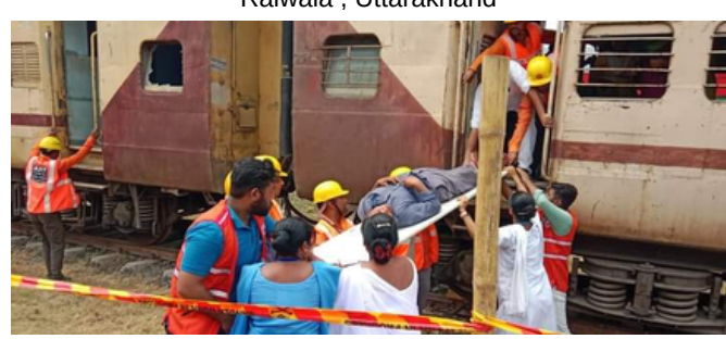
IRCS Malda district branch participated in a full scale mock drill exercise with NDRF on March 30, 2024 at Malda station/yard near Bio-gas plant.