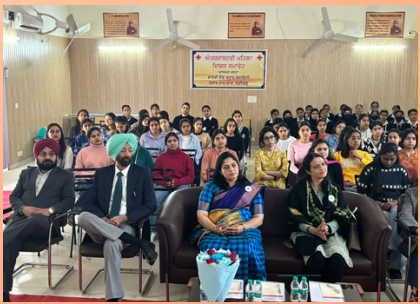
Celebration of International Women's Day, Punjab State Branch

On the occasion of International Women's Day, hygienic kits, new clothes and radiation kits were gifted to HIV-affected women and children in Jalgaon, Maharashtra.