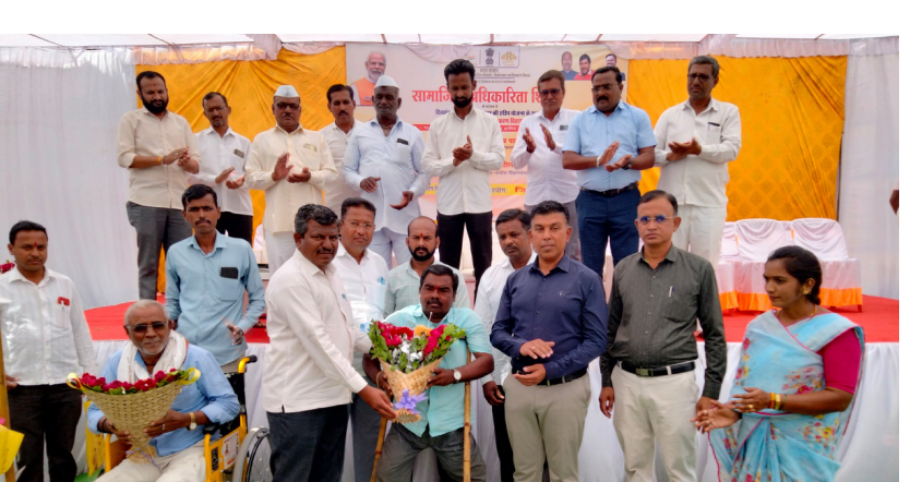
Under the Central Government's ADIP scheme and on behalf of Artificial Limbs of India (ALIMCO), Red cross District disability center distributed assistive materials to 225 disabled persons in Jalgaon, Maharashtra