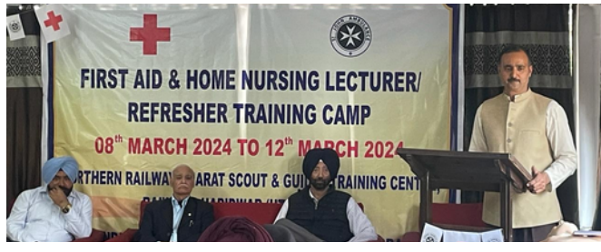
IRCS, Punjab State Branch organized first aid & home nursing lecturer refresher training camp from 8th to 12th March, 2024 at Bharat Scout & Guide Camp Site at Raiwala , Uttarakhand