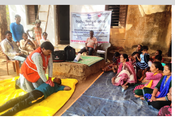
Disaster risk reduction workshop was held in a remote village, Jamkkol, Boudh District, Odisha