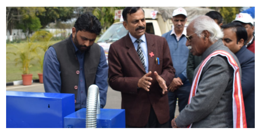
Hon'ble Governor, Haryana-cum-President dedicated 82 units of Sanitary Pad Dispensing and Disposal Machines valued at Rs. 15 lakhs from Haryana Raj Bhavan, Chandigarh for installation at 82 women's college in Haryana through the State Red Cross.

Under the project name "REDCROSS PRANAMITRA VOLUNTEERS' Training," the IRCS Kakinada District, Andhra Pradesh has launched a novel initiative to teach 850 Ward/Village Secretaries of the district's six coastal Mandals for disaster management, first aid, and fire rescue operations. With meticulous attention, the ONGC-sponsored project was carried out by offering 27 three-day training sessions led by master trainers. Presentation ceremony of certificates, hand books and t-shirts for 326 trainees of Kakinada city was also held.