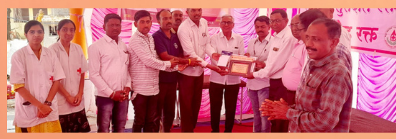
Blood donation camp, Jalgaon, Maharashtra