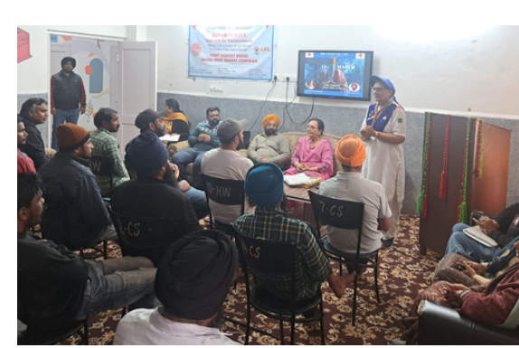
IRCS, Punjab State Branch, Drug De-addiction Centre, Patiala orangised No Smoking Day to create awareness about the destructive impacts of smoking