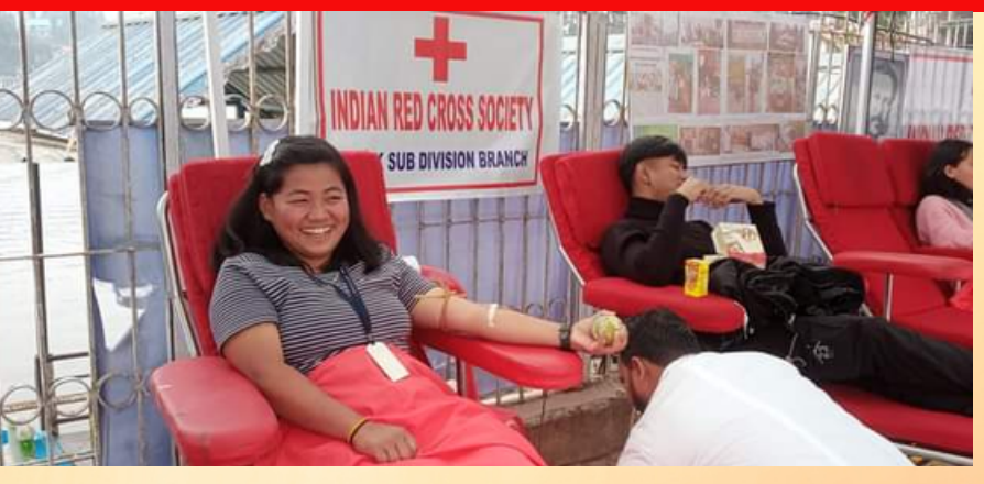
IRCS, Mirik Sub Division Branch, Darjeeling District, organized a blood donation camp. 41 units of blood was collected