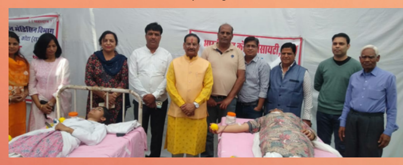
Blood donation camp, Kota, Rajasthan