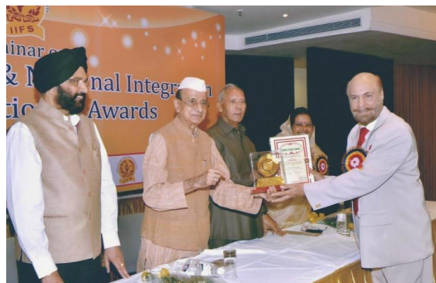
Secretary of the UT Branch, being felicitated with "Bharat Gaurav Award", at India International Centre, New Delhi