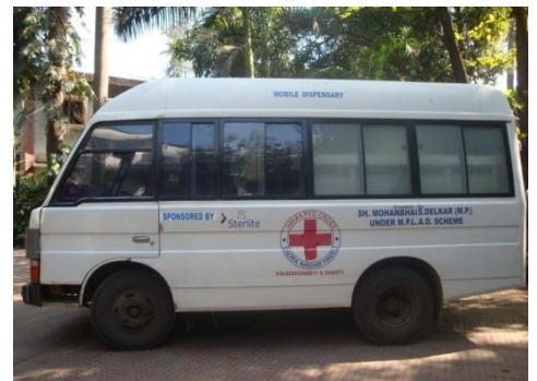
Mobile Dispensary Van donated to IRCS under MPLAD Scheme

It has been functioning on regular basis since March 2006. The medical team treats patients in remote areas as per weekly schedule. The dispensary rendered medical treatment and provided medicines to 14625 patients in the interiors during the period. So far, 155153 patients have been attended to by the Mobile Dispensary since its inception.