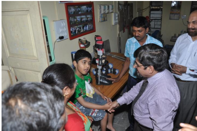
Aids & Appliances fabricated at Red Cross- District Disability Rehabilitation Center being given to handicapped child by Member NCPDR

During 2014-15, there were 174 nos. of children on the roll of Special School for Handicapped Children, out of which 117 were Mentally Retarded, 55 were Deaf & Dumb, 1 Visually Impaired and 1 Physically Handicapped.