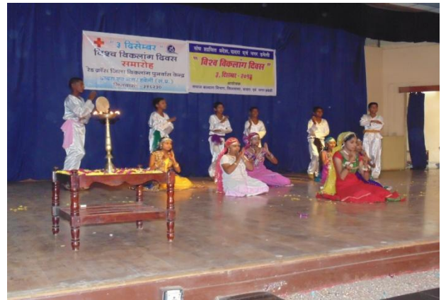
Mentally Handicapped Children of Red Cross Special School performing on the occasion of World Disability Day