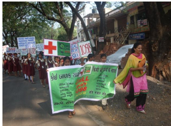
Childline Rally conducted during Children's Week

"Childline 1098", is a toll free emergency phone service for children in need of care & protection, set-up under the scheme of Ministry of Women & Child Development, since August 2011. Since inception, the Childline has addressed to the needs of 451 nos. of vulnerable children. During 2014-15, it provided assistance to 102 children in distress; particularly neglected & delinquent children.