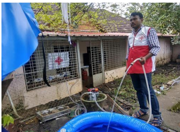
Water purifier installed at the site

The efforts and contributions of the Indian Red Cross Society towards Disaster Relief Operations during the Kerala floods are summarized in the subsequent paragraphs.