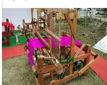
Power loom given to female beneficiary in Manipur