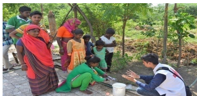
Hand Wash elder people of Mujhpur Village conducted by Youth Volunteers, Youth Program, Gujarat.