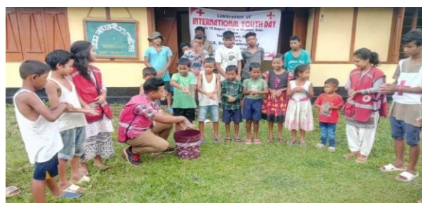
Hand wash conducted by Assam, Red Cross Volunteers on the occasion of International Youth Day.