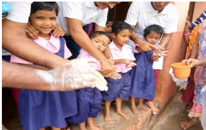
Hand Washing practice conducted by Odisha Red Cross youth Members to the Community members.

However, as average age increases the corresponding care must be provided to elders. 20% of the elderly population suffers from dementia, especially the cohort of eighty years and above. As a result, it is a ubiquitous sight to find elderlies living solitary lives, devoid of necessary care. It is with this background that a need was felt for a group of trained, personnel who can cater to the care-needs of elderly people. They can assist them in performing their daily chores. Hence the demand for a health associate has been rising that apart from looking after elderlies, can also support specially-abled individuals. Indian Red Cross Society, with the mindset mentioned above, has started the Home Health Aide Course in collaboration with the Ministry of Skill Development and Entrepreneurship and Sir Ganga Ram hospital. Duration, of course, is 400 hours covered over four months. Minimum qualification required to join the course is matriculation. We feel proud to mention that the first batch of the course is underway with a strength of 26 students.