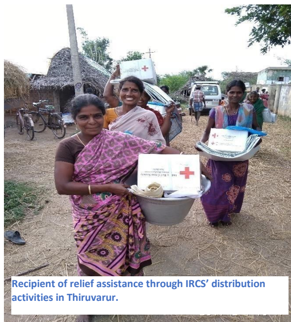
Recipient of relief assistance through IRCS' distribution activities in Thiruvarur.

Despite elaborate preparedness measures, the wind speed and heavy rains caused deaths, damages to houses and public infrastructure.