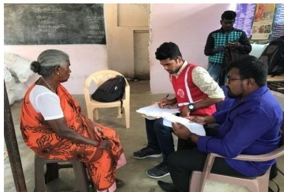
Tamil Nadu refugee camp visits and National level FNS focal person trainings