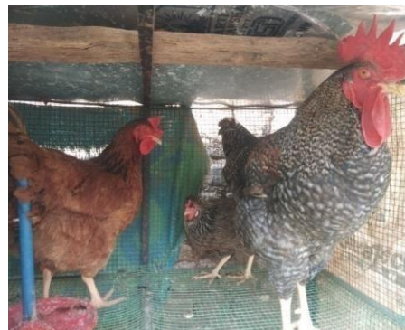
Chicks of Banraja breed given to Odisha beneficiary

Thus the livelihood project has covered the entire project area including landless and landholder farmers in Odisha and Maharashtra.