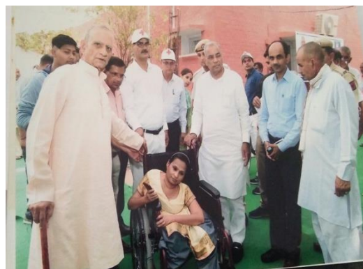
Distribution of artificial Aids & Appliances to the physically challenged persons organised by District Red Cross Society, Jind

The bus is being mobilized in rural/urban areas of the district accordingly to the calendar prepared and provides artificial limbs, aids & appliances for PWD’s at their door step. The Mobile Van services initiated by Red Cross Rehabilitation Centre, Faridabad and provide services to the other 4 districts i.e. Palwal, Mewat, Gurgaon and Narnaul.