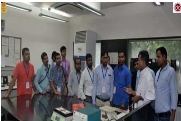
“Six Days Residential Training Program for Training of Trainers for Strengthening of Blood Services in the State of Uttar Pradesh: 23.07.18-28.07.18”

The participants were taken for a Model Blood Bank visit to Indian Red Cross Society, New Delhi to enrich their knowledge on procedures for testing in blood services, safety parameters and information related to TQMS. The visit helps the visitors in strengthening the standards of Blood Services learnt during the training period and spread awareness while enlightening the students about blood donations. The training was imparted on: Automated Cell counter, Automated Blood grouping technique, transfusion transmitted infections (TTIs), ADR monitoring, Blood component preparation of Plasma Components and documentation of processes.