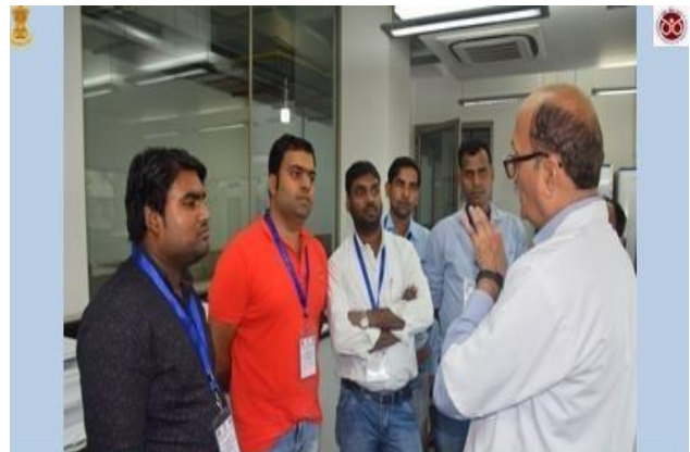
“Six Days Residential Training Program for Training of Trainers for Strengthening of Blood Services in the State of Uttar Pradesh: 23.07.18-28.07.18”