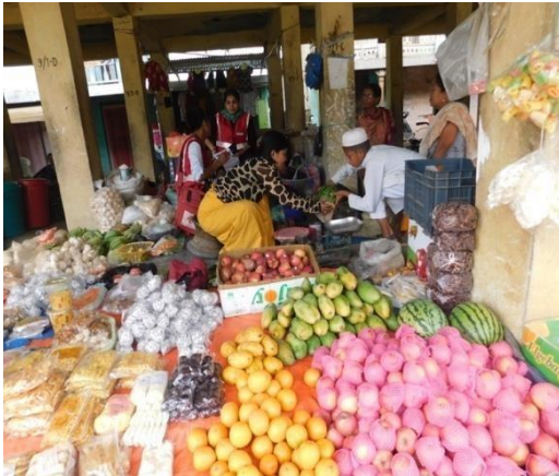
Fruit and eatable shop assistance to female

In states where women beneficiaries are heading the family, they were given training on different vocations to support their livelihood in areas of embroidery cum tailoring, grocery shop, mushroom cultivation, fermented fish shop, eatery, street vendor (vegetables + fruits), power loom, piggery, artificial jewellery making etc. The beneficiaries thanked by mentioning that their life had changed as compared to the before IRCS training era. Hence it was observed, the current situation of the beneficiaries of the targeted area has improved after Indian Red Cross' intervention.