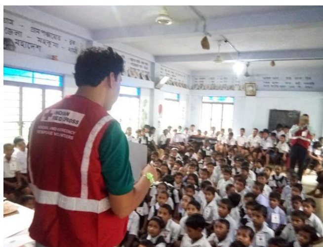
Teaching school students WASH practices in West Bengal State Branch

Nayagarh and Ganjam districts. The project leverages and aligns its activities with the Swachh Bharat (Clean India) Mission by tapping into a multi-stakeholder partnership that includes the Republic of Korea National Red Cross, the International Federation of Red Cross and Red Crescent Societies (IFRC) and Samsung Community Chest Fund. The model of institutional arrangements that is being used to implement the project is based on a partnership with government that involves sharing the responsibilities for implementation of activities between