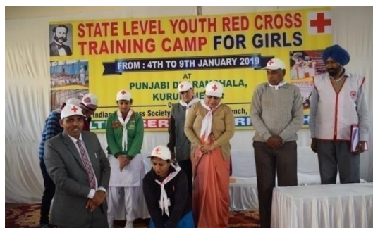
Youths Participating During First Aid Training Session

The services of Red Cross are carried over in all the schools is called Junior Red Cross services. All the students of 17,300 Govt. schools are the members of Red Cross. Membership subscription is collected from each student at the time of admission.