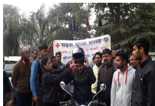
Volunteers of Red Cross giving message of Road Safety during the campaign run by District Red Cross Society, Gurugram

Special drive has been started against misuse of Red Cross Emblem in all the districts under the Red Cross Branches in Haryana. The Youth Red Cross and Junior Red Cross units are specially instructed to make aware the general public about the emblem of Red Cross. A special drive