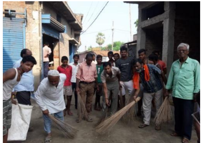
Cleaning of the surroundings by community people under Swachh Bharat Abhiyan, Khagaria, Bihar

IRCS NHQ approached Singapore Red Cross for providing financial support for SERV Program. After their funding support, the NHQ released working advances to the target branches. The 13 branches reported expenditure of INR 2884930 after utilization.