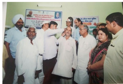
Distribution of Hearing Aids to the Senior Citizen during Health Camp organised by District Red Cross Society, Jind

Indian Red Cross Society, Haryana State Branch has taken initiative to provide assistance in Cochlear implantation Scheme of Govt. of India, to the children. In this regard awareness derive has been initiated on World Red Cross Day in each District Red Cross Branch in Haryana. During the year 2018-19 total 108 children registered and 40 children