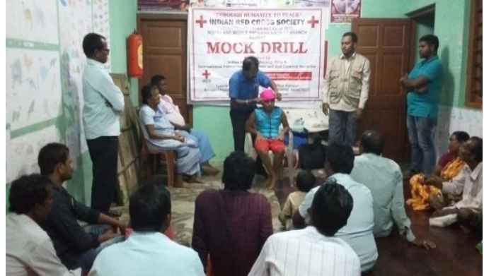
Mock drill conducted by A & N UT branch

New states and districts were added this year based on their risk profile and availability of funds, resulting in 18 states in total.