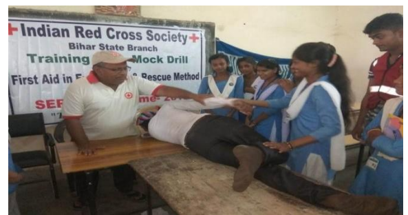
Students of DayaNand Kanya Vidhyalaya, Girls are being trained for First Aid (Recovery Position), Saharsa, Bihar