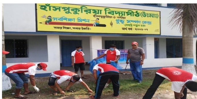
Clean School Healthy School program under Youth Program, Nadia Dist, West Bengal