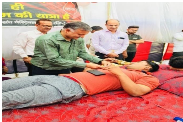
General Secretary, IRCS, Haryana State Branch encouraging blood donor at Blood Donation organised by District Red Cross Society, Panchkula