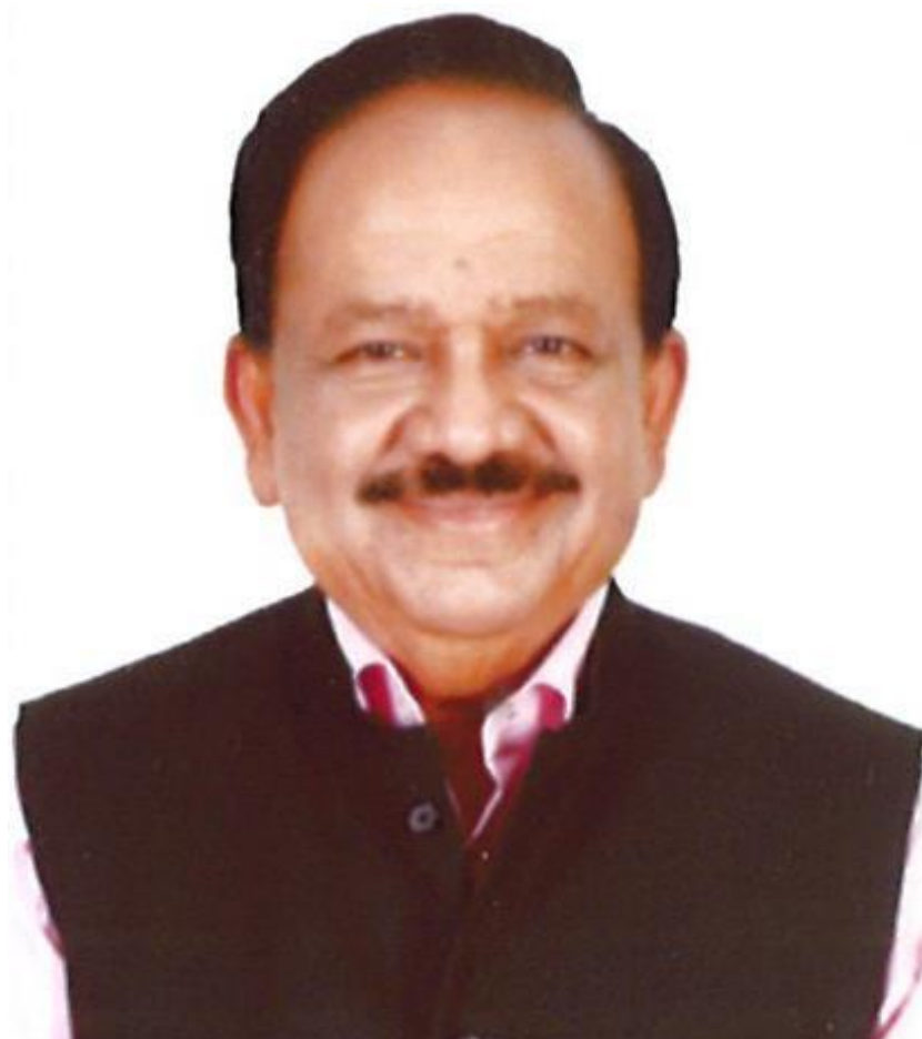
Dr Harsh Vardhan Our Hon'ble Chairman