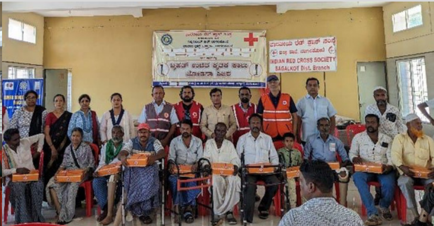
IRCS, Bagalkot district branch, Karnataka conducted free artificial limb fitting camp. 138 beneficiaries were provided with artificial limbs.