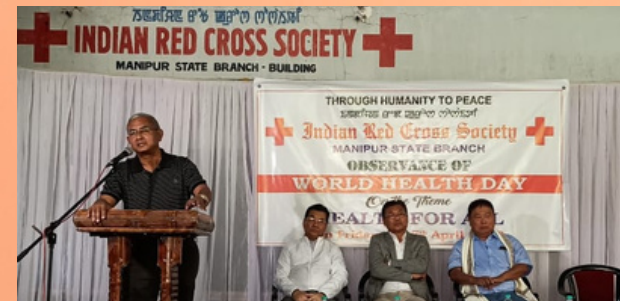
Celebration of World Health Day, Manipur state branch