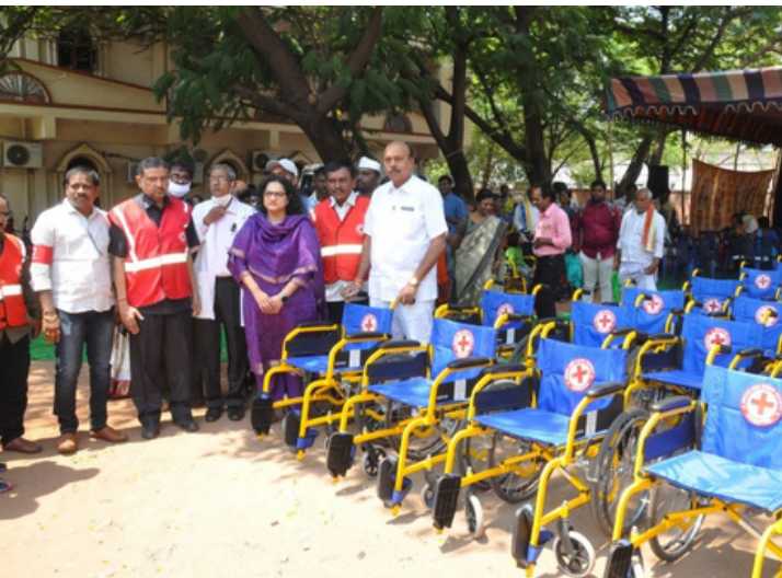
Distribution of wheelchairs, Kunrool district branch, Andhra Pradesh