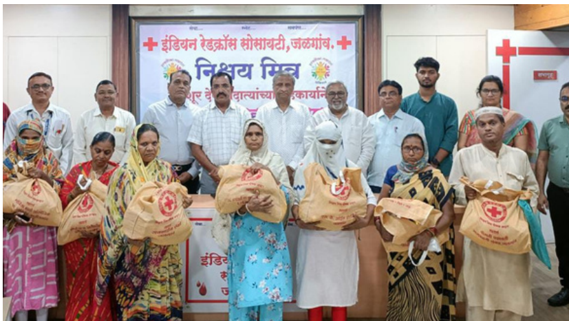
Distribution of nutritious food to T.B. patients, Jalgaon, Maharashtra