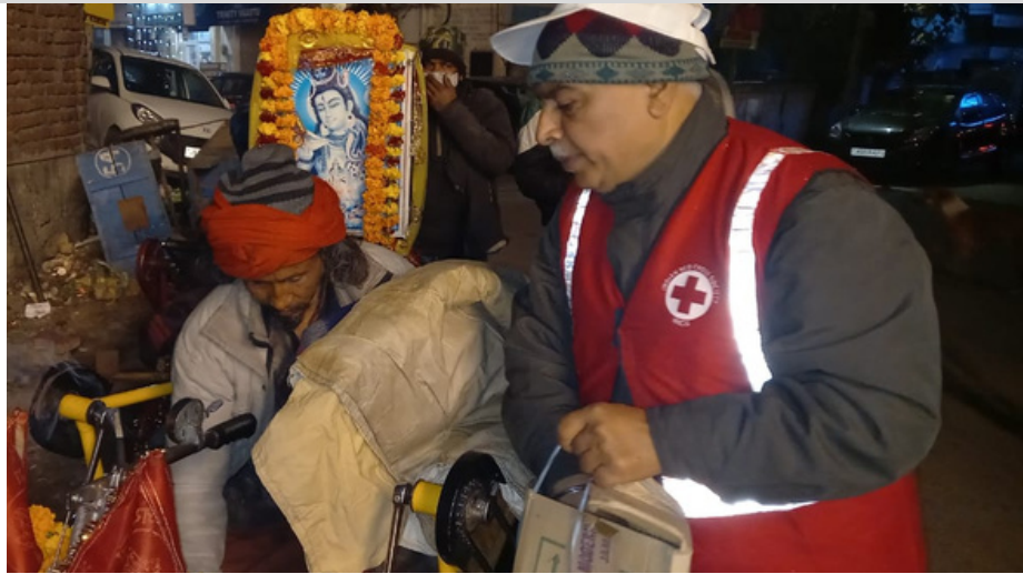
Distribution of relief items and blankets to poor and needy in the slums of Jammu