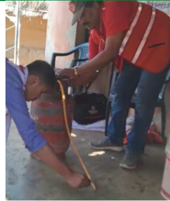
Fire accident management training in different villages of Boudh district, Odisha