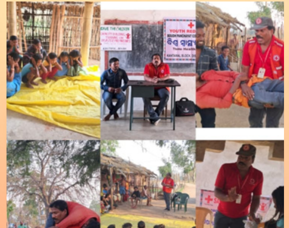
Disaster preparedness and basic first aid training were held at 4 villages of Boudh, district, Odisha on the occasion of World Health Day