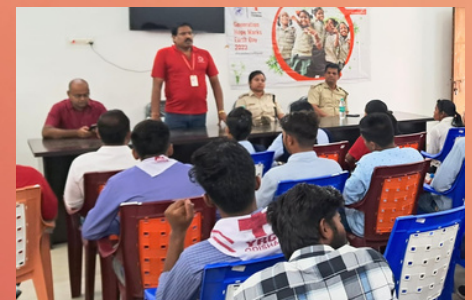
Earth Day was celebrated at Kantamal, Boudh, Odisha in collaboration with Save the Children (NGO)