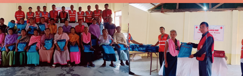
Distribution of mosquito nets was held on the occasion of World Malaria Day at Jiribam district branch, Manipur