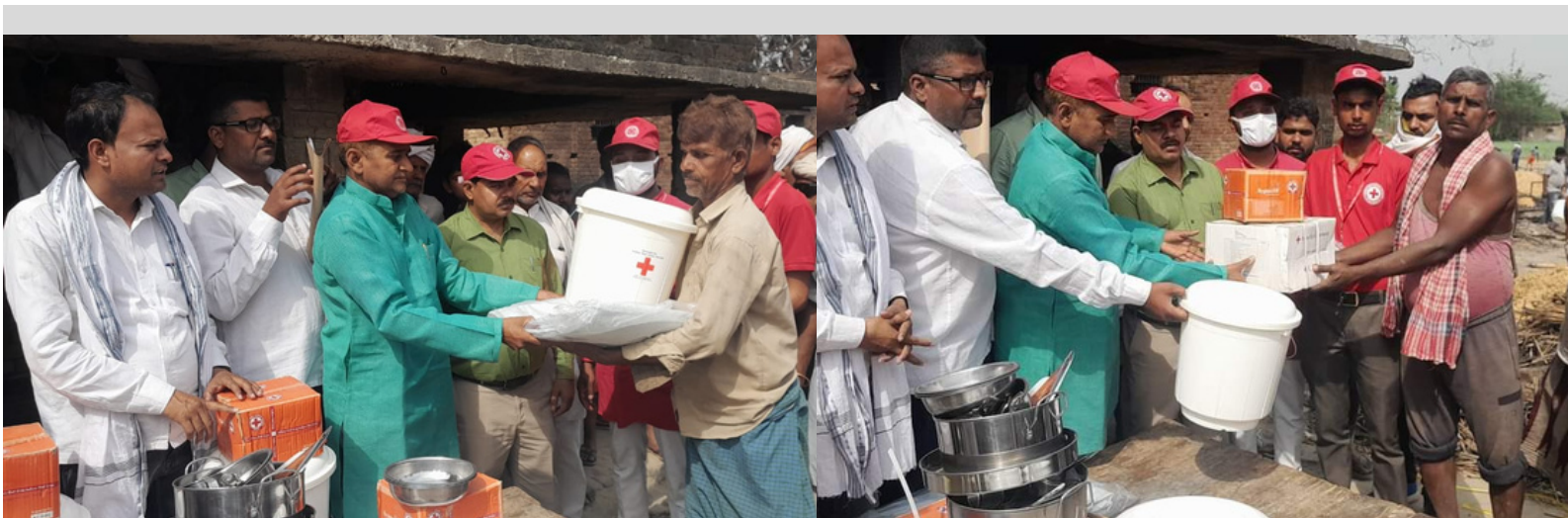
Distribution of blankets, hygiene kits, kitchen sets to poor and needy, Deoria, Uttar Pradesh