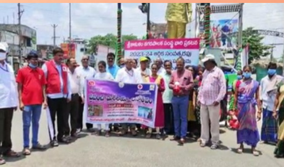
Awareness rally was held on World Malaria Day at Srikakulam district branch, Andhra Pradesh