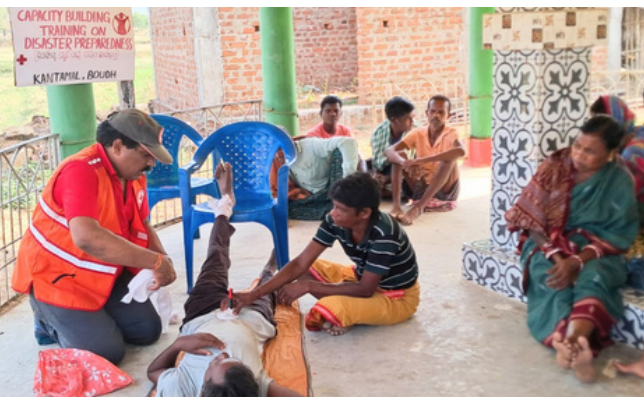
Capacity building training on disaster preparedness, Kantamal Block, Boudh, Odisha