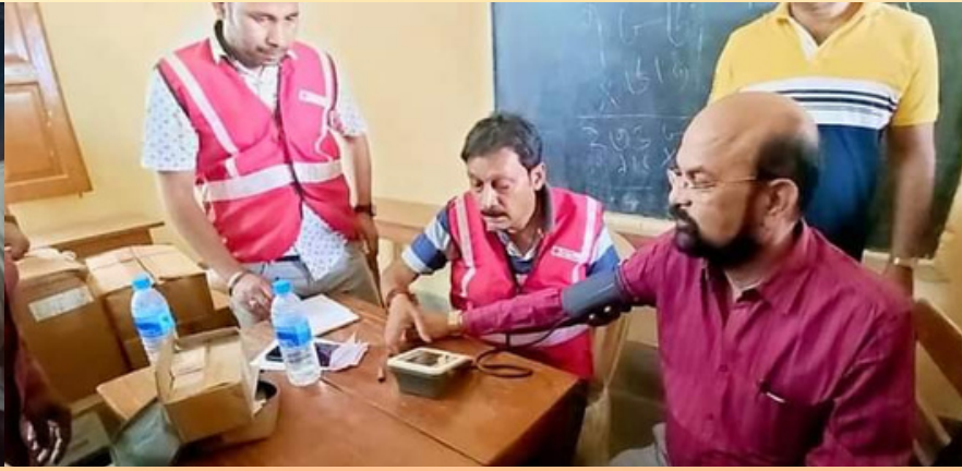
Health awareness & health checkup camp was held at Gopalpur Primary School campus, Malda district branch, West Bengal