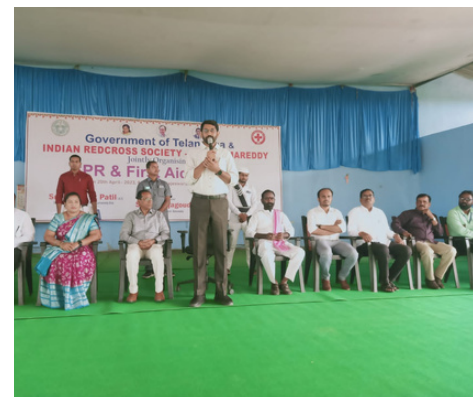
First aid training, Jukkal, Kamareddy district, Telangana