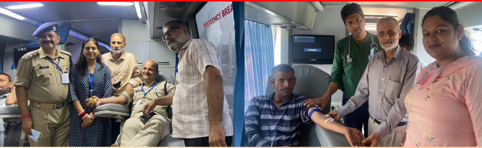
Blood donation camps were organized with different agencies by the IRCS of Jammu division. The partner organizations included like BSF, Airport Jammu and Sant Nirankari Mandal and others.