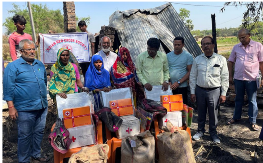
Distribution of relief items to the fire victims of Pupri, Bihar