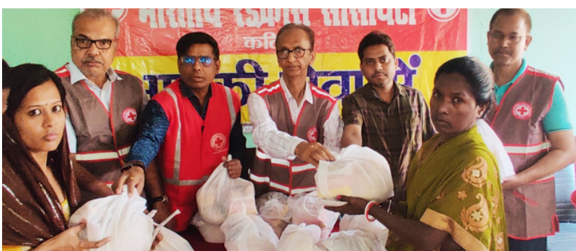
Distribution of nutritious food to TB patients, Katihar, Bihar