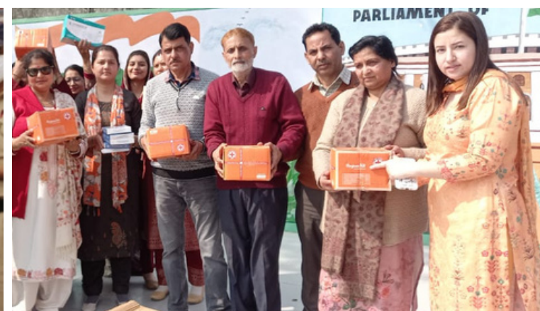
Distribution of sanitary napkins and hygiene kits to the girl students of Govt. schools of Jammu