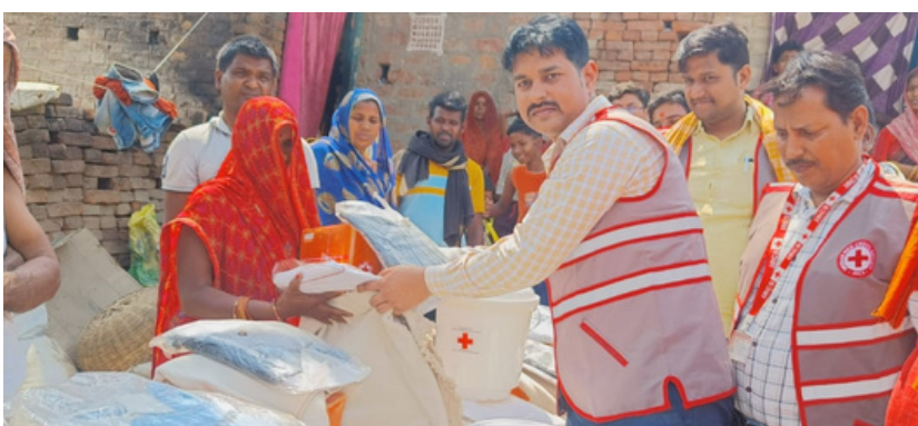
Distribution of blankets, hygiene kits, kitchen sets to poor and needy, Ballia, Uttar Pradesh