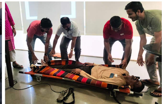
First aid training was held for the workers of Patel Engineering Pvt. Ltd., Mumbai, Maharashtra