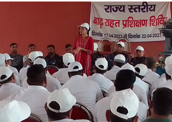
Flood relief training camp was held at Brahma Sarovar, Kurukshetra, Haryana