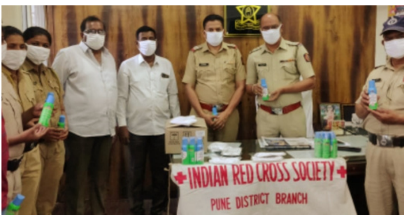
Distribution of masks and sanitizers among police personnel, Pune, Maharashtra