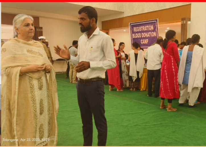
Blood donation camp organised at Nirankari Bhawan, Hyderabad, Telangana