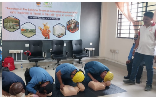
Fire safety week was celebrated at Imphal in the presence of district administration, Manipur fire service, Factories dept. officials, Mutual aid members