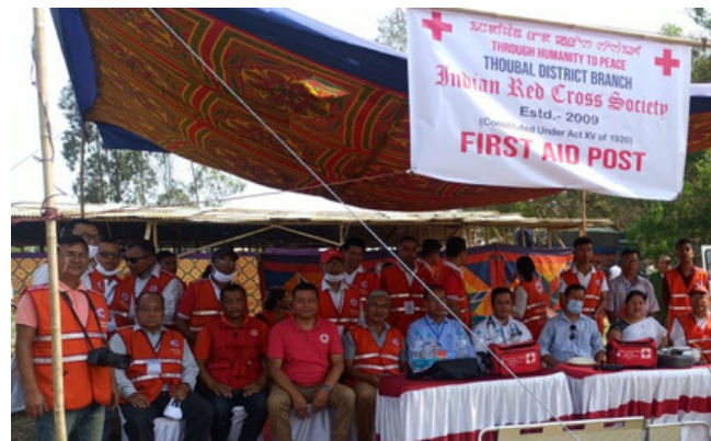
First aid post, Thoubal district branch, Manipur