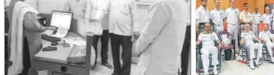
पटना। सांसद रामकृपाल यादव ने सोसायटी के गांधी मैदान स्थित रेडक्रॉस सोसायटी के फिजियोथेरेपी का यूनिट का निरीक्षण किया।

पटना। सांसद रामकृपाल यादव ने सोसायटी के गांधी मैदान स्थित रेडक्रॉस सोसायटी के फिजियोथेरेपी का यूनिट का निरीक्षण किया। इस दौरान उन्होंने रेडक्रॉस के कर्तव्य चिकित्सक एवं कर्मचारी उपस्थित रहे।