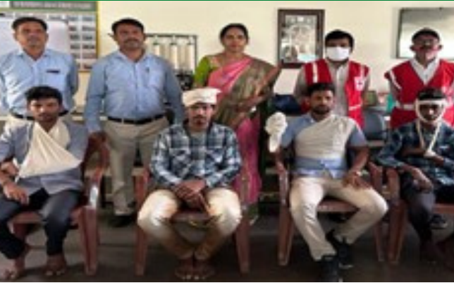
First aid training program at Cotton Spinning Mill, Guntur district branch, Andhra Pradesh