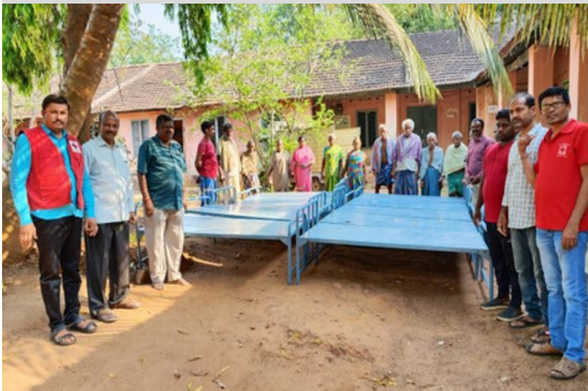
The Srikakulam district branch, Andhra Pradesh donated ten iron beds worth Rs 1,20,000 to the district Leprosy and Tuberculosis control office.