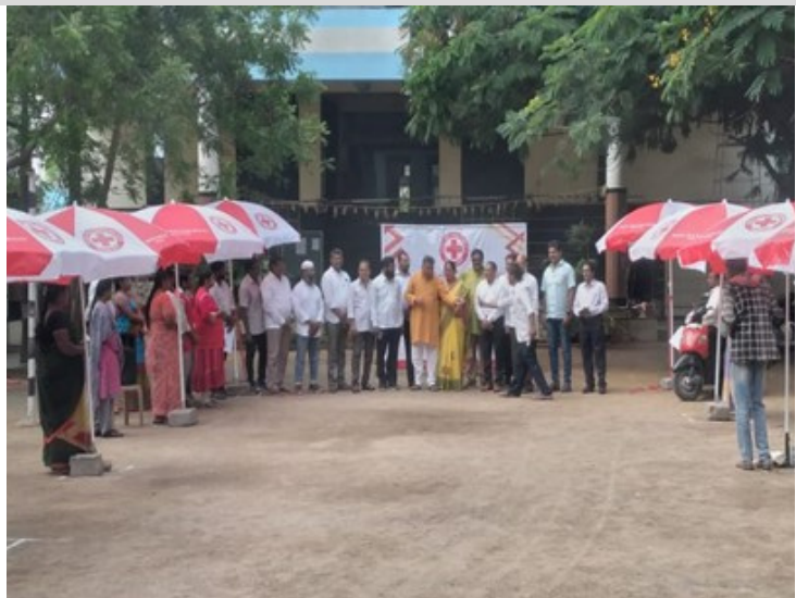
IRCS, Guntur district branch, Andhra Pradesh distributed Jumbo Umbrellas to the homeless and street people.