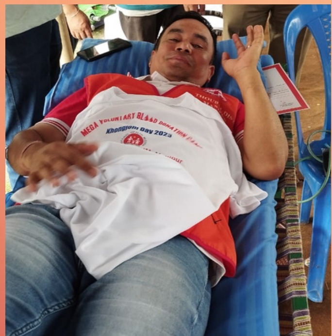
Blood donation camp, Thoubal district branch, Manipur