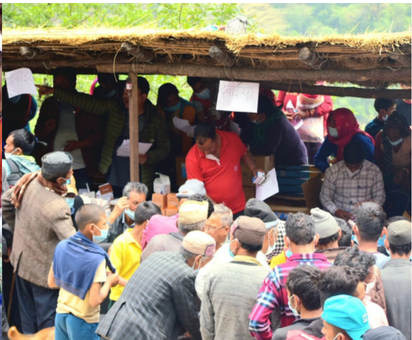
Distribution of relief items including blankets, hygiene kits and medicines to needy, Uttarakhand