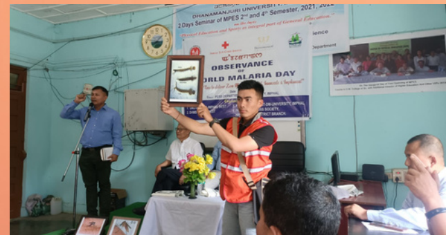
Observation of World Malaria Day by IRCS, Imphal west district, Branch