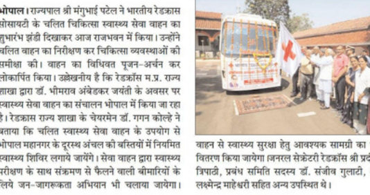
भोपाल। राज्यपाल श्री मंगुभाई पटेल ने भारतीय रेडक्रॉस सोसायटी के चलित चिकित्सा स्वास्थ्य सेवा वाहन का शुभारंभ किया।

भोपाल। राज्यपाल श्री मंगुभाई पटेल ने भारतीय रेडक्रॉस सोसायटी के चलित चिकित्सा स्वास्थ्य सेवा वाहन का शुभारंभ किया। राज्यपाल पटेल ने रेडक्रॉस के चलित स्वास्थ्य सेवा वाहन का किया शुभारंभ किया।