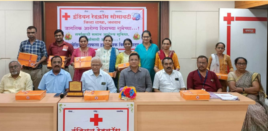
Distribution of hygiene kits on the occasion of World Health Day to Paramedics at various hospitals in Jalgaon, Maharashtra