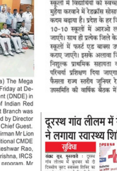
950 से अधिक लोगों का इलाज कर खादी