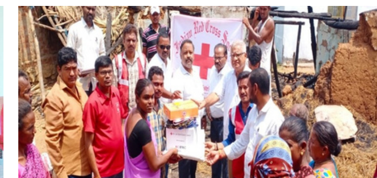
Provided immediate relief and groceries to the victims of the fire accident at Srikakulam District Branch