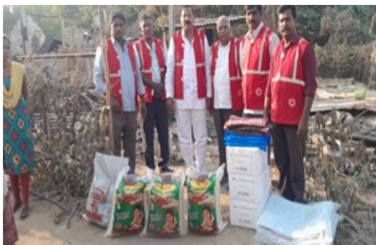
Relief materials and other essential items were provided to the fire victims at Visakhapatnam, Andhra Pradesh