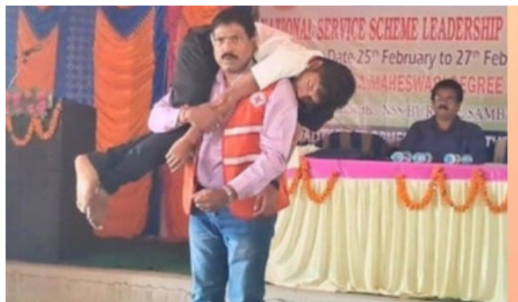
Disaster management training, MM College, Baunsuni, Boudh, Odisha