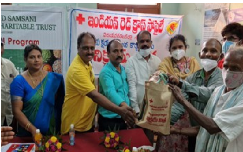
Distribution of nutritional kits to Tuberculosis patients by Vizianagaram district branch, Andhra Pradesh