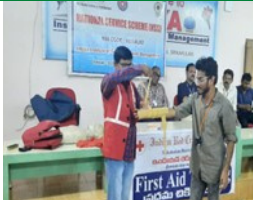
First aid training program, Degree College, Srikakulam, Andhra Pradesh