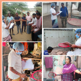
An awareness camp to prevent mosquito infestation was held at Kholi area of Alang, Bhavnagar, Gujarat, on the occasion of World Malaria Day