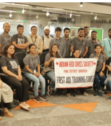
First aid training, Pune, Maharashtra