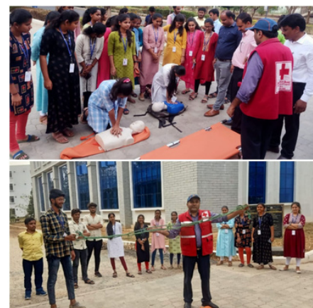
IRCS, Davengere district branch, Karnataka along with GMIT Engineering college conducted a workshop on first aid for volunteers of NSS and YRC.