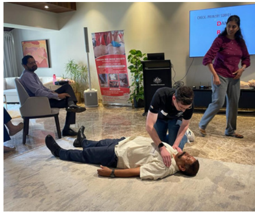
First aid & CPR training, Mumbai, Maharashtra