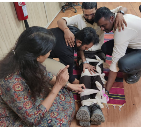
Basic first aid training was conducted for the officers and workers of HCC, of Mumbai Coastal Road Project, Mumbai, Maharashtra