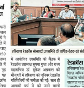
हरियाणा रेडक्रॉस सोसायटी परामर्श की वार्कशॉप डेस्क को संबोधित करते अधिकारियों।

मिथुलक प्राथमिक सहायता और गुरु परिचर्या का दिनांक परिक्षण रिवर ब्यूरो चंडीगढ़, 14 अप्रैल : सरकारी स्कूलों में विद्यार्थियों को स्वच्छ जल मुहैया कराने में रेडक्रॉस सोसायटी ने कृतज्ञ बहदाया है। प्रदेश के हर जिले में 10-10 स्कूलों में आरओ लगावा जाएगी।