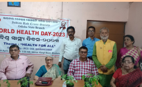
Celebration of World Health Day, Bhubaneswar Odisha