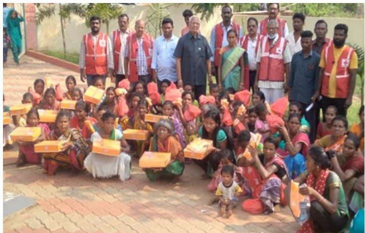
Distributed hygiene kits to the tribal people at Parvathipuram Manyam, Andhra Pradesh