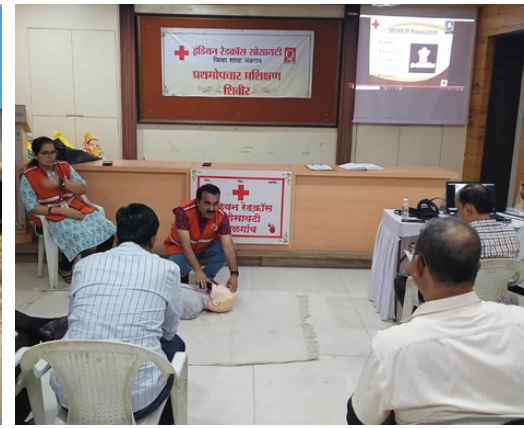
First aid training, Jalgaon, Maharashtra