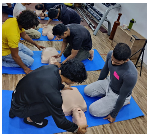
First aid and CPR training were provided to 17 fitness instructors at Classic Fitness Academy, Mumbai, Maharashtra