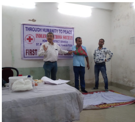
First aid training, Howrah district branch, West Bengal