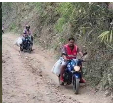
Red Cross volunteers extended humanitarian services to the affected population in one of the remotest terrains in Karbianglong district of Assam