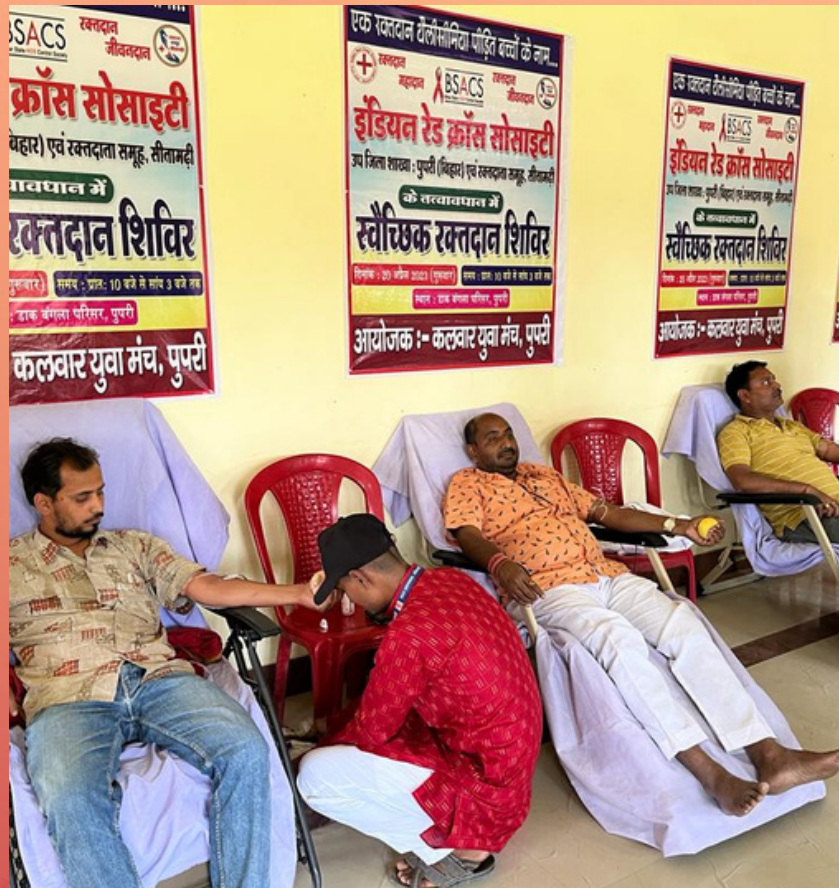
Blood donation camp, North 24 Parganas, West Bengal