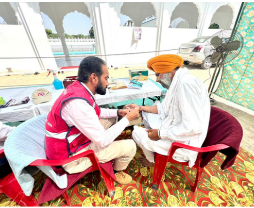
First aid services were provided to pilgrims of Vaisaakhi fair at Talwandi Sabo district, Bathinda, Punjab