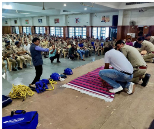
Disaster management training, Deesa, Gujarat