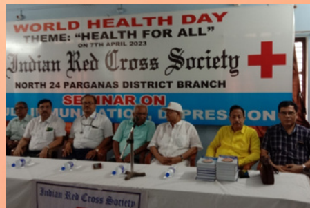
Celebration of World Health Day, North 24 Parganas, West Bengal