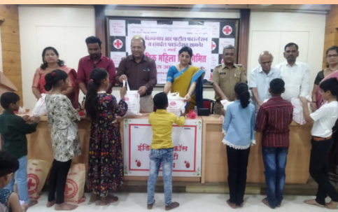
On the occasion of International Women's Day, hygienic kits, new clothes and radiation kits were gifted to HIV-affected women and children in Jalgaon, Maharashtra.