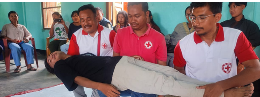
First aid training programs were held at two different places of Jiribam district of Manipur