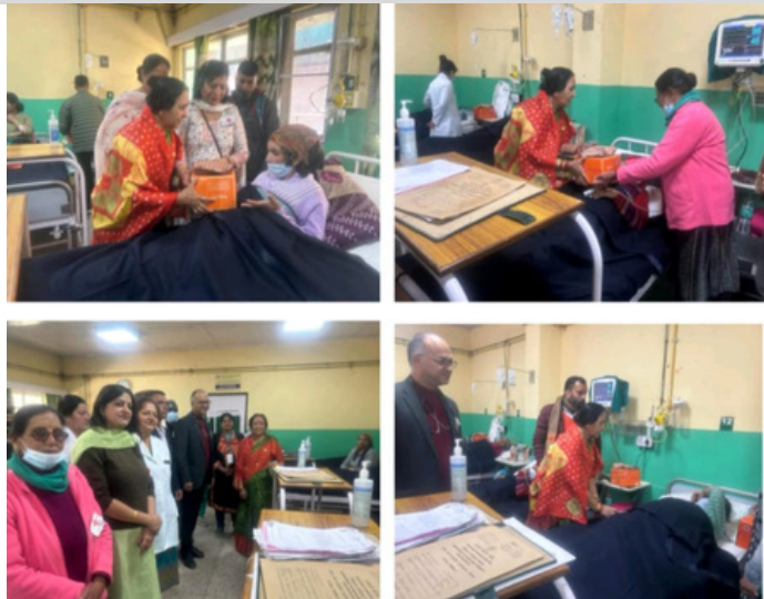
The Governor of Himachal Pradesh, provided fruits, juice, and hygiene kits to 110 cancer patients at Indra Gandhi Hospital.