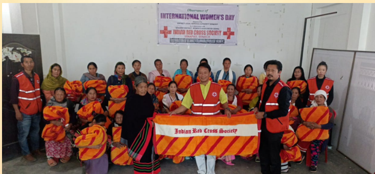
One day legal awareness program cum observance of International Women's Day in association with IRCS Senapati district branch and Senapati District Women's Association. Blankets were distributed amongst widows and other needy on the occasion.