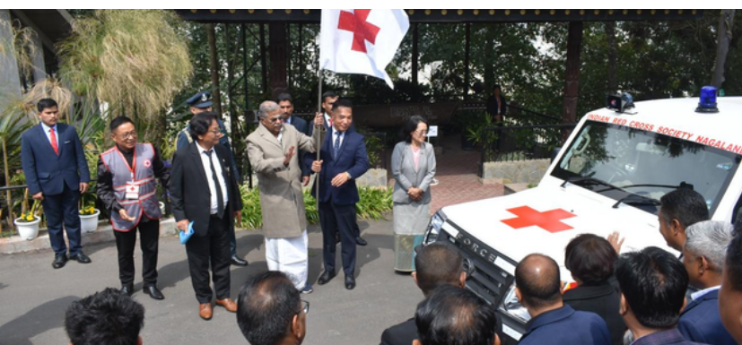
Flag off of ambulance by the Hon'ble Governor of Nagaland Sri La Ganesan