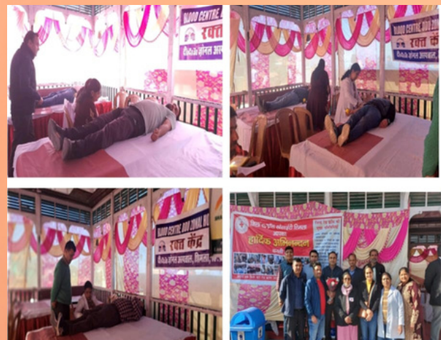
The HP State Red Cross and District Red Cross Branch Shimla held a blood donation camp on March 23rd at Ridge, the mall Shimla, to commemorate Shaheed Diwas. 39 units of blood were collected at the camp.