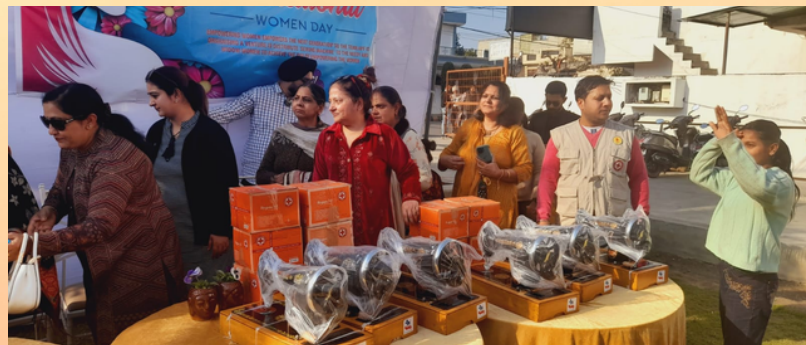
Distribution of sewing machines by Indian Red Cross Society, Jalandhar district branch, Punjab on the eve of International Women's Day