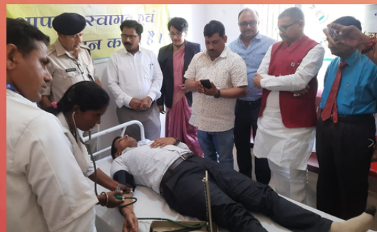
Blood donation camp, Buxar, Bihar