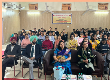
Celebration of International Women's Day, Punjab State Branch