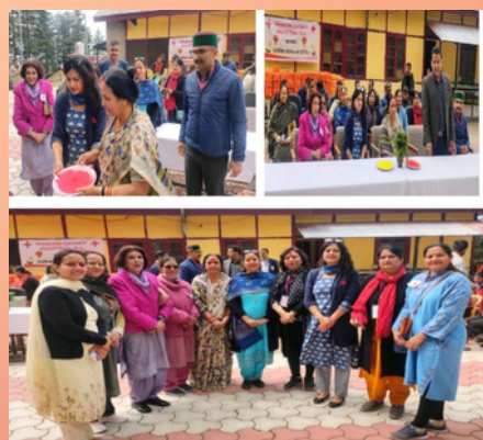
The Hospital Welfare Section of the HP State Red Cross hosted the "Holi Milan Utsav" with "Specially Abled Children". The Lady Governor and President of the Hospital Welfare Section of the HP State Red Cross distributed fruits, juice, cookies, and hygiene kits to children.