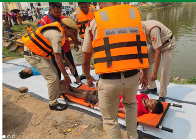
Volunteers from the IRCS Sonamura Sub-Divisional Branch took part in a flood rescue simulation drill at the Sonamura Reserve Tank in cooperation with the Tripura Fire And Emergency Department.