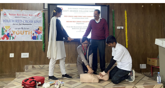
The Red Cross and First Aid Committee of SPPND Government Degree College Samba in collaboration with Indian Red Cross Society (J&K) organised an enlightening awareness programme on First Aid and Drugs De-addiction.