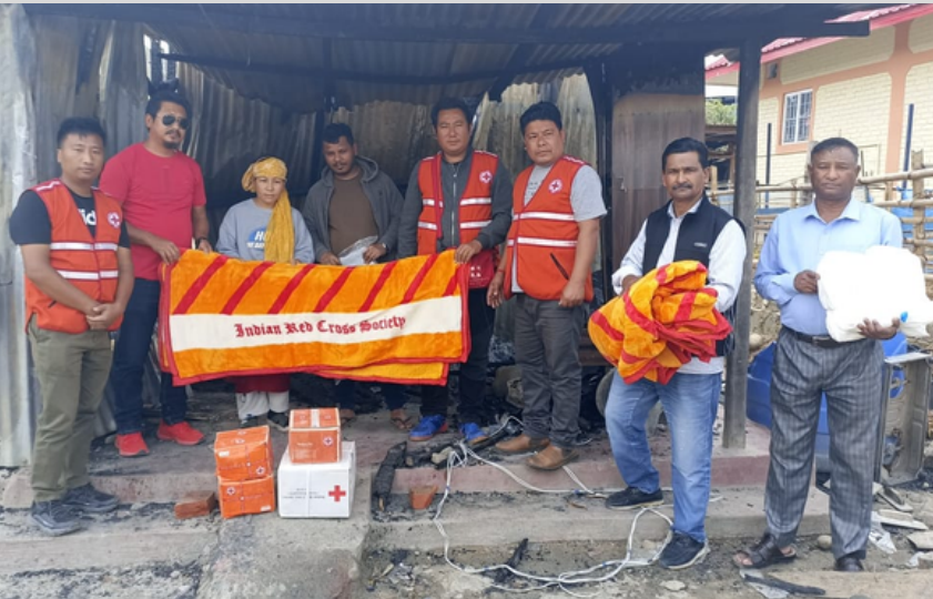
Volunteers from the IRCS Senapati district branch in Manipur visited the fire victims and provided for relief at Kalapahar, Kangpokpi district.