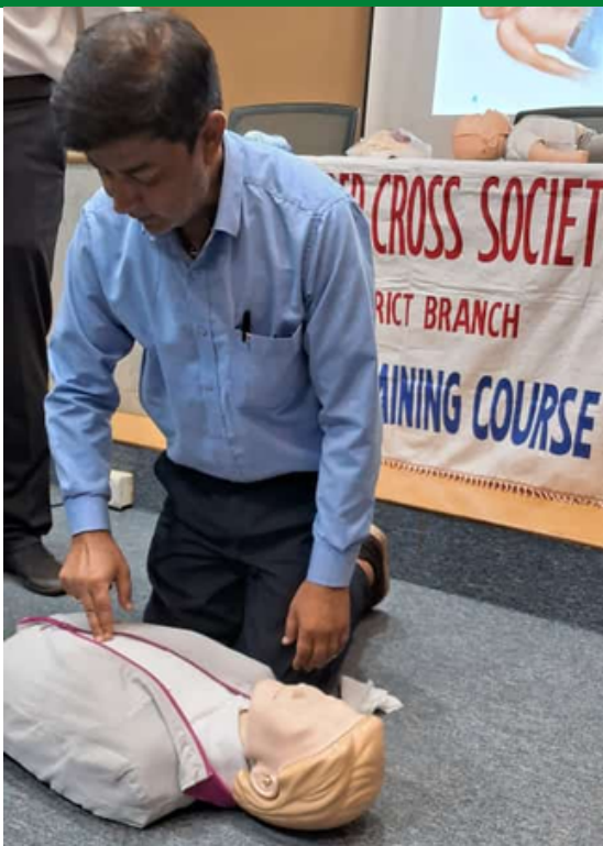
First aid training was held by IRCS Pune district branch, Maharashtra