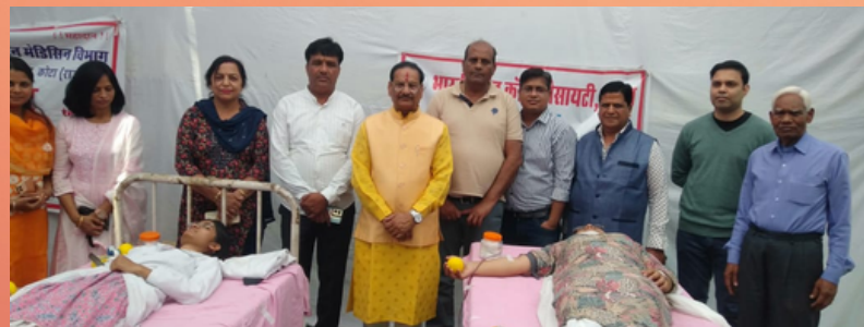
Blood donation camp, Kota, Rajasthan