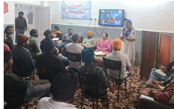
IRCS, Punjab State Branch, Drug De-addiction Centre, Patiala organised No Smoking Day to create awareness about the destructive impacts of smoking