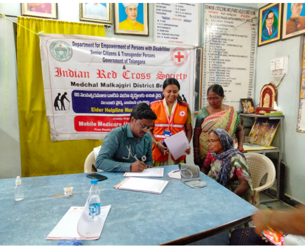
Health camp, Medchal-Malkajgiri district, Telangana