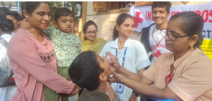
Pulse Polio vaccination campaign was held by IRCS Pune district branch, Maharashtra