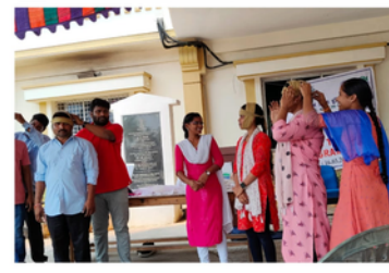
First Aid training program to Employees of Power Grid Corporation of India Limited, Warangal, Telangana