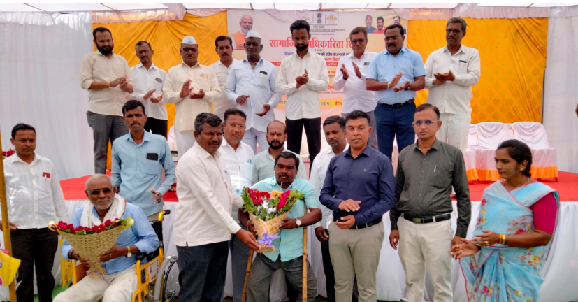
Under the Central Government's ADIP scheme and on behalf of Artificial Limbs of India (ALIMCO), Red cross District disability center distributed assistive materials to 225 disabled persons in Jalgaon, Maharashtra