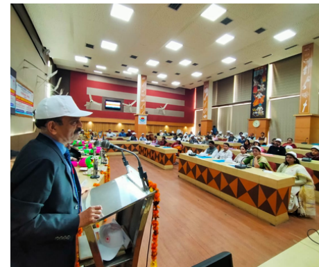
YRC Orientation workshop was held at Kurukshetra University. 155 colleges participated in this event.