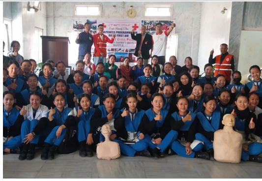
The Imphal West district branch of IRCS Manipur organized a basic first aid awareness training for fourth semester B.Sc. nursing students.