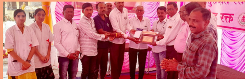
Blood donation camp, Jalgaon, Maharashtra