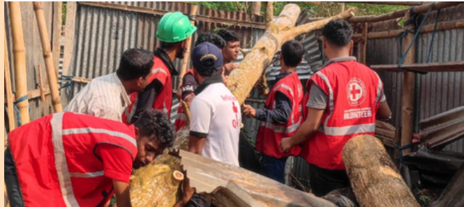
Volunteers from the Sonamura Sub-Divisional Red Cross Society carried out a rescue and fallen tree removal operation in Kentali hamlet, Nalchar R D Block, Sonamura, Sepahijala, Tripura.