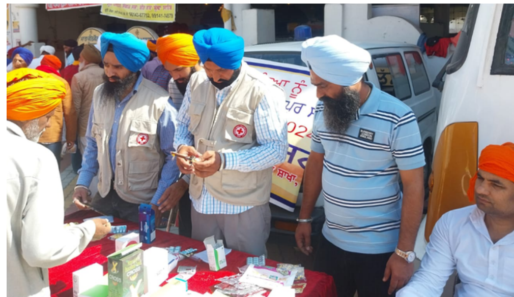
The Punjab State Red Cross Branch in collaboration with district Red Cross Branch, Ropar organised social service camp for providing services to the visiting pilgrimages during Holi Mohalla Shri Anandpur Sahib.