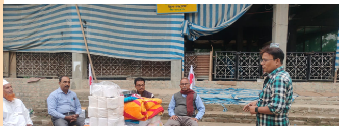
Members of IRCS, Darrang District Branch, Assam visited Mollapara hamlet in the district of Darrang, Assam. There was a community level awareness meeting about first aid. Some sanitizing products, such as tissue papers, soap, and tarpaulins, were handed over to the masjid committee.