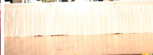
YRC Orientation workshop was organised by Maharishi Dayanand University, Rohtak, Haryana