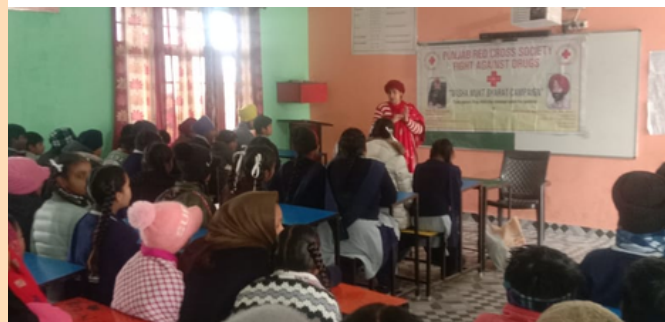
An awareness seminar against drug addiction was organised by IRCS Gurdaspur, Punjab at Government High School, Talwandi Nahar, Gurdaspur