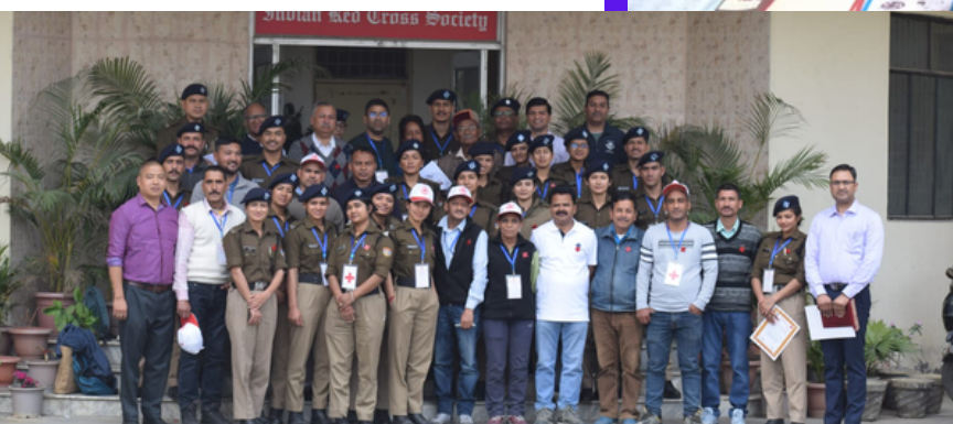
First aid training, Dehradun, Uttarakhand