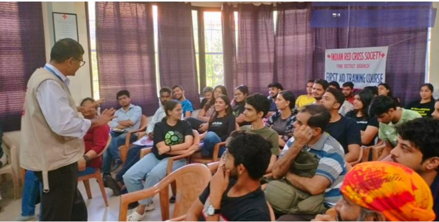
First aid training was conducted for 35 foliage trekkers by Pune district branch, Maharashtra