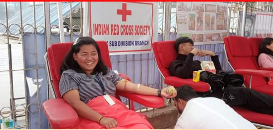
IRCS, Mirik Sub Division Branch, Darjeeling District, organized a blood donation camp. 41 units of blood was collected