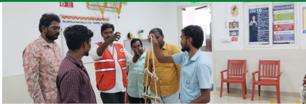
Disaster management training to staff members of Ramco Group Textiles company, Rajapalayam, Tamil Nadu