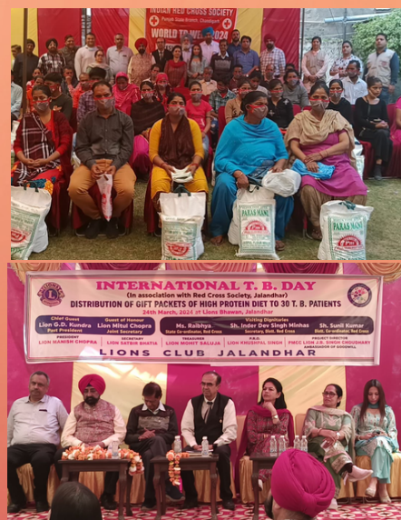
Indian Red Cross Society, Punjab State Branch, Chandigarh in collaboration with Lions Club, Jalandhar and Indian Red Cross Society District Branch, Jalandhar celebrated WORLD TB DAY. Nutrition Kits were distributed to the TB Patients