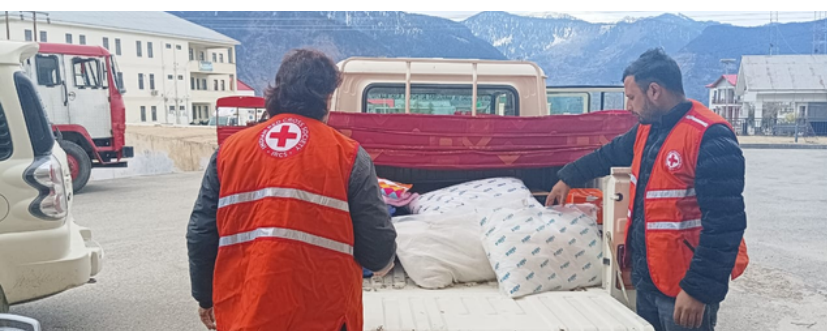
Red Cross Kishtwar district branch of IRCS, J&K provided relief materials to the fire victims of Kharian, Inderwal and Chatroo.