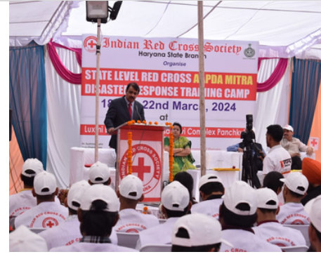
Indian Red Cross Society, Haryana State Branch inaugurated State Level Red Cross Aapda Mitra Disaster Response Camp on 18th March, 2024 in association with Revenue & Disaster Management Department, Govt of Haryana.