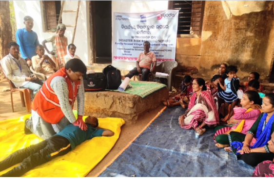
Disaster risk reduction workshop was held in a remote village, Jamkkol, Boudh District, Odisha