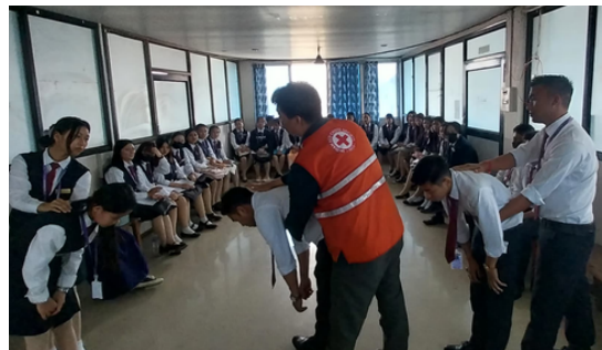
As a part of capacity building program, Imphal West District Branch of IRCS Manipur State conducted basic first aid training for students of BSc. and Diploma of Operation Theatre Technology and Medical Lab Technology