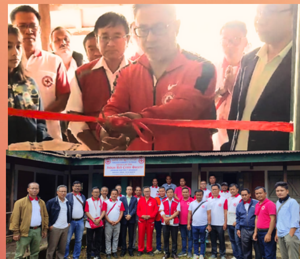
A temporary office of the IRCS, Jiribam District Branch, Manipur was inaugurated by Chairman, IRCS, Manipur State Branch on 28th March, 2024.