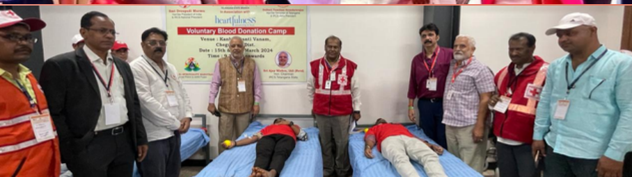
Indian Red Cross Society, Telangana State Branch, held a voluntary blood donation camp at Chegur RR district, Telangana. Hon'ble President of India & President of IRCS, Smt. Droupdi Murmu graced the occasion. Dr. Smt. Tamilisai Soundaram, Hon'ble Governor of Telangana and IRCS State President was also present.