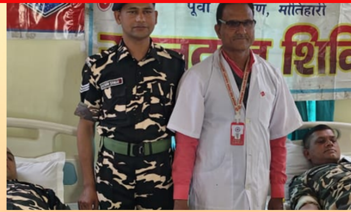
Blood donation camp, West Champaran, Bihar