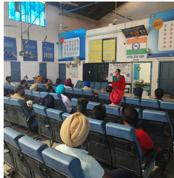
An awareness lecture was organized by the IRCS, Punjab State Branch Drug De-addiction Centre, Patiala at PRTC Headquarters, Driving Training School, Patiala to educate drivers, conductors, and students