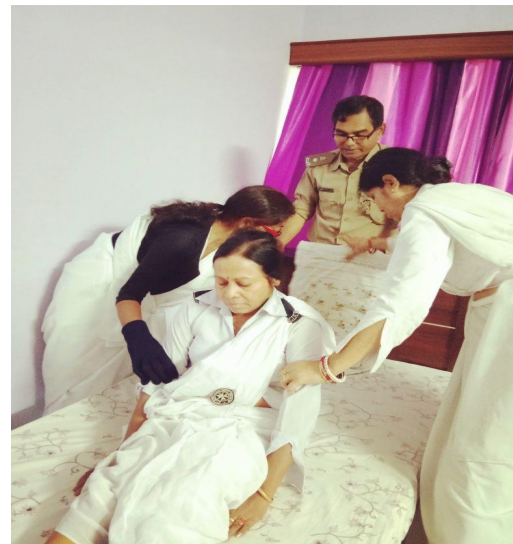
Home Nursing Training Camp of Garden Reach Nursing Division