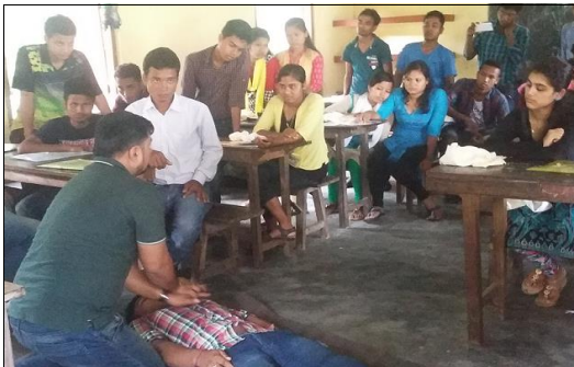
Demonstration of CPR in a First Aid Training Camp