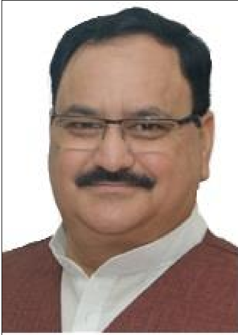
Shri Jagat Prakash Nadda Our Chairman