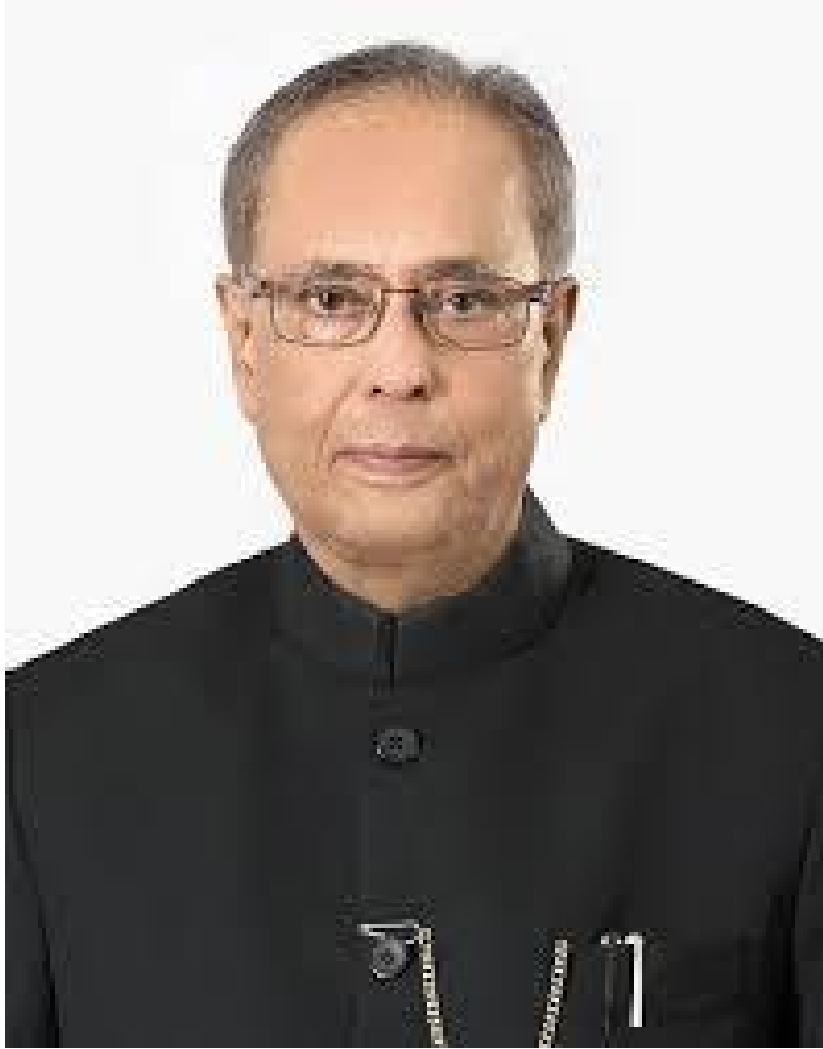
Hon'ble Shri Pranab Mukherjee Our President till 24 th July 2017