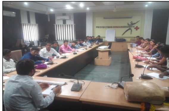
View of First Aid Trainings