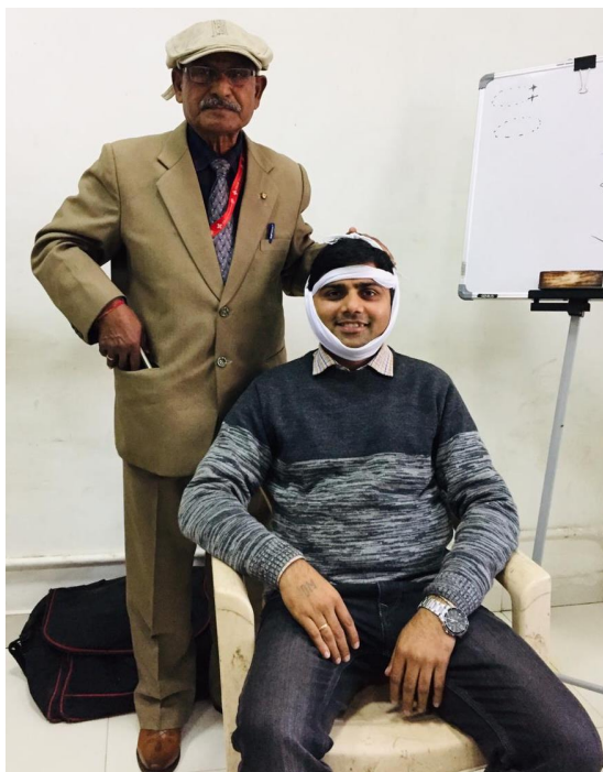
View of the First Aid Training

Training of FMR provided free of cost by the State Centre. FMR's work in the disaster affected areas. This year they provided first aid, distributed relief material in the districts of Uttarakhand namely Pauri and Uttarkashi. Total number of beneficiaries to whom relief material provided were 106.