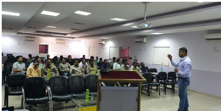
View of First Aid Training at JINDAL, Patratu( Ranchi) ó JHARKHAND.

Organized free Eye Camp at Haji Nagar, Chas ó Bokaro (170 patients were treated).