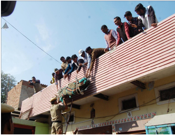
Brigade Volunteers giving demonstration for rescuing the casualty at Narnaul

District St. John Ambulance Centres have trained volunteers in First Aid & Home Nursing trained Brigade Officers and Cadets to handle the situations during any Disaster to prevent the spread of panic and other misunderstandings among public and to provide immediate First Aid to the injured. The Brigade Divisions and volunteers participated in the Mock Drill of First Aid to the injured. During the year 2017-18, 3116 Brigade Cadets/Volunteers (2561 male & 551 female) of St. John Ambulance, Haryana participated in Mega Mock Drills in their respective districts.