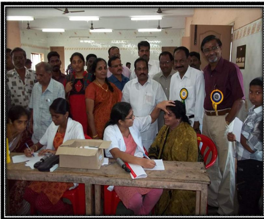
Free Eye Camp Conducted by State Centre

The State Centre provides food to orphanages so as to commemorate St. John's Day.