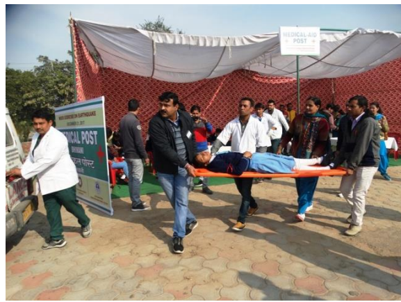
Cadets of St. John Ambulance Brigade lifting the casualty during mock drill