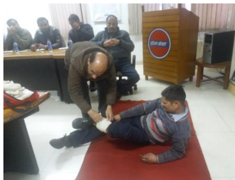
Awareness & First Aid Training programme at Jammu Region