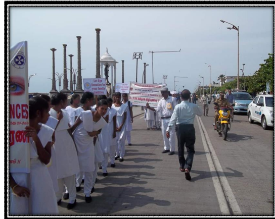
Rally on Safety & Role of F.A during Road Accident