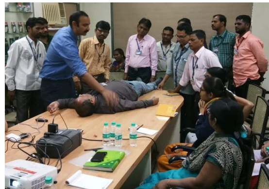
View of the First Aid training Class