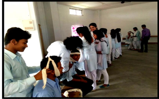
First Aid Training Camp