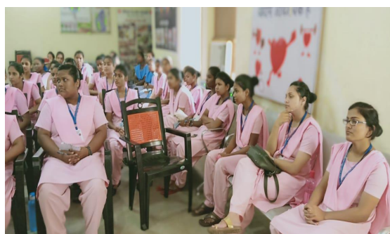
View of the Demo sessions - First Aid Training at I.R.C.S. Bihar State Branch