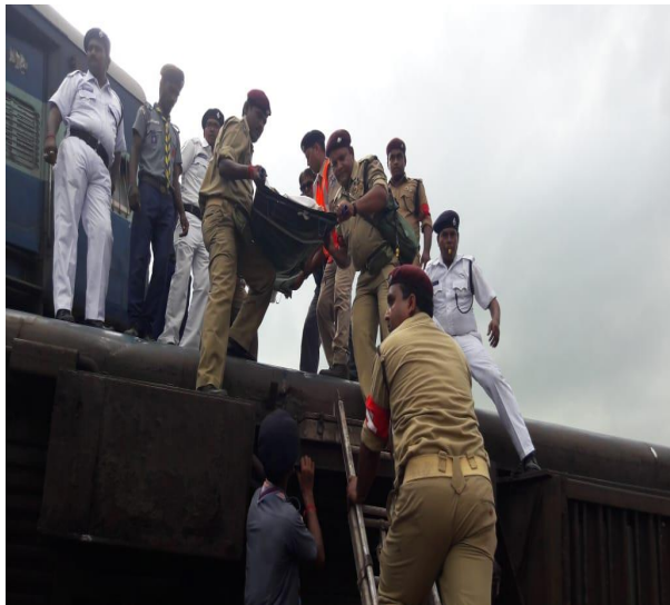
SJAB members of No.22 (S.E.Rly.) District participating in Mock Drill

In S.E.Rly., the Brigade Wing No.22 (S.E.Rly.) District continued to serve the train passengers in trains & at Rly. Stations as well as the general public at large gatherings, emergencies and catastrophic situations by providing first aid at stat and transporting serious casualties to hospitals. Their members attended the National Service Camp at PURI during Car Festival like every years. They extend their helping hands during the Puls Polio Immunisation programme organised by the medical deptt. of S.E.Rly. Chakradharpur Ambulance Division, Kharagpur Ambulance Division. The Santragachhi Ambulance Division also organised Health Check Up and Cancer Awareness-cum-Detection Camp like previous years at the premises of Tikiapara EMU Carshed. All the 12 Ambulance and Nursing divisions of this District organised their Annual Training Camps during the year.