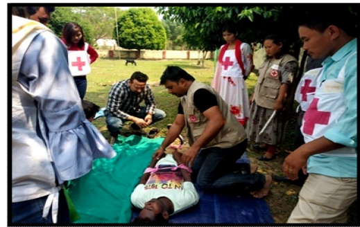
First Aid Training To the Community Volunteers Training Camp