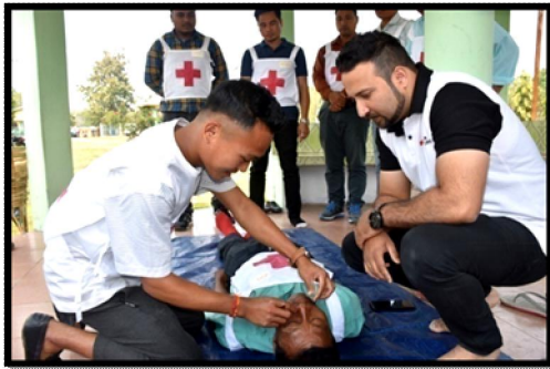
View of First Aid Training

Total 40 nos. of FMR volunteers and First Aiders took part in the programme for 7 days and more than 700 pilgrims were given First Aid medical aid and other Ambulatory Services.