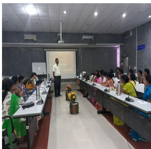
View of the Medical Camp & First Aid Training