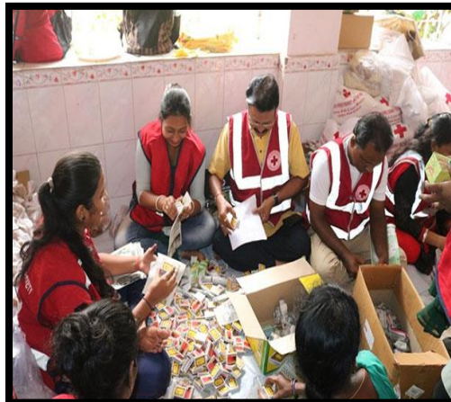
Packing of dry food/relief by volunteers at IRCS state branch office