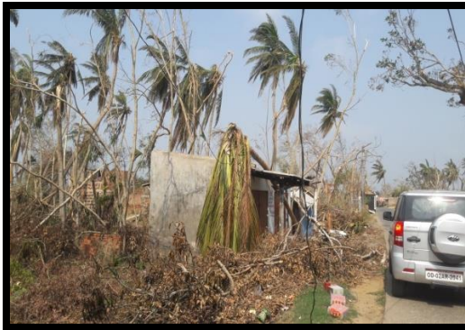
Shops and other commercial places are also affected