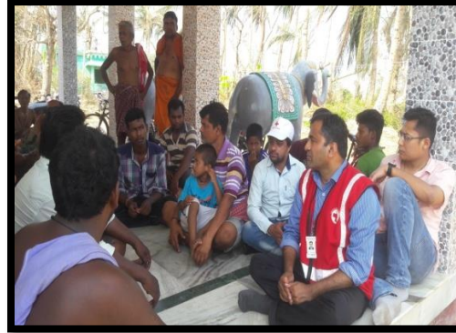
Interacting with the affected community people