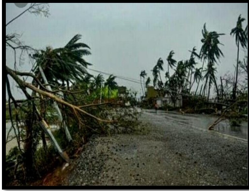
Roads are blocked due to uprooted of trees and electric poles