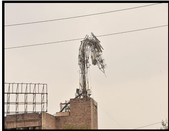
Breakdown of mobile and internet communication