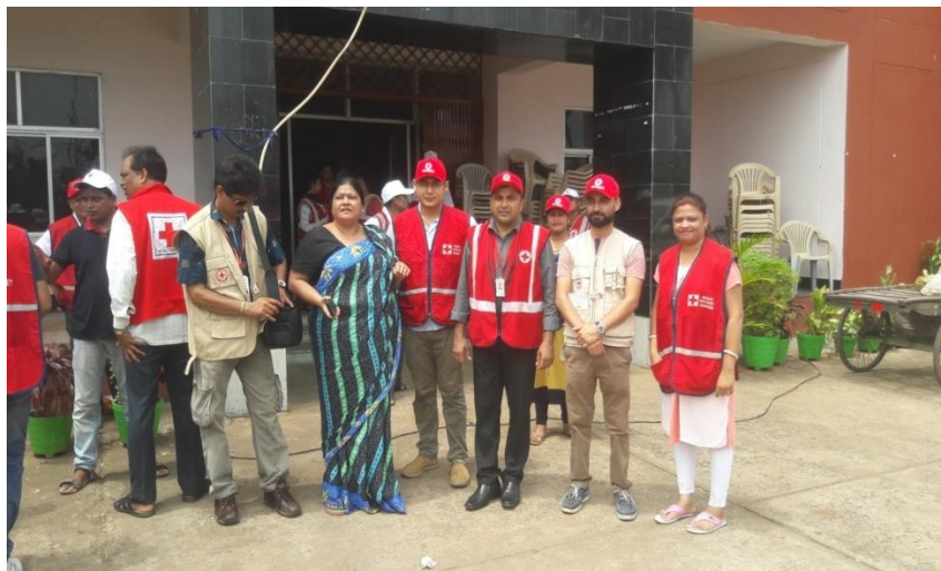
Assessment team with the General Secretary of the Odisha state branch