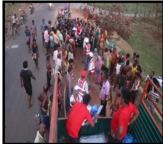
Relief distribution by the IRCS Odisha state Branch to the affected families of Puri district