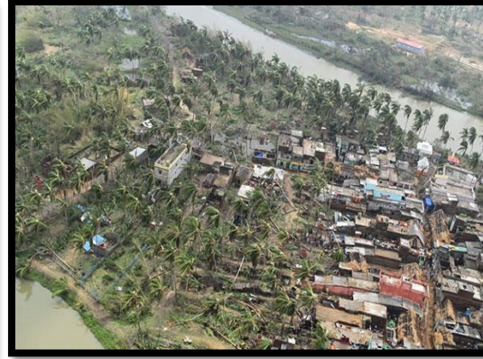
Ariel view of affected communities

In Puri district extensive damages have occurred to kutchha houses. As per report received so far 1,89,095 no. of houses damaged in Puri.