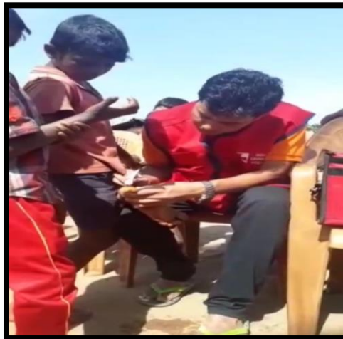
Relief materials packing for distribution by state branch First Aid Trained volunteers delivering First Aid services