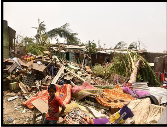
Loss of property and shelters