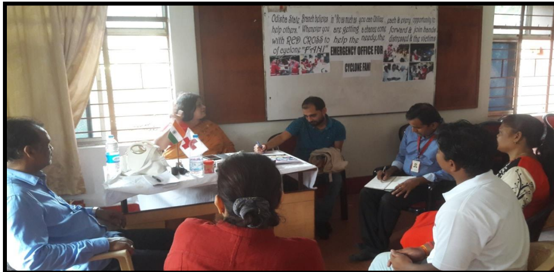
Debriefing with the General Secretary and staff of IRCS, Odisha State Branch and RDRT