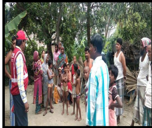
Volunteers visiting the villages alerting the people about the cyclone