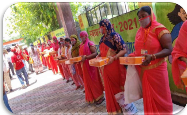
Hygiene Kits given to Multi Tasking Staff Lakhimpur, U.P

The Telangana state branch selected communities and schools in four districts i.e., Nizamabad, Sanga Reddy, Nagar Kurnool and Karimnagar under the SERV Program. Hygiene kits were distributed to vulnerable and needy in these districts of Telangana - Karim Nagar (510), Nagar Kurnool (614), Nizamabad (410) and (452) families at Sanga Reddy district. 4375 nos. of tarpaulins were also sent from NHQ. Out of which 1200 nos. were distributed at Karim Nagar, 1100 at Nagar Kurnool, 1050 at Nizamabad and 1025 at Sanga Reddy districts. 52,384 people were benefited through IRCS online slot booking services for vaccination. In all, despite covid pandemic, the Telangana state branch conducted 22 nos. of trainings in four districts and trained a total of 1060 no. of SERV volunteers.