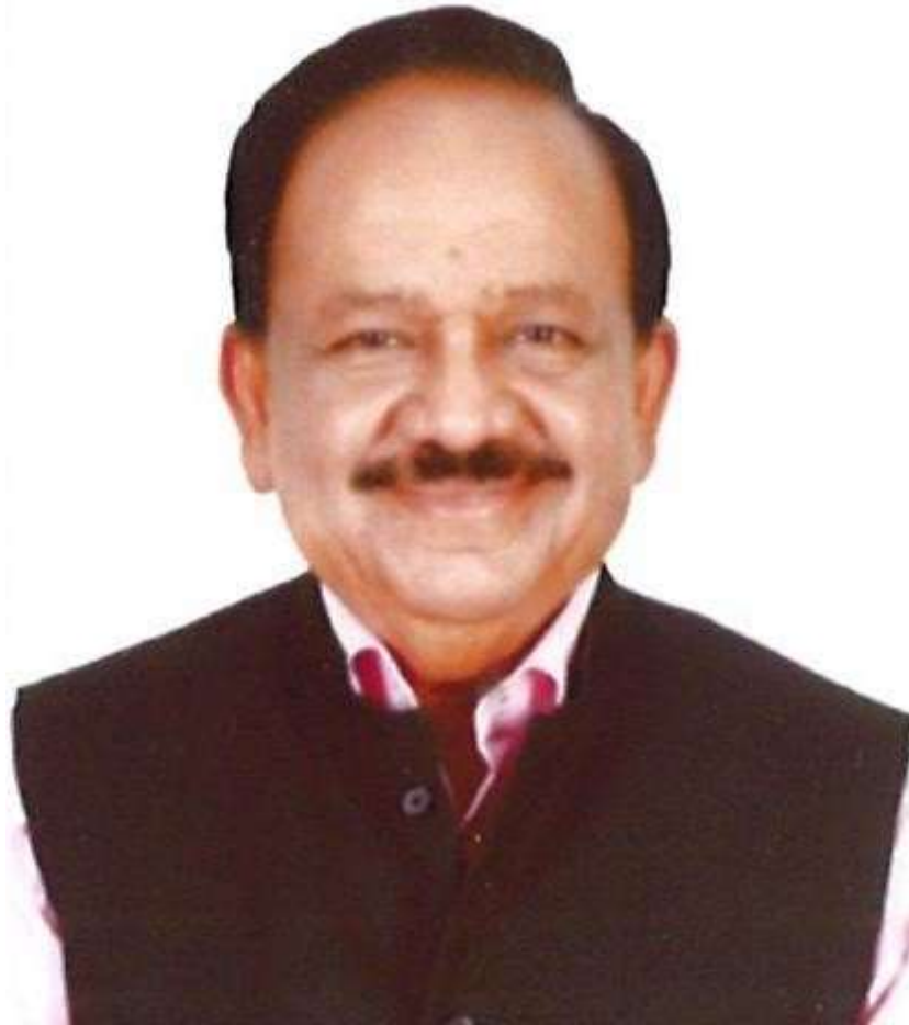
Dr. Harsh Vardhan Our Hon'ble Chairman