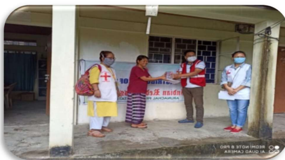
Principal Abotani Vidya Niketan, Pachin Colony & Govt. Middle School Popu-II. 22.09.2020.