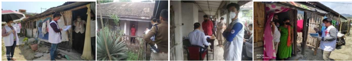
The Volunteers of IRCS, APSB giving door to door awareness on COVID-19 cum awareness and tracing out the quarantined at Helipad (left), Miya and Prem Nagar colony of Naharlagun, Arunachal Pradesh.

Phase -1 Tracing out the Quarantined, Stranded Students and door to door awareness cum counseling on Covid-19 pandemic,2020, from 31 st March to 9 th April 2020: The Volunteers of IRCS, APSB were assigned the task of tracing the home quarantined persons assisted by District Medical Officer, Capital Complex in Naharlagun, Itanagar and Banderdewa, maintaining social distance.