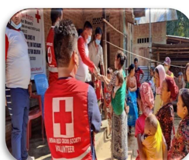
Distribution of Hygiene kit, Manipur

Medical equipments, Personal protective suit (PPE), masks, gloves, sanitizers, face shield, food supplement etc. were being continuously donated by Domestic & International donors. Some of the major donors who donated in Kind during this period included French Govt., Govt. of Vietnam, Vietnam Red Cross, IFRC, ICRC, UAE, USAID, M/s TECC, HLL, M/s Ali Baba Foundation, M/s Temasek Foundation, M/s Taipei Economic & Cultural Centre, M/s KAB Welfare Foundation, State Bank of India etc.