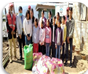
Visiting Adore Children Home Noklak