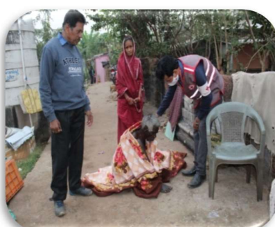
Distribution of Blanket, Odisha