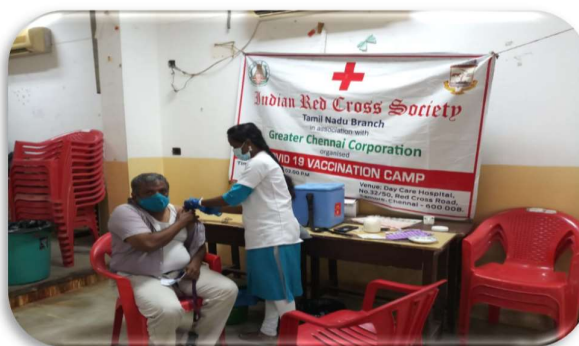
Vaccination drive, Tamil Nadu

IRCS also considerably stepped up and scaled up its health response in clinical services and preventive services in response to the crisis and assisted the MOHFW in the logistics of procuring essential medical equipments and supplies. IRCS also initiated several approaches to adapt to the new constraints of aid delivery including, mobile blood donations and COVID-19 testing. The Ministry of Health and Family Welfare had established a cell comprising representatives from the Ministry of External Affairs (MEA), Customs, Ministry of Civil Aviation (MoCA), HLL, National Disaster Response Force (NDRF), Department of Military Affairs (DMA) and IRCS to facilitate humanitarian aid donations from foreign countries to the Government of India.