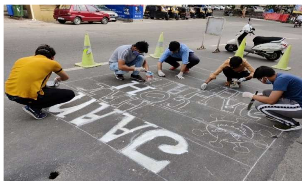
Covid- 19 Awareness drive by street painting, Jammu

Training webinars for volunteers and staff were held and guidelines for safety of staff and volunteers were issued. IRCS branches continued their efforts throughout 2020 slowly relaxing as the number of cases subsided towards the end of 2020 but scaling up as the number of cases started to rise in early 2021.