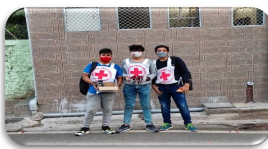
Youth Activity, IRCS, Assam