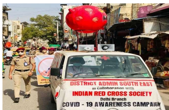
Covid-19 Awareness drive, Delhi