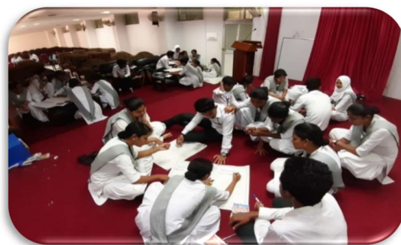
03 Days District Level Training of SERV Scale up Program