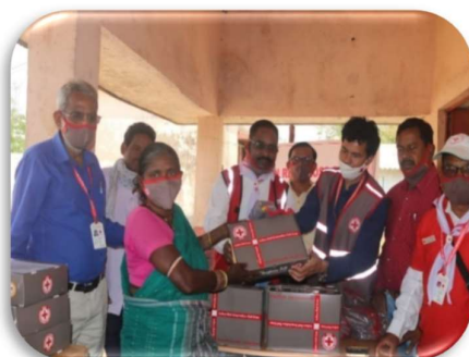
Distribution of Hygiene Kit, Odisha

Amid unprecedented surge in the number of Covid-19 cases across India, the global community, which included Govts. of several Countries, Partners National Societies, IFRC, ICRC, Association of Indians leaving abroad & People of Indian Origin (PIO), have extended a helping hand in cash and kind and supported the efforts of the country in its fight against the pandemic.