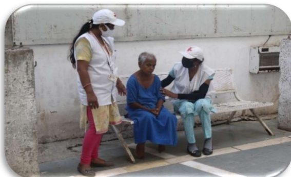
Providing mental support to Corona patient, Faridabad

IRCS was involved in supporting vulnerable affected persons in different ways, including restoring family links (RFL), helpline services, etc.