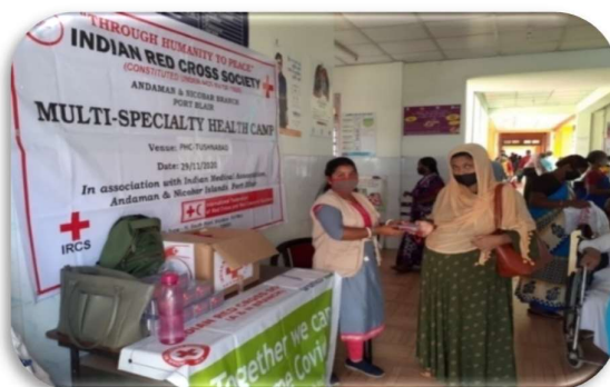
Multi-Specialty Health Camp under SERV Scale up Programme