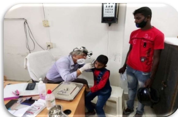
Multispecialty health camps at Port Blair, South Andaman

The participants were also trained on the basic principles and practice of first-aid, assessment in first-aid, basic life support, safe handling and transportation of patients. Andaman & Nicobar UT branch also conducted three blood donation cum motivation camps with support of the blood bank, G.B Pant Hospital, Port Blair, South Andaman. 3 multi-speciality health camps were also conducted in South Andaman district and a total of 753 patients were benefited.