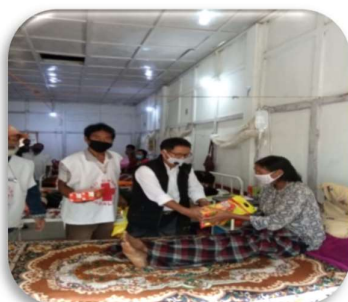
Visiting sick patients in hospitals