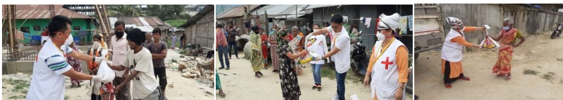
At Helipad Colony (from left) Har Ek Maal colony and Iekhi, Arunachal Pradesh.

Phase 3- Distribution of rice, dal and salt at Colonies of Naharlagun to the poor and the needy was held by Executive members and Volunteers of IRCS From 29 th April to 2 nd May,2020. Hand sanitizers, masks & food items were distributed to the poor and the needy at various colonies of Itanagar.