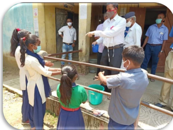
Awareness on Best practices of Hand Washing, Assam

Indian Red Cross Society scaled up preparedness & response to tackle the Corona pandemic by initiating a myriad of awareness activities and distribution of IEC materials in local languages, distribution of personal hygiene items, food and dry ration packs, community surveillance and community counseling, logistic support to quarantine & isolation centres, establishing connection with families of migrants and providing shelter homes to them, ambulance and transport services for patients, disinfection of public places, installation of pedal sanitizers & hand-washing kiosks; home delivery of food and medicines to patients with chronic diseases, pick-up and drop-off facility to individual blood donors, mobile blood collection, 24/7 control room for blood requirements and psychosocial support etc.