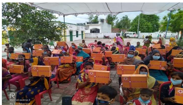
Distribution of Hygiene Kit, Uttar Pradesh