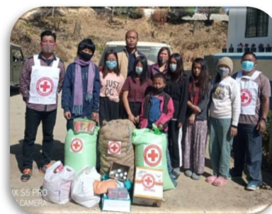
Relief to Children home Peren