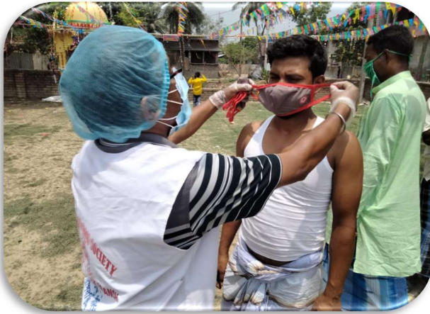
Awareness on wearing mask, West Bengal

COVID-19 is an infectious disease caused by a new virus named SARS-CoV-2. On 30 January 2020, following the recommendations of the Emergency Committee of the WHO its Director General declared that the COVID-19 outbreak constitutes a Public Health Emergency of International Concern. The first case in India was confirmed on 30 January 2020. After a period of low activity, cases started increasing gradually. By early to mid-March 2021, the government had drawn up plans to deal with the threatening outbreak in the country. Covid cases galloped in US and several European countries. There was global turmoil and medical facilities started crumbling wherever positivity rates were high. The spread was fast and furious.