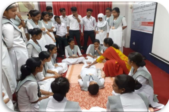
03 Days Volunteers Level Training at Port Blair, South Andaman

The Social and Emergency Response Volunteer (SERV) Programme is designed to build community resilience through training of the target group by Master Trainers, Instructors and SERV volunteers on a pan India basis. SERV volunteers impart health and disaster related messages apart from leading social campaigns in the community. They are at the fore front as first community responders in case of any disaster etc.