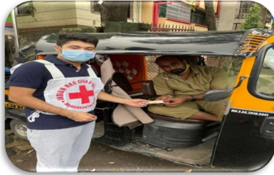
Youth Activity, IRCS, Maharashtra