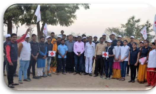
Youth Activity, IRCS, Gujarat