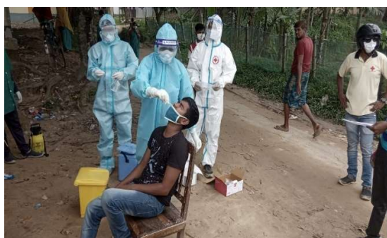
Corona Testing, Tripura