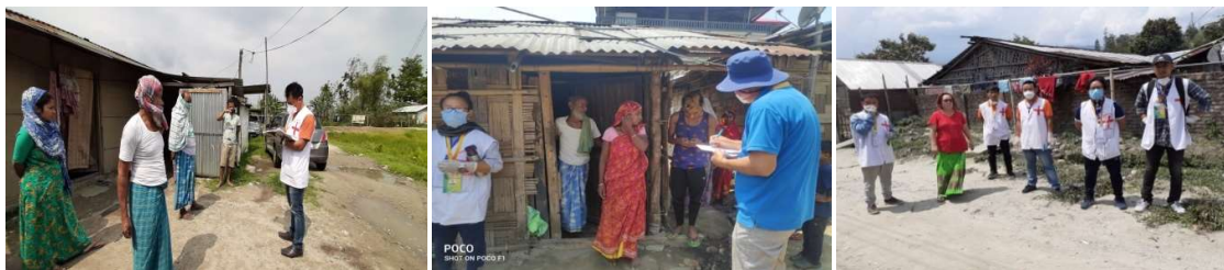
At Helipad (from left) Panchayat and Down colony, Naharlagun, Arunachal Pradesh.

Phase -2 Following up and listing of beneficiaries for the distribution of food essentials was held from 10 th April to 28 th April,2020.