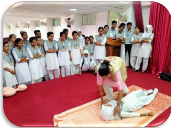
03 Days Volunteers Level Training at Port Blair, South Andaman

SERV volunteers act as key participants during this community-based approach. The aim of developing SERV volunteers is to reduce disaster risks and build resilient communities, as envisaged in Sendai framework for action.