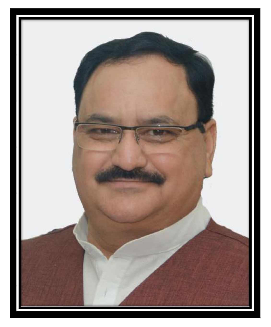
Managing Body 2016-17