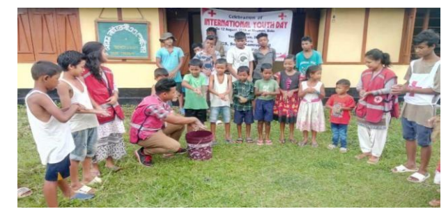
Hand wash conducted by Assam, Red Cross Volunteers on the occasion of International Youth Day.