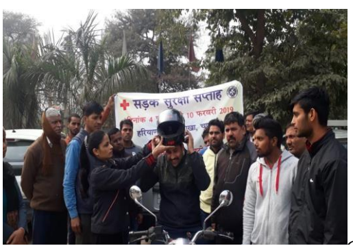
Volunteers of Red Cross giving message of Road Safety during the campaign run by District Red Cross Society, Guruqram

Special drive has been started against misuse of Red Cross Emblem in all the districts under the Red Cross Branches in Haryana. The Youth Red Cross and Junior Red Cross units are specially instructed to make aware the general public about the emblem of Red Cross. A special drive