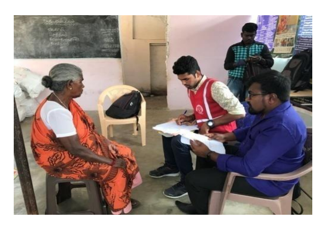
Tamil Nadu refugee camp visits and National level FNS focal person trainings