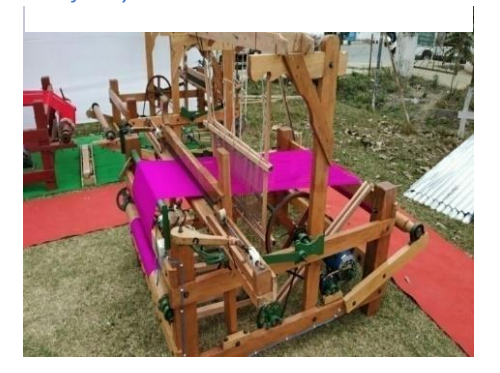
Power loom given to female beneficiary in Manipur

Thus the livelihood project has covered the entire project area including landless and landholder farmers in Odisha and Maharashtra.