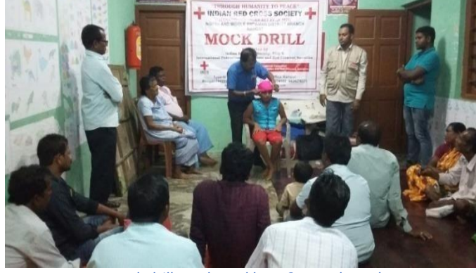
Mock drill conducted by A & N UT branch