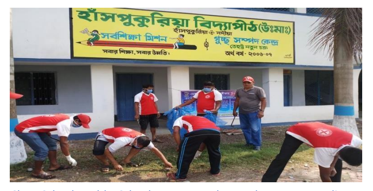
Clean School Healthy School program under Youth Program, Nadia Dist, West Bengal