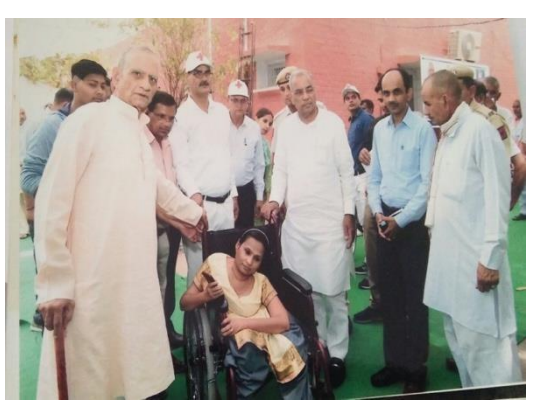
Distribution of artificial Aids & Appliances to the physically challenged persons organised by District Red Cross Society, Jind

The bus is being mobilized in rural/urban areas of the district accordingly to the calendar prepared and provides artificial limbs, aids & appliances for PWD's at their door step. The Mobile Van services initiated by Red Cross Rehabilitation Centre, Faridabad and provide services to the other 4 districts i.e. Palwal, Mewat, Gurgaon and Narnaul.