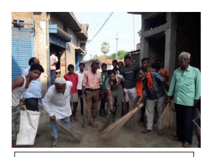
Cleaning of the surroundings by community people under Swachh Bharat Abhiyan, Khagaria, Bihar

IRCS NHQ approached Singapore Red Cross for providing financial support for SERV Program. After their funding support, the NHQ released working advances to the target branches. The 13 branches reported expenditure of INR 2884930 after utilization.