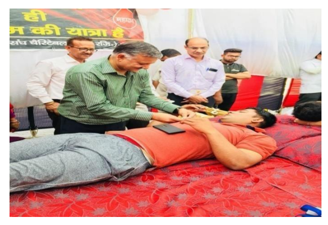
General Secretary, IRCS, Haryana State Branch encouraging blood donor at Blood Donation organised by District Red Cross 55 Society, Panchkula

b) Target for 1% Voluntary Blood Donor of Total Population: The branch is