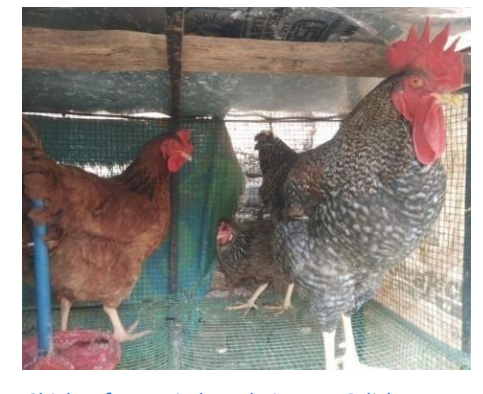
Chicks of Banraja breed given to Odisha beneficiary

production and brought economic stability to a good level. IRCS has also assisted the landless and physically disabled farmers with Goat and Chicks as a second option of income generation.