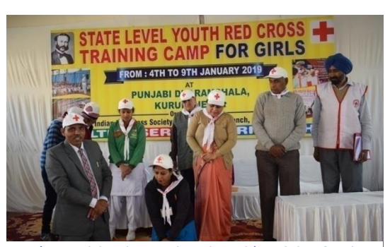
Youths Participating During First Aid Training Session

The services of Red Cross are carried over in all the schools is called Junior Red Cross services. All the students of 17,300 Govt. schools are the members of Red Cross. Membership subscription is collected from each student at the time of admission.