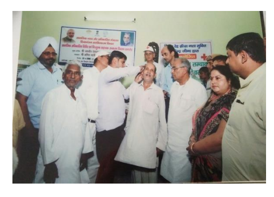
Distribution of Hearing Aids to the Senior Citizen during Health Camp organised by District Red Cross Society, Jind

d. Cochlear Implant Under ADIP Scheme in Haryana (for Deaf & Dumb Children) Indian Red Cross Society, Haryana State Branch has taken initiative to provide assistance in Cochlear implantation Scheme of Govt. of India, to the children. In this regard awareness derive has been initiated on World Red Cross Day in each District Red Cross Branch in Haryana. During the year 2018-19 total 108 children registered and 40 children