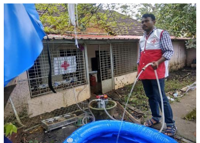
Water purifier installed at the site

The efforts and contributions of the Indian Red Cross Society towards Disaster Relief Operations during