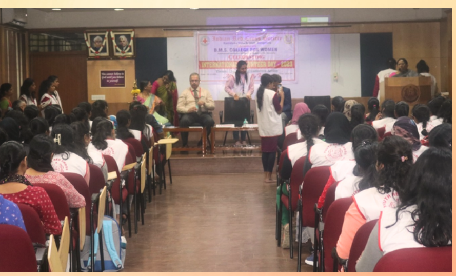
Karnataka State branch in association with BMS College for women, Basavanagudi, Bangalore, celebrated International Volunteer Day