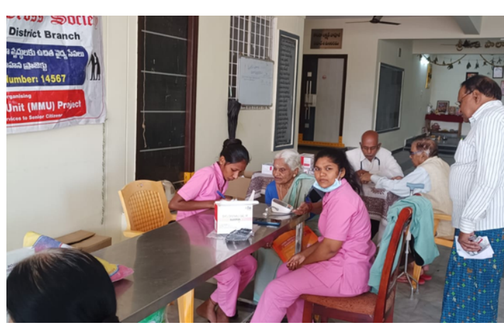
Health camp for senior citizens, Ranga Reddy district branch, Telangana