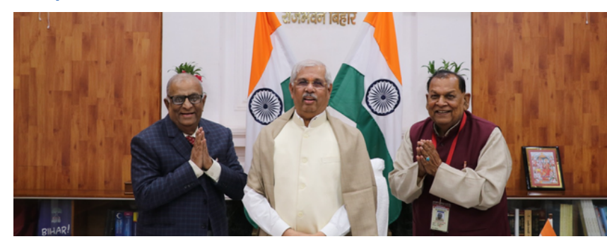
Chairman & Vice Chairman of the IRCS, Bihar State Branch called on the Hon'ble Governor of Bihar. Discussions were held on the branch activities.