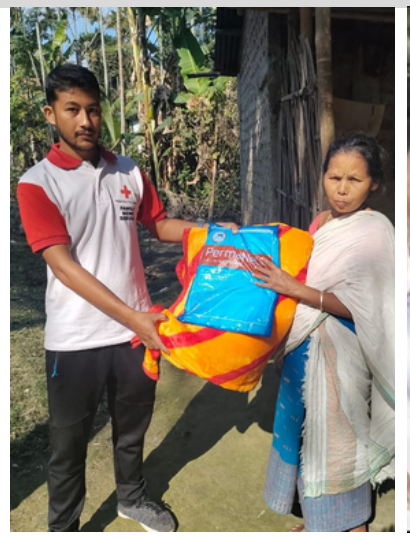
Darrang District Branch, Assam distributed blankets and mosquito nets among 85 needy that included poor widows, old and physically challenged persons