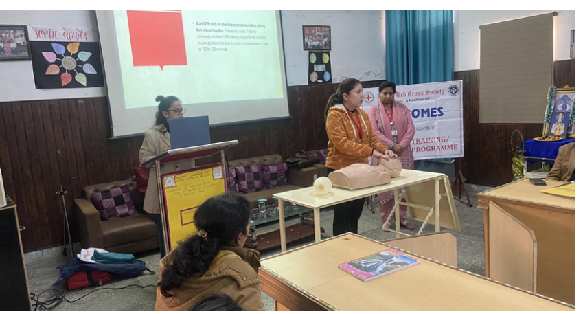
To enhance safety and well being within the Ayurveda College Community, Indian Red Cross Society, J&K-UT today organized First-Aid Awareness programme at Jammu Institute of Ayurveda and Research for their faculty members and Medical Staff.