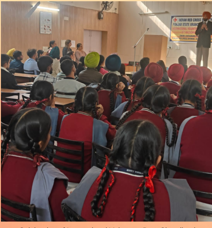
Celebration of International Volunteer Day, Chandigarh, Punjab