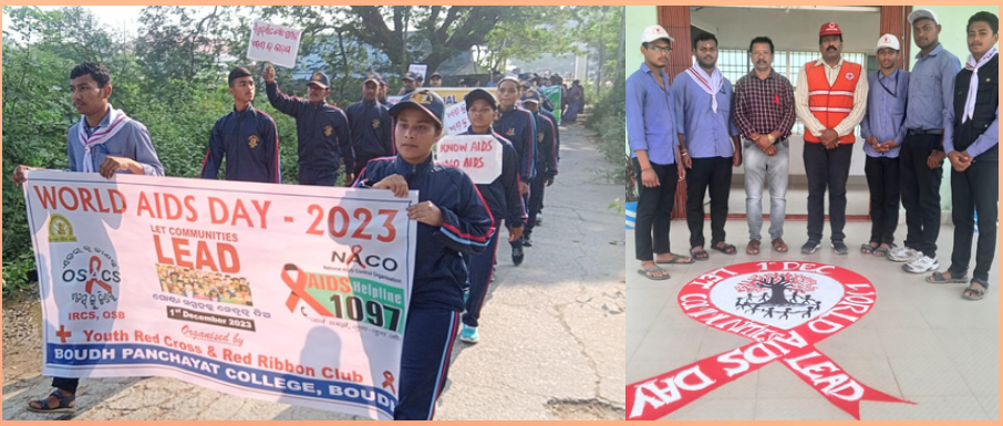
HIV / AIDS awareness rally and workshop, Boudh Panchayat College, Boudh, Odisha