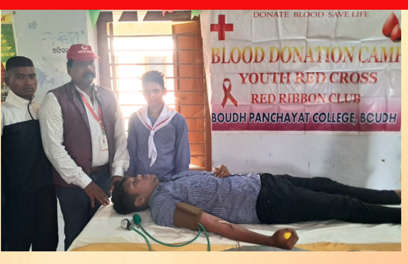
Blood donation camp, Boudh Panchayat College, Boudh, Odisha