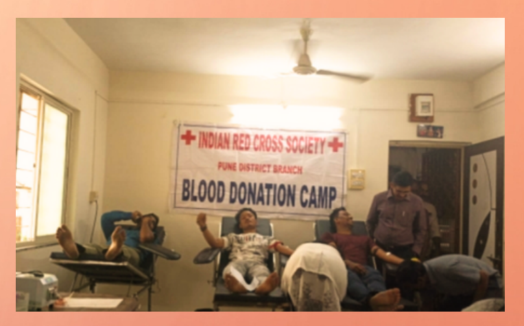
Blood donation camp, Pune, Maharashtra