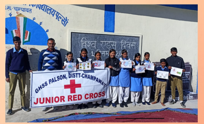
Celebration of World AIDS Day, Champawat, Uttarakhand