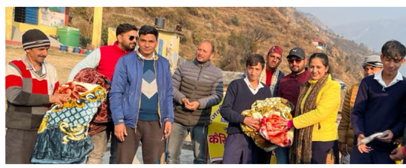
Distribution of warm clothes amongst students and needy at Uttarkashi, Uttarakhand