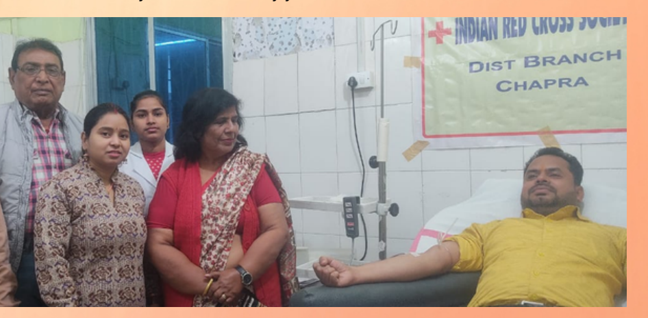
Blood donation camp, Chapra, Bihar