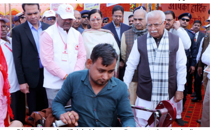
Distribution of artificial aids and appliances to the physically challenged persons by District Red Cross, Faridabad, Haryana in the presence of Hon'ble Chief Minister of Haryana.