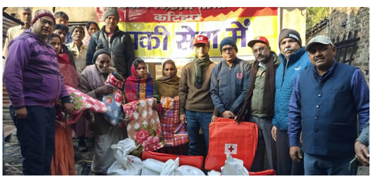
Distribution of relief items amongst fire victims, Katihar, Bihar