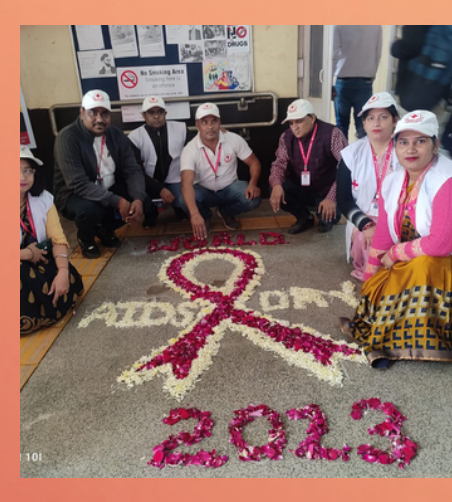
Celebration of World AIDS Day, Faridabad, Haryana