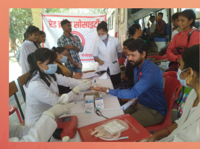
Blood donation camp, Dantewada, Chhattisgarh