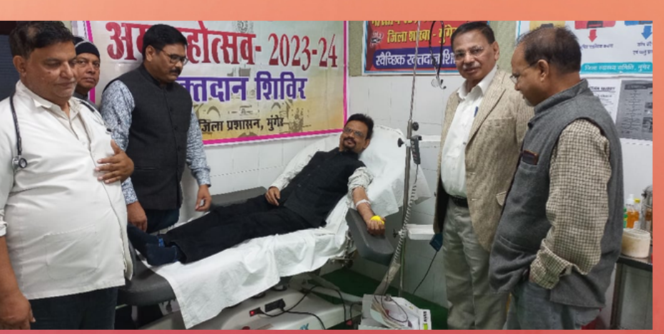
Blood donation camp, Munger, Bihar