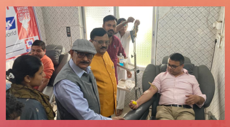
Blood donation camp, Madhubani, Bihar