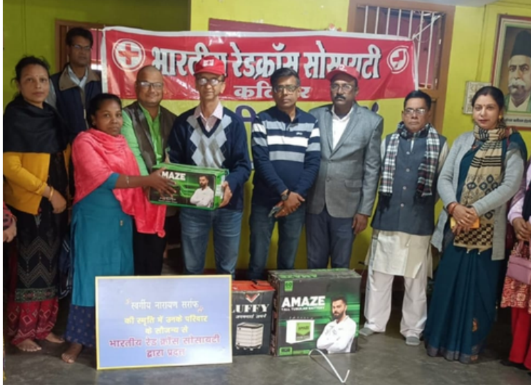
Inverter was provided to girl students living in Vanvasi Kalyan Hostel, Diggi, Katihar, Bihar