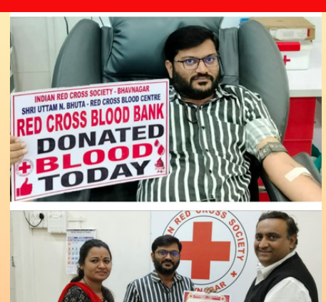
Blood donation camp, Bhavnagar, Gujarat