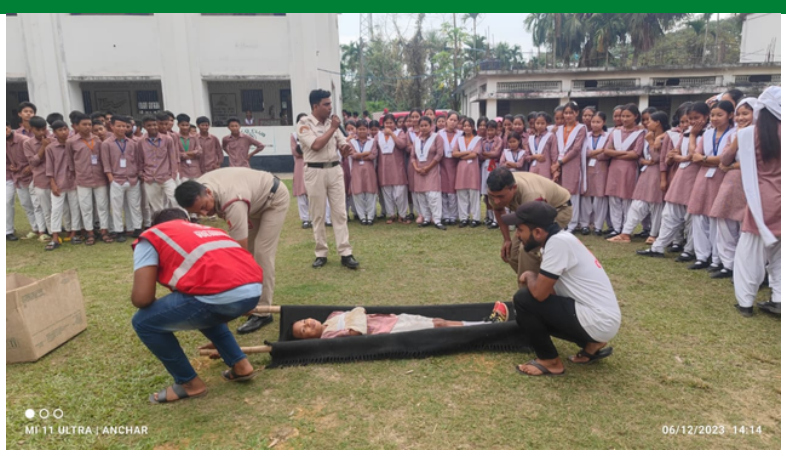
Volunteers from the IRCS, Sonamura Sub-Divisional Branch participated in a school safety program at Taibandal H S School in Sonamura, Tripura.