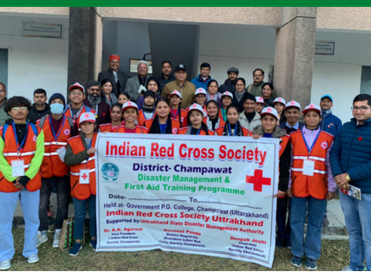
Disaster management and first aid training program, Champawat, Uttarakhand