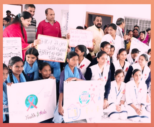
Celebration of World AIDS Day, Lakhisarai, Bihar