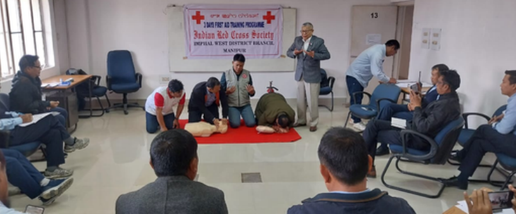
IRCS, Imphal West District Branch conducted 3 days First Aid Training program to Airport Rescue and Fire Fighting Personal at Imphal International Airport. Altogether 20 personnel attended the training and certificate were distributed to them.