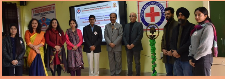
Celebration of World AIDS Day, GDC Kathua, J& K