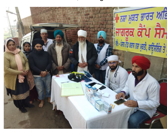
Drug awareness and medical check up camp under Nasha Mukt Bharat Abhiyaan in Shaheedi Sabha at Shri Chamkaur Sahib, Kurali, Punjab