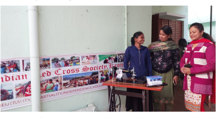
IRCS Keonjhar District Branch, Odisha provided an orphaned girl with livelihoods support (one sewing machine with all the accessories and five thousand rupees).