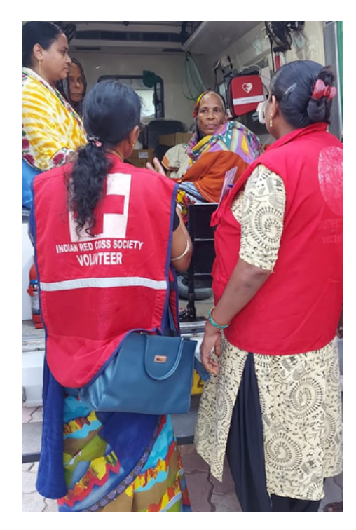
The "seva during Kartik Purnima" program was organized by the IRCS district Red Cross Branch, Puri, Odisha from October 29th to November 27th 2023. Under the program 3098 elderly Habisyalis devotees were provided free food, shelter, and transportation to Shree Jaganath temple.