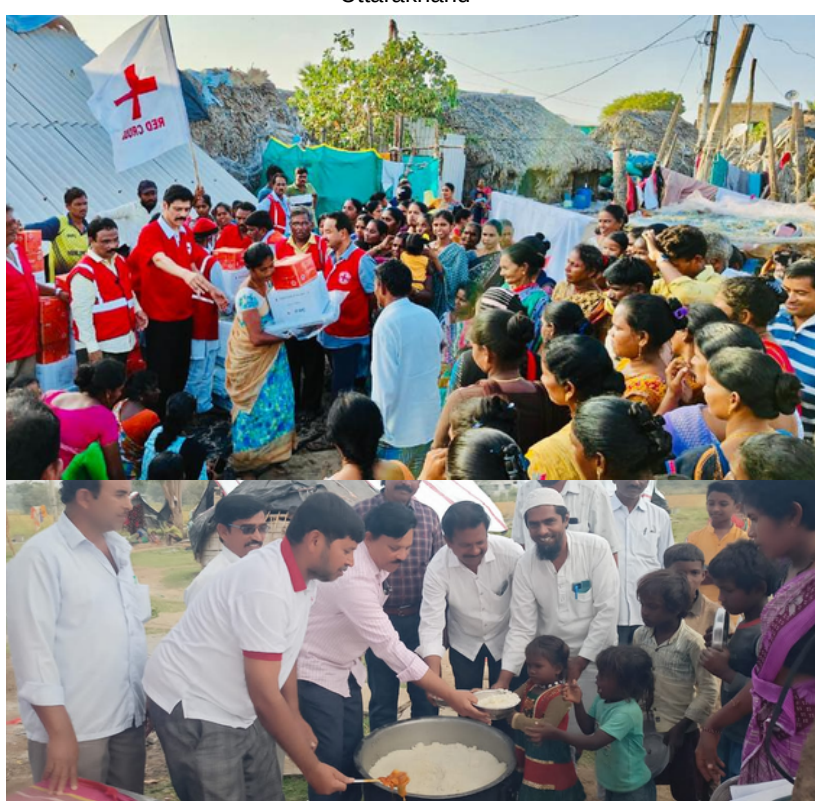
Distribution of relief items amongst needy and vulnerable people in coastal regions of Andhra Pradesh affected by Cyclone Michaung