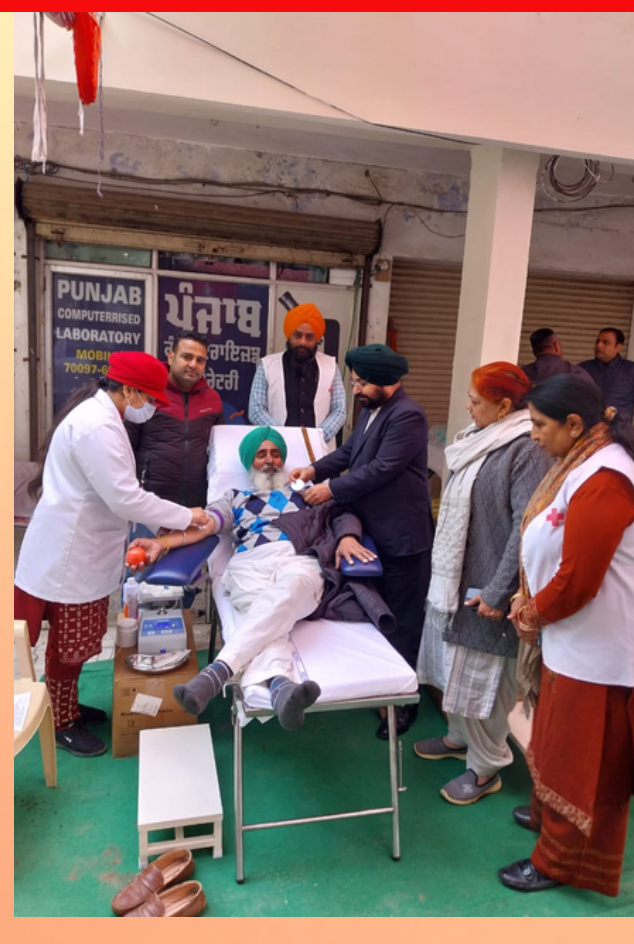
Blood donation camp organised by Indian Red Cross Society, Punjab State Branch at Fatehgarh Sahib.