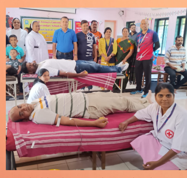
Blood donation camp, Jalgaon, Maharashtra