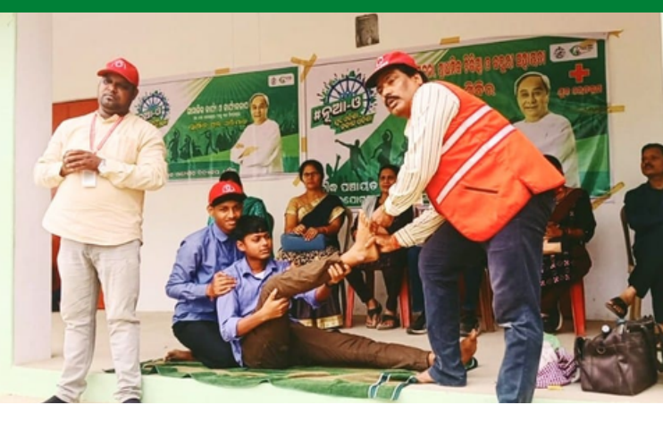
Training in emergency services and first aid was held in Marjakud village, near Boudh, Odisha.