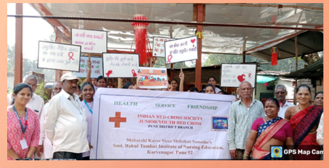
Celebration of World AIDS Day, Pune, Maharashtra