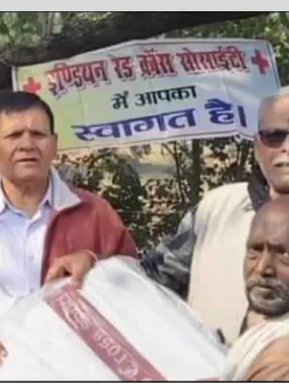
Distribution of tarpaulins and hygiene kits among the dalits in Ukasi village, Bihar.