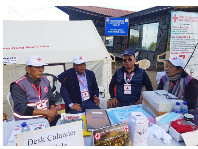
The IRCS Nagaland Branch took part in the Hornbill Festival