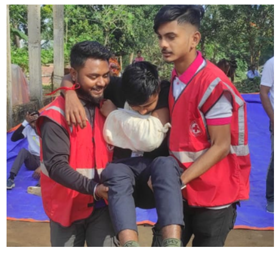
The IRCS, Sonamura Sub-Divisional Branch, took part in a state-level mega earthquake drill at the Sephahijala district headquarters, which was organized by the Revenue Department of Tripura.