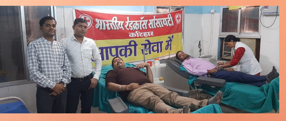
Blood donation camp, Katihar, Bihar