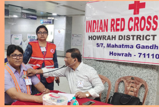
Health checkups and first aid awareness camps were organised at Howrah maidan metro station, Howrah, West Bengal on the occasion of National Safety Day