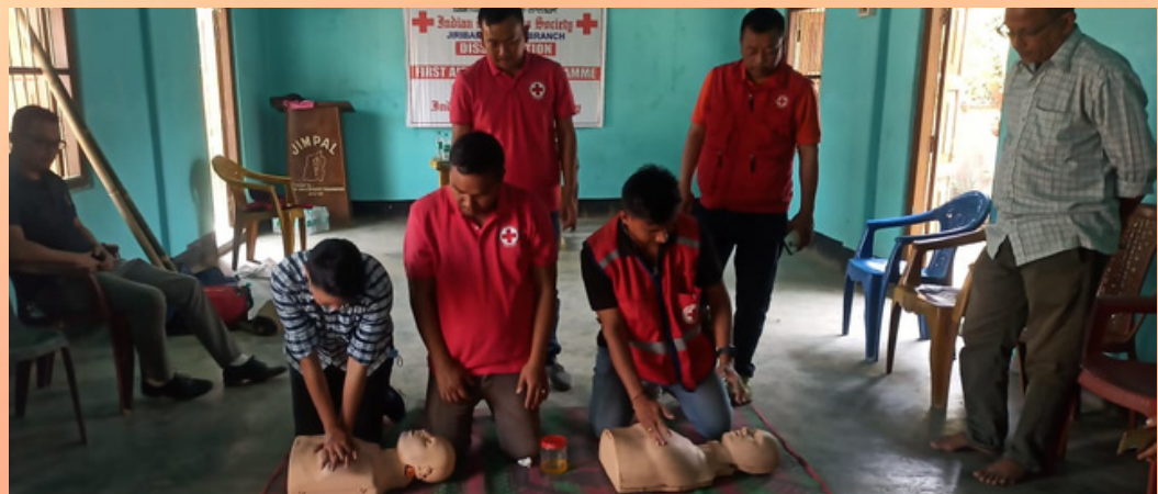
First aid training program, Jiribam, Manipur