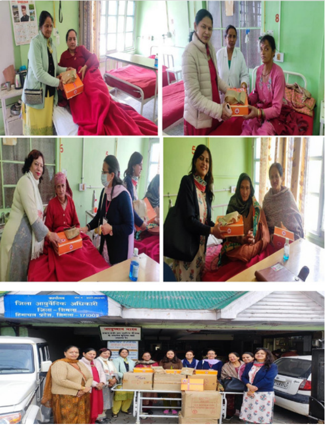
Himachal Pradesh Red Cross along with hospital welfare section distributed hygiene kits among the patients of regional Ayurvedic hospital, Shimla