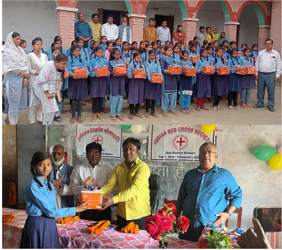
Distribution of hygiene kits, Pupri, Bihar