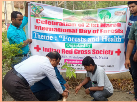
Celebration of International Day of Forests, Nadia, West Bengal