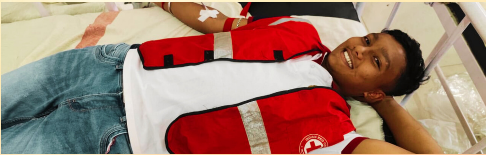
Volunteers of Indian Red Cross Society, Sonamura sub-divisional branch, Tripura donated blood and also participated in blood donation camps