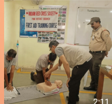
First aid camp was held for the employees of Saint Gobain Sekurit India Chakan, Pune, Maharashtra. 22 people participated in the program