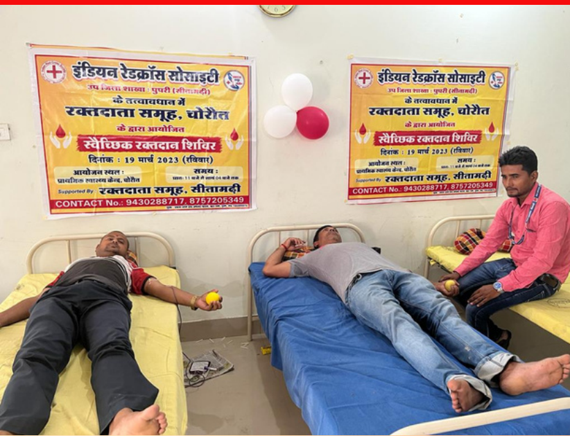
Blood donation camp, Sitamarhi, Bihar