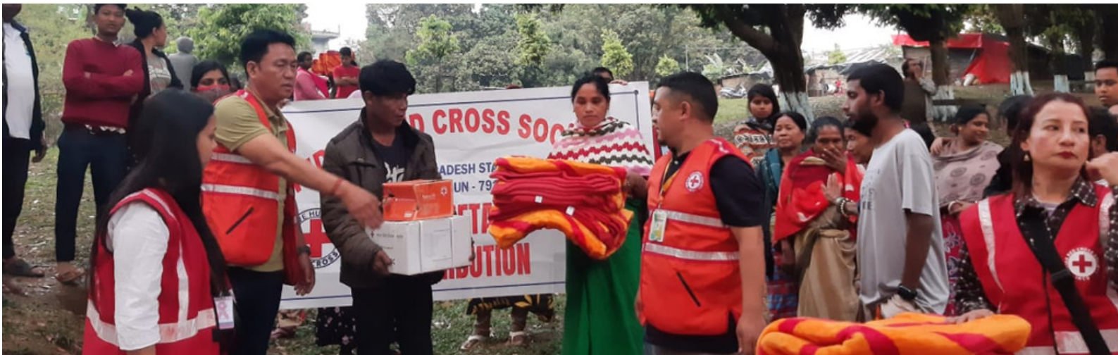
Volunteers of Red Cross Arunachal Pradesh distributed relief materials to the fire victims at Itanagar