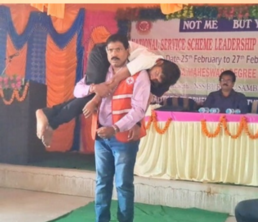
Disaster management training at MMCollege, Baunsuni, Boudh, Odisha