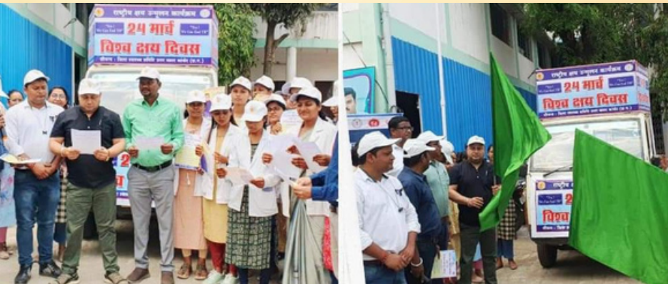
An awareness camp on TB eradication was held at Kanker, Chhattisgarh