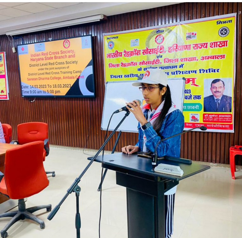
District level Red Cross training camp, Ambala, Haryana