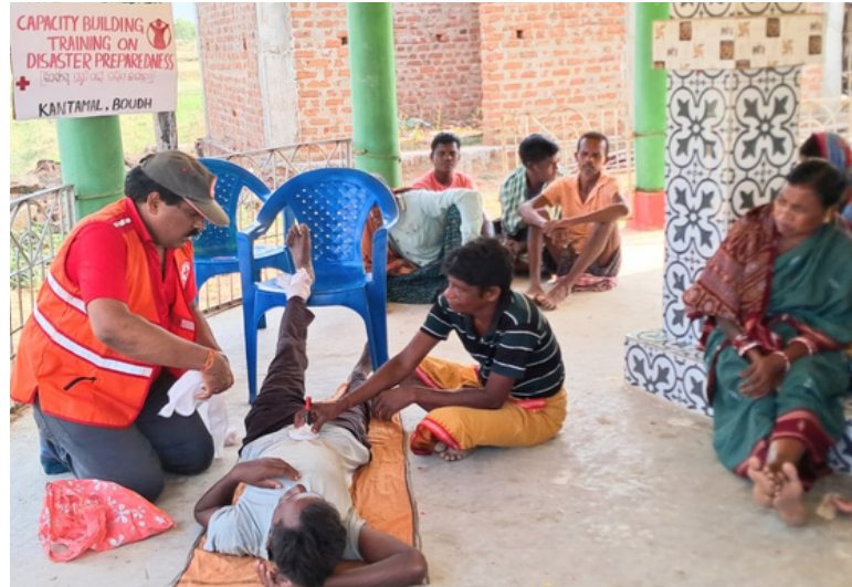
Capacity building training on disaster preparedness, Kantamal Block, Boudh, Odisha