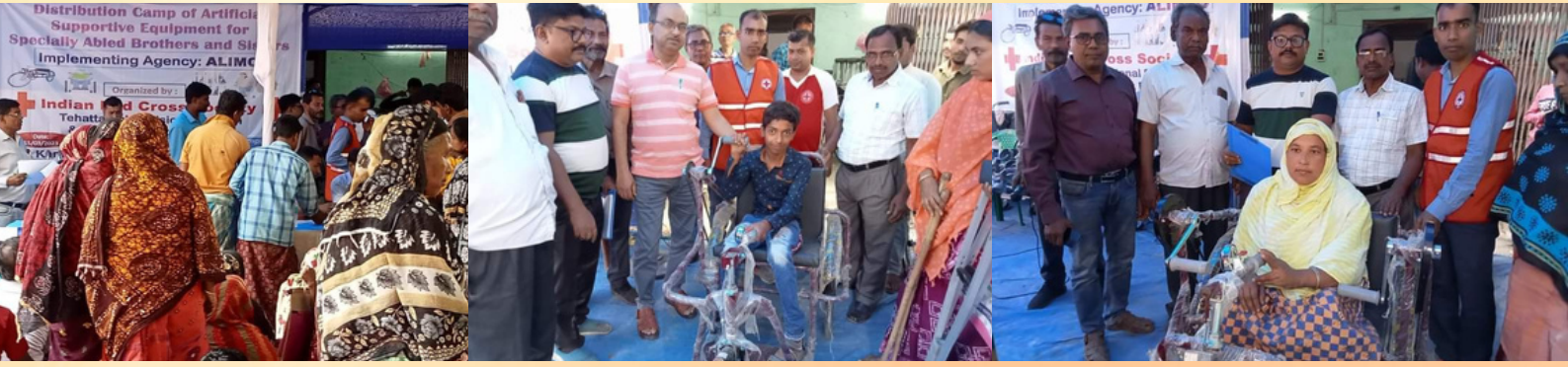
Distribution camp of artificial supportive equipment for differently abled people, Tehatta district branch, West Bengal