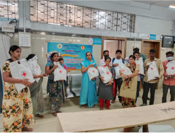
Distribution of nutrition kits at Colaba Municipality under Nikshay Mitra by Maharashtra state branch