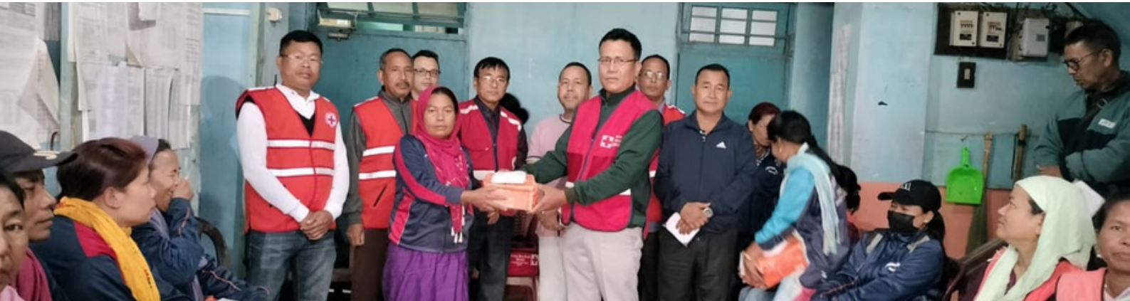
Distribution of masks and hygiene kits amongst sanitary workers of Jiribam municipality council, Manipur