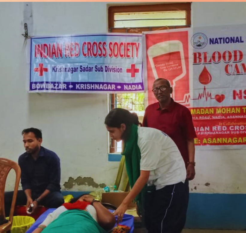
Blood donation camp, Krishnagar, Nadia district, West Bengal