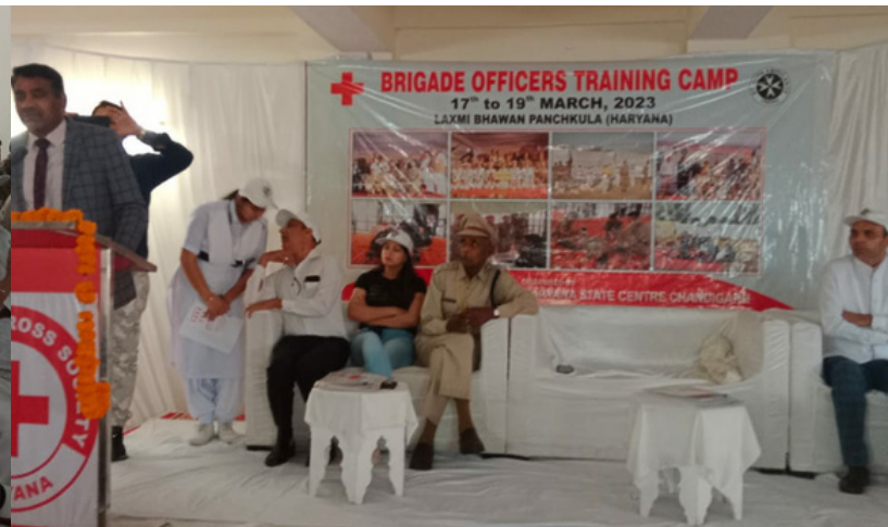
Brigade officers training camp, Panchkula, Haryana