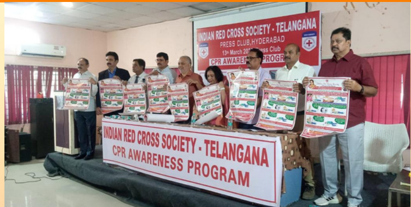
CPR awareness program, Hyderabad, Telangana