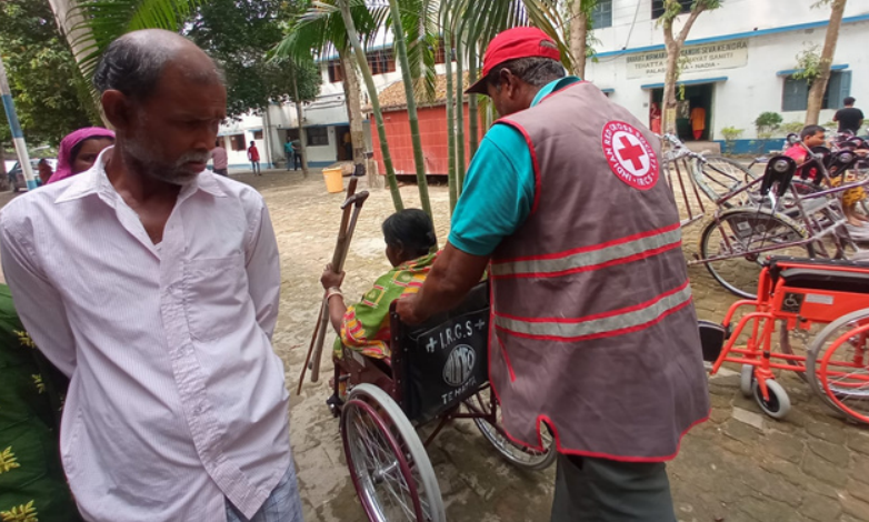
IRCS Tehatta sub-district branch, West Bengal organised the distribution of aids and appliances for physically challenged people.