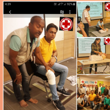
First aid training, Pune, Maharashtra