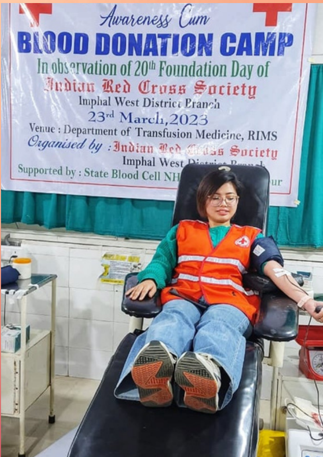
Blood donation camp, Imphal, West district branch