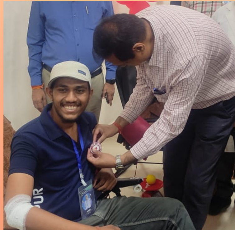
Blood donation camp, NIT, Raipur, Chhattisgarh