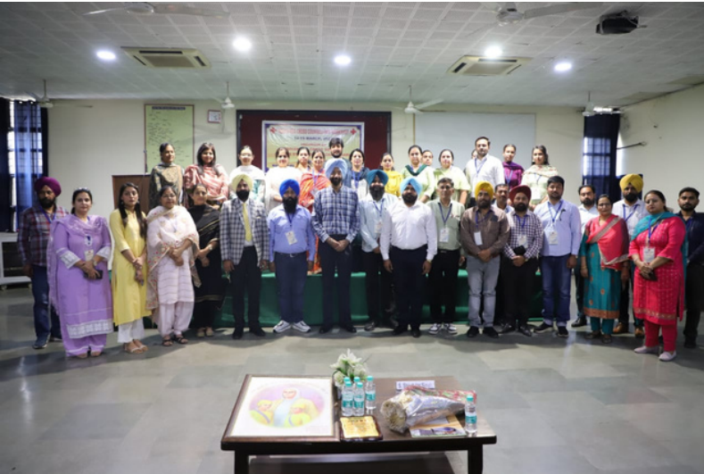
Punjab state Red Cross branch organized two days Youth Red Cross counselor's workshop