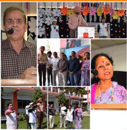
Punjab state branch organised, state-level junior Red Cross camp