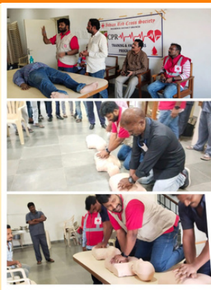
Basic first aid & CPR awareness program was held for the employees of Eenadu Entikyala, Mancherial, Telangana