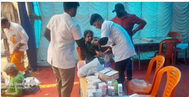
Volunteers of IRCS Kerala provided relief assistance to people who participated in the Attukal Pongala, festival