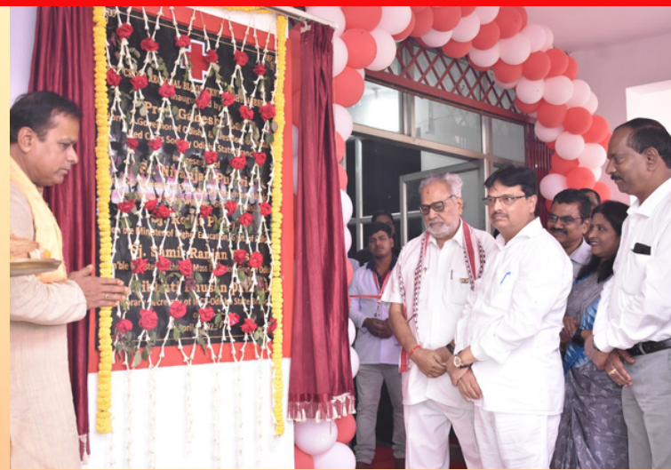
Hon'ble Governor of Odisha, Sh. Ganeshi Lal, inaugurated a new Red Cross regional blood center at Bhubaneswar, Odisha.