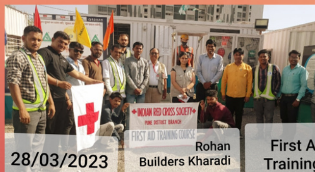
First Aid Training and CPR awareness workshop was held for the workers of Rohan Builders Kharadi. Pune, Maharashtra, 21 people participated in the training program