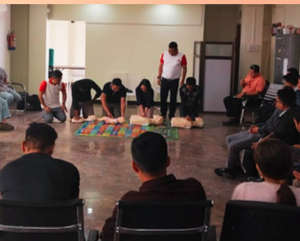
First aid training, Senapati district branch, Manipur