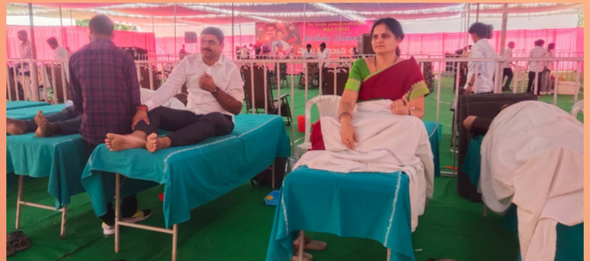
Blood donation camp, Nagarkurnool, Telangana

Inauguration of the new Physiotherapy Unit at Red Cross Bhawan, Patna, Bihar by the Hon'ble Governor of the state Sh. Rajendra Vishwanath Arlekar