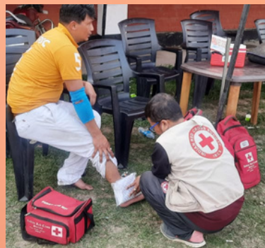
Volunteers from the IRCS, Imphal West district branch, Manipur provided first aid to the players, during the 2nd Imphal, West district polo tournament.