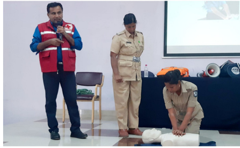
First aid training program for home guards and police personnel, Hospet, Karnataka