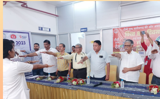
An awareness camp on TB eradication, Balod, Chhattisgarh