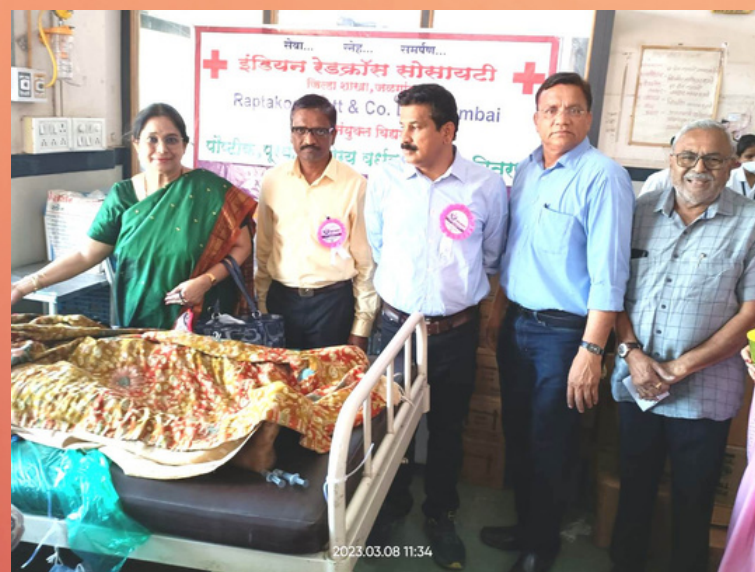
Blood donation camp, Jalgaon, Maharashtra