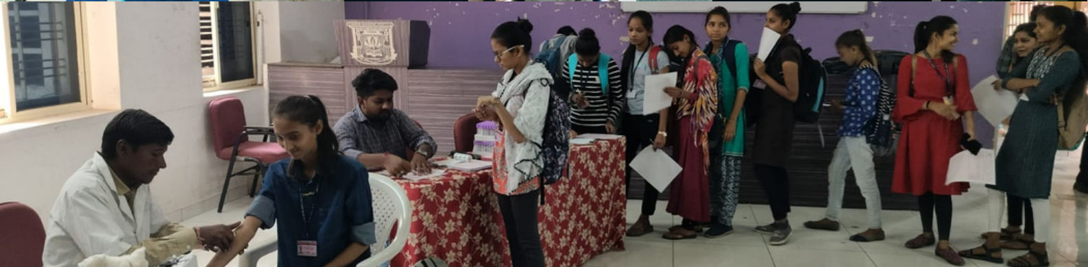
Thalassemia screening & sickle cell prevention control camp was conducted at Nadiad by IRCS Gujarat state branch