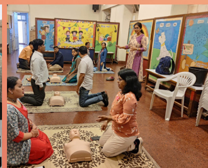
First aid workshop conducted at Bombay Baptist Church, Colaba, Mumbai, Maharashtra