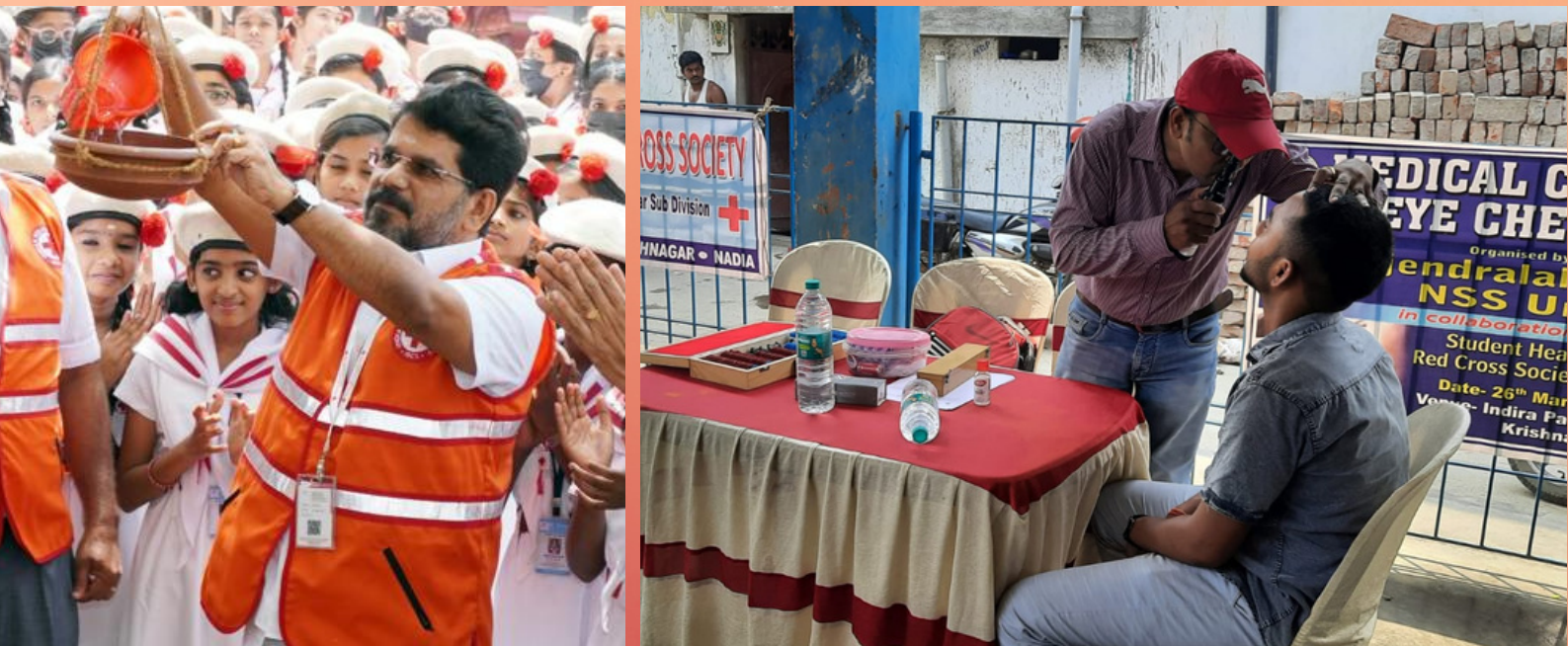
Junior Youth Red Cross at Thrissur district branch has taken the initiative to feed animals and birds with water during the summer. This task is carried out each year by students from all over Kerala.