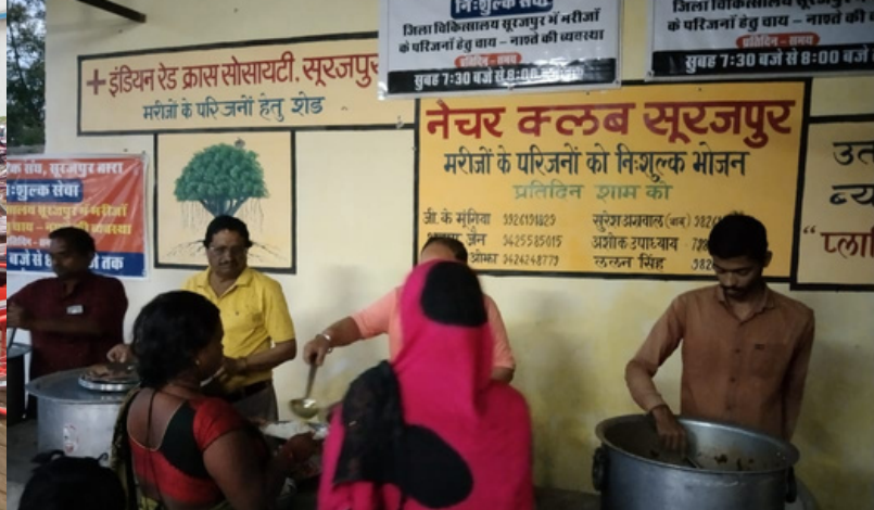
Distribution of cooked food, Surajpur, Chhattisgarh