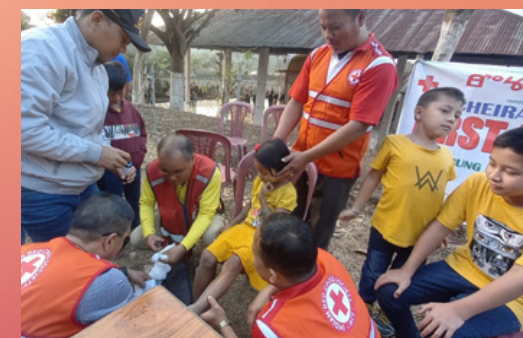
First Aid Post was opened at Iribung Kalika, Imphal East Manipur on the eve of Manipuri New Year 2023.