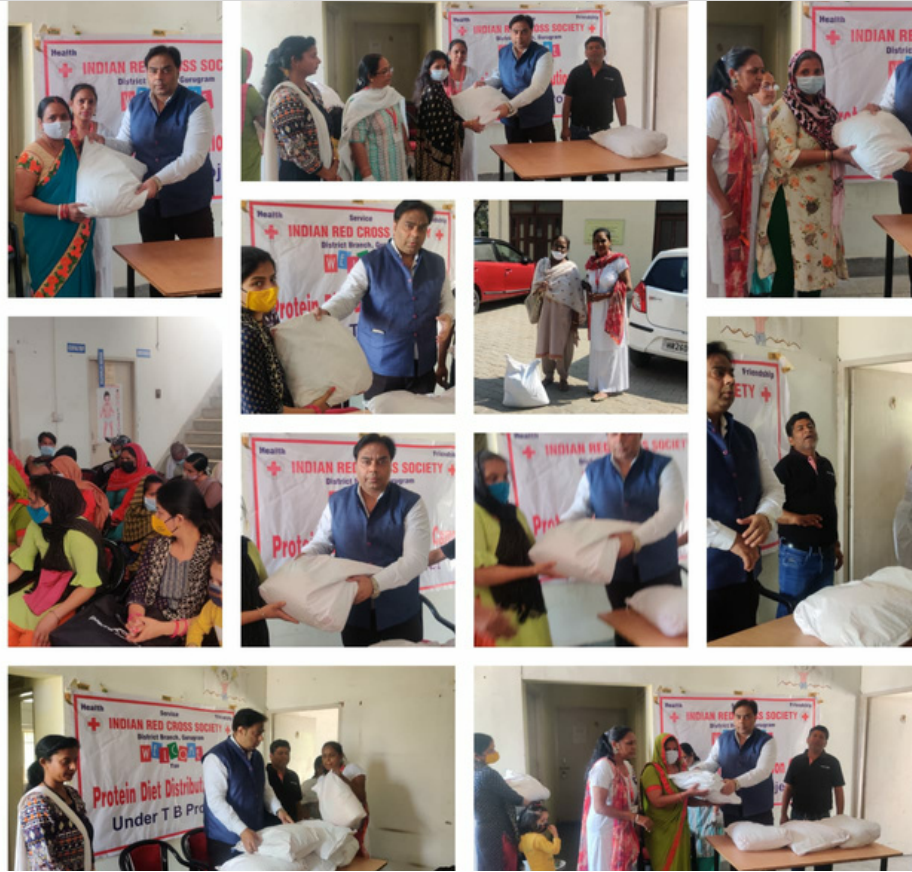
DRCS, Gurugram distributed ration kits to the migrants and TB patients