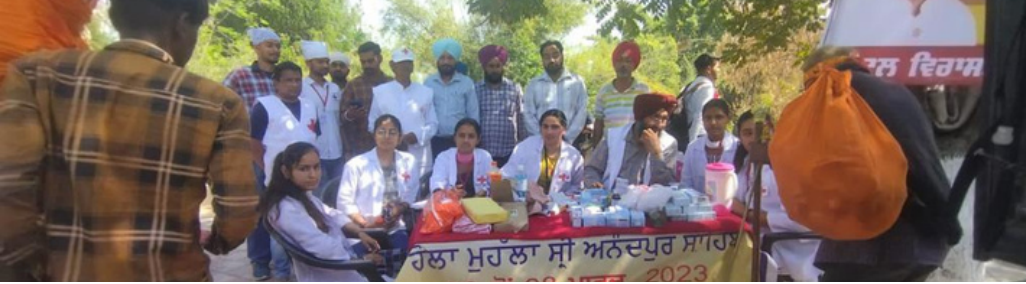
At Hola Mohalla festival at Anandpur Sahib, Anandpur, Punjab Red Cross, first aid posts were set up for the pilgrims. Ambulance facilities were also provided to the needy.