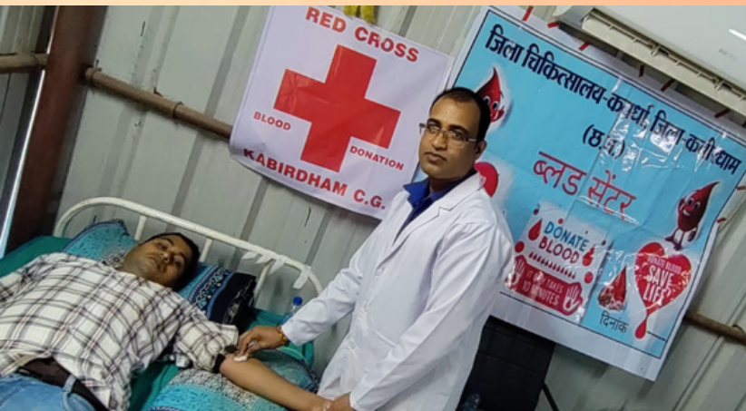
Blood donation camp, Kabirdham, Chhattisgarh