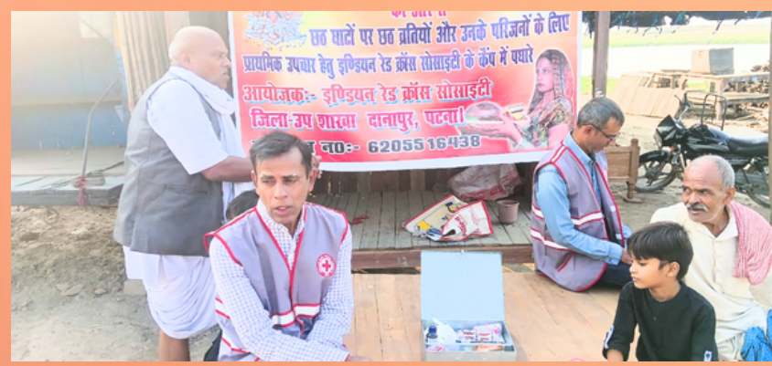
IRCS Bihar state branch, medical camp, Danapur, Patna on eve of Chhath Puja