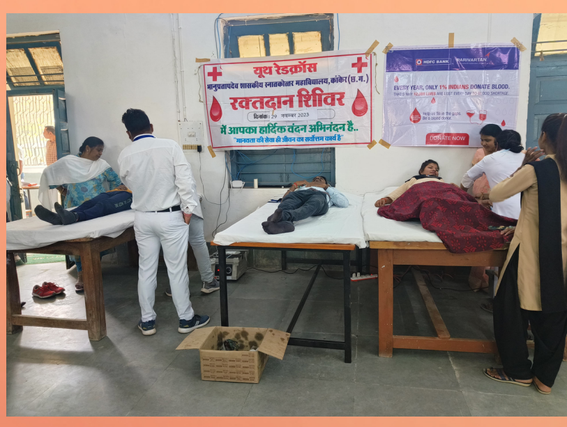
Blood Donation Camp, Kanker, Chhattisgarh