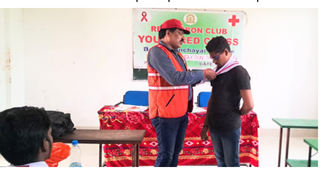
Induction training to the new YRC volunteers in Boudh Panchayat College, Boudh, Odisha