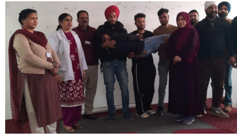
Eight days training on First Aid and Cardiopulmonary Resuscitation was conducted at Indian Red Cross Society, J&K-UT Branch from 20th to 29th November, 2023 for the commercial vehicle drivers and others.