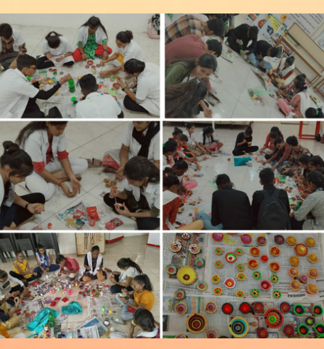
Celebration of Diwali by Red Cross Bhavnagar, Gujarat