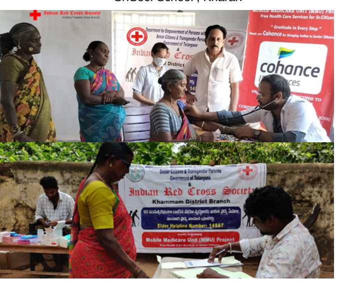
Free medical camp was organised for the senior citizens in Jaggarapalli, Boinpalli Mandal, and Khammam district of Telangana