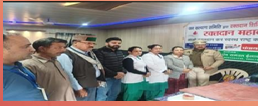
Blood Donation camp at Red Cross Blood Bank, Nalagarh, District Solan, Himachal .Pradesh