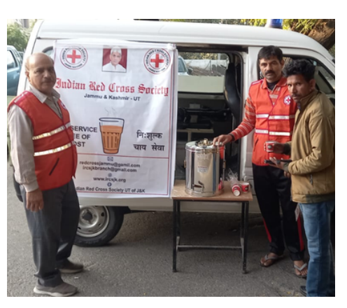
Tea service is launched at GMC Jammu for patients and their attendants.