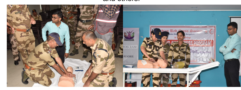
IRCS KSB's First Aid wing conducted a First aid Awareness Program at the CISF Barracks, in Bangalore, to 250 CISF personnel, stationed at Bangalore International airport (BIAL)