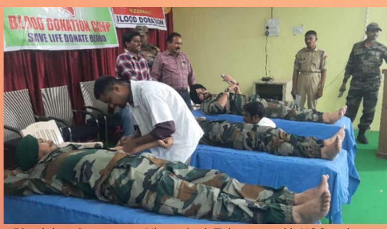
Blood donation camp at Nizamabad, Telangana with NCC cadets