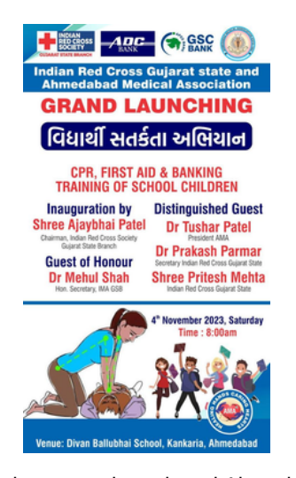
IRCS, Gujarat state branch and Ahmedabad Medical Association launched CPR & First Aid training on 4th Nov, 2023 for school children.