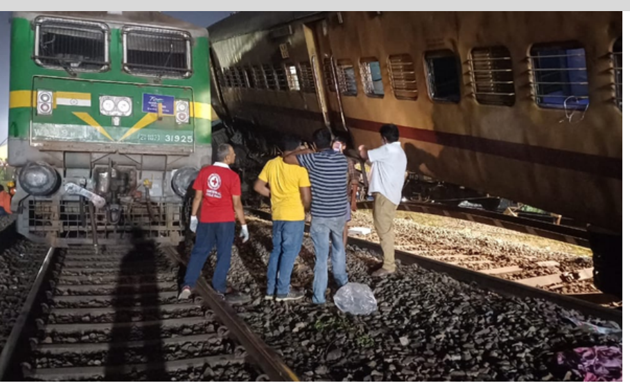
YRC volunteer of IRCS AP State Branch provided aid and amenities to the victims of train accident in Visakhapatnam district of Andhra Pradesh. Volunteers also supported the local administration in the rescue operation.