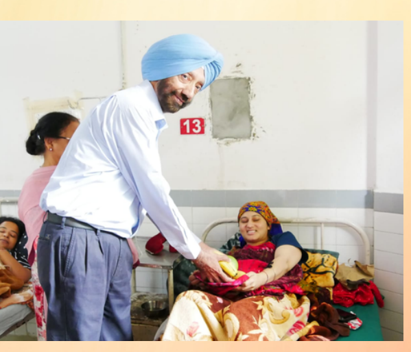
At Mata Kaushalya Hospital (Govt.), Patiala, the Punjab State Red Cross State Branch Chandigarh distributed blankets and fruits to the underprivileged indoor patients on the occasion of Deepawali.