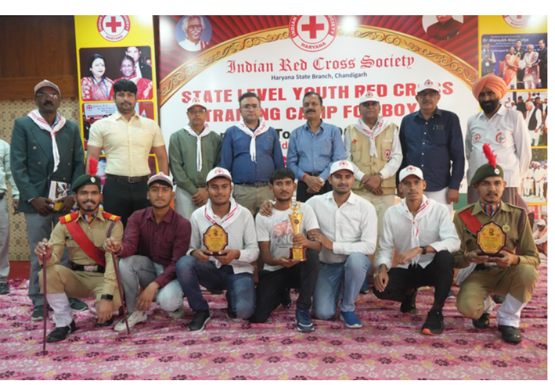
IRCS, Haryana State Branch organised State Level Youth Red Cross Training Camp for boys from 26th to 31st October, 2023 at Haridwar. 241 participants from 16 Universities and 23 Colleges of Haryana participated.