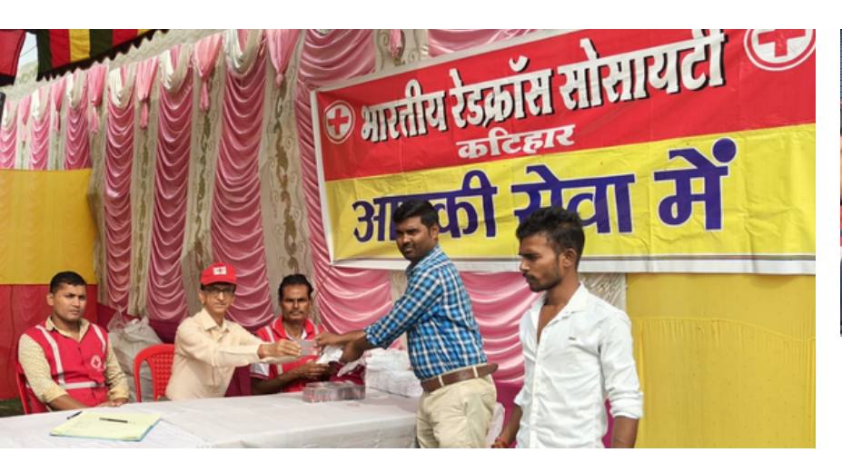
Face masks & soap were distributed by the IRCS, Katihar district branch during district level one-day employment cum vocational guidance fair organized by the District Employment Exchange, Katihar, Bihar. A large number of unemployed students participated in it.