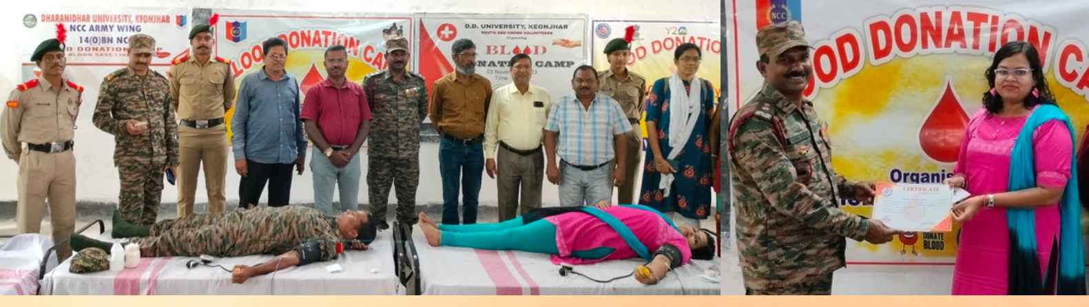
Blood Donation Camp was organised by the state Red Cross in 14 Odisha battalion Army NCC, Keonjhar, Odisha