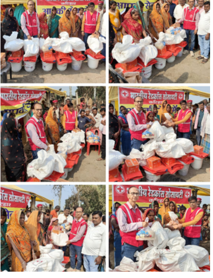
Red Cross Society Katihar district branch distributed relief material among 8 fire affected families in Samaili block, Bihar