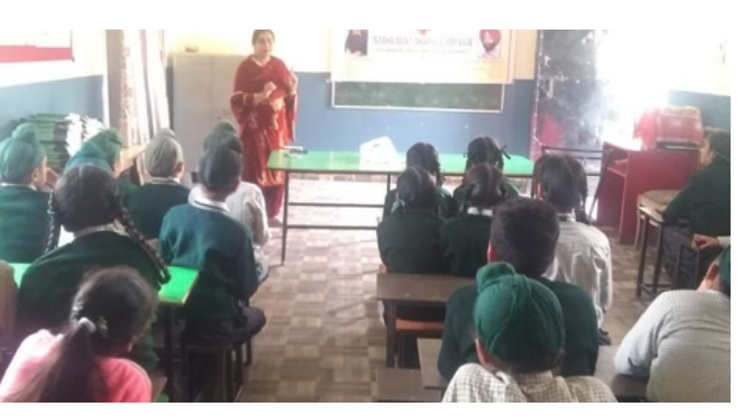
Under Nasha Mukt Bharat Abhiyaan campaign launched by MSJE, an awareness seminar on drug abuse was organised at Developing Daffodils International School of Excellence by IRCA, Gurdaspur, Punjab