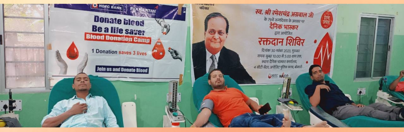
Blood Donation Camp, Bokaro, Jharkhand