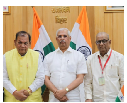
New blood bank in Patna city, Bihar will soon be dedicated to the public.