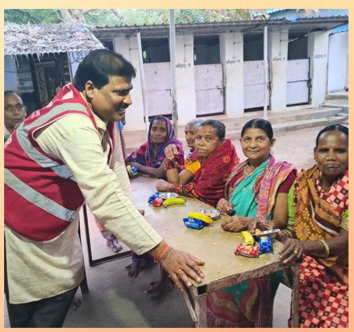
Celebration of Diwali at Old-age home, Charichhak, Boudh, Odisha