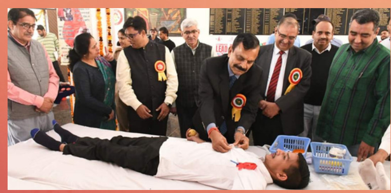
Youth Red Cross Unit of Chaudhary Charan Singh Haryana Agriculture University (CCHAU), Hisar organised mega Voluntary Blood Donation Camp - 180 Units of blood were collected.