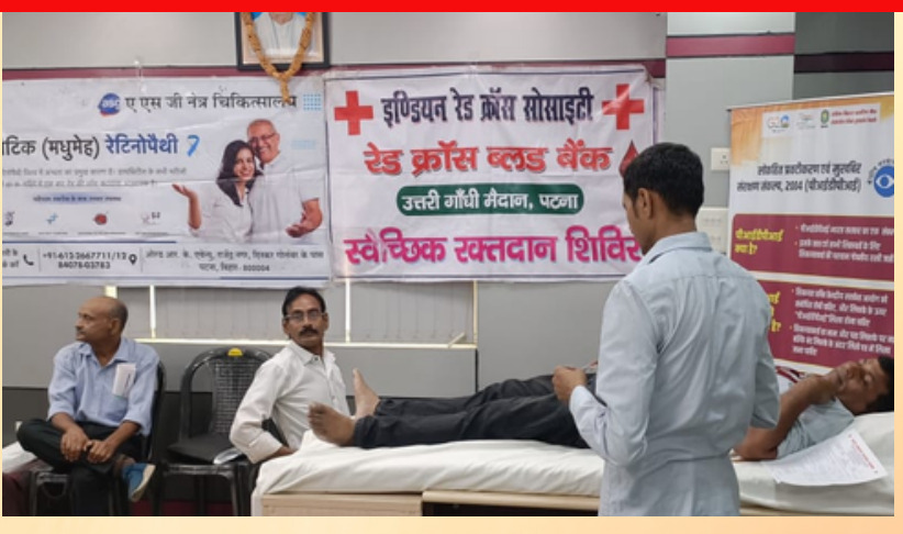
Blood donation camp, Patna, Bihar