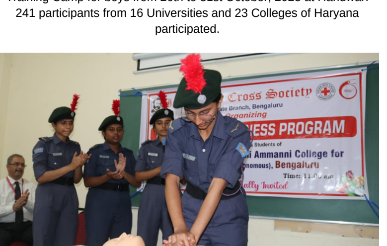
First aid awareness program was conducted by Karnataka State Branch for the students of Maharani Lakshmi Ammanni college, at Malleswaram, Bangalore, Karnataka.