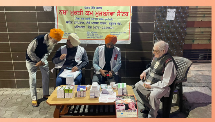
A medical camp was organised on Guru Nanak Jayanti by IRCS Punjab at Sant Baba Kamaliwale Gurudwara Sahib Patiala. 160 people were benefited from this camp.