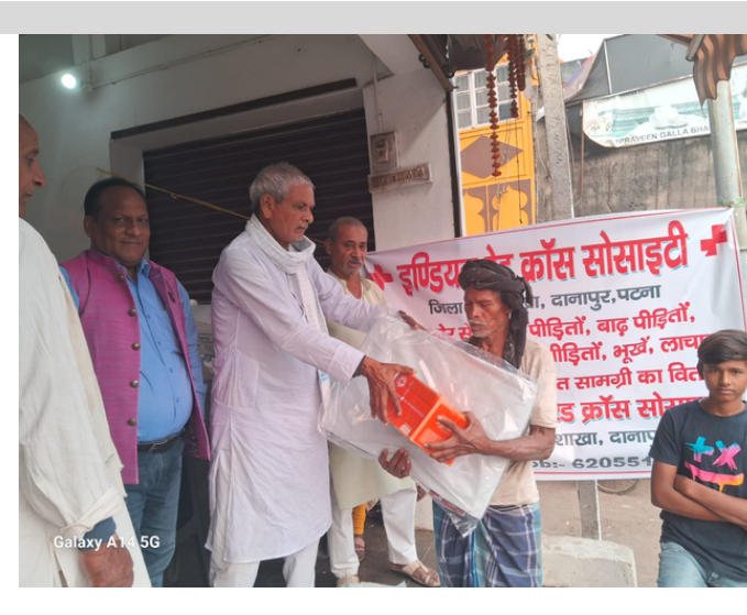
IRCS, Danapur branch distributed relief materials among the fire victims of Danapur market, Patna, Bihar.