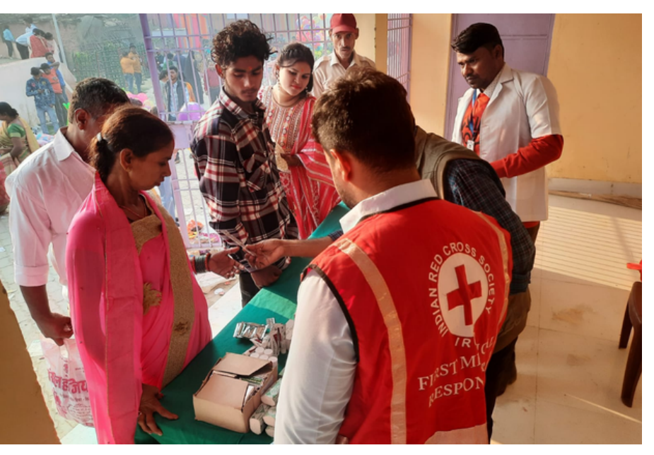
Medical Camp, Bettiah, Bihar