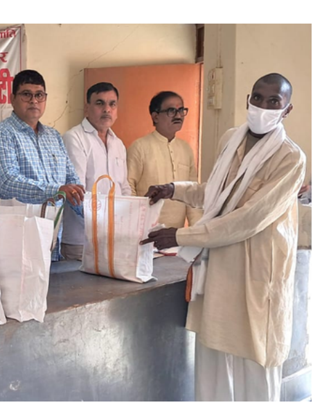
Life members and volunteers of IRCS, Bhabhua, district branch, Bihar distributed nutritional food to 27 TB patients under Nikshay-Mitra scheme