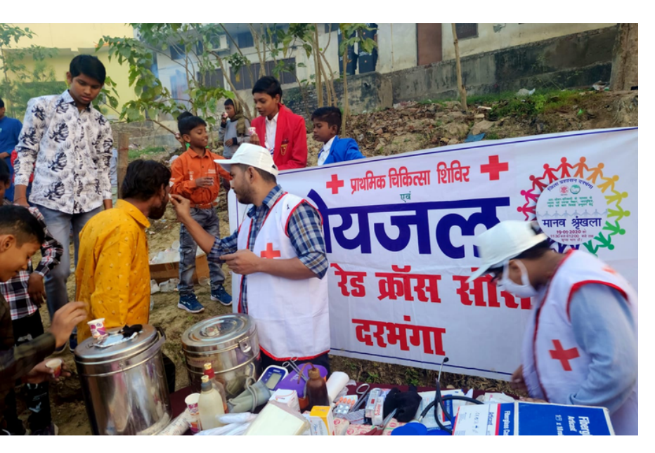
Medical Camp and Drinking water facility was provided to the needy, Darbhanga, Bihar