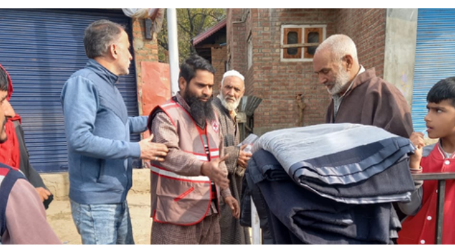
IRCS, Jammu branch distributed relief materials among the needy and vulnerable