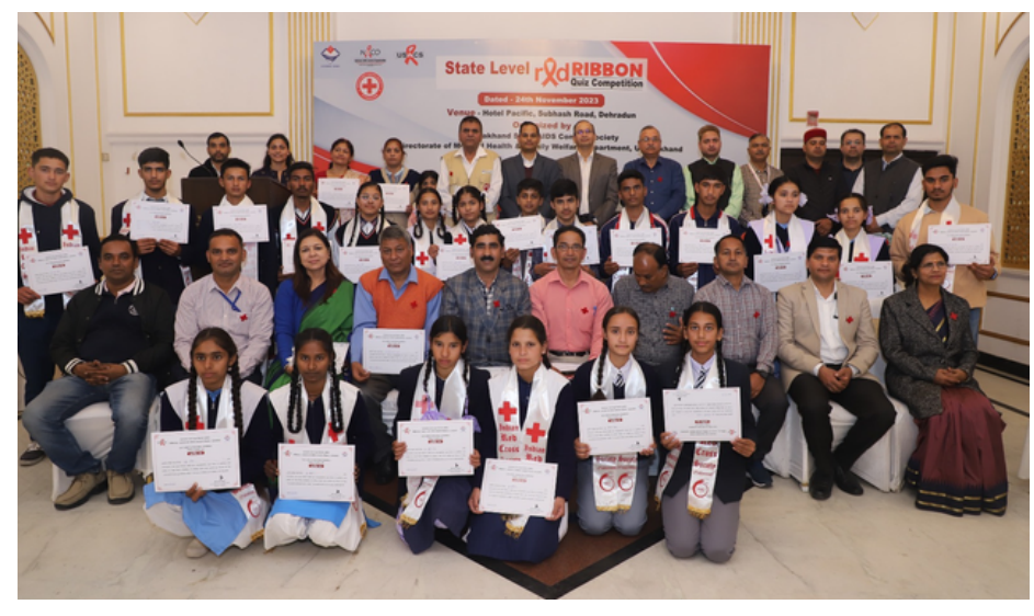
The state level Red Ribbon Quiz competition was organized by Uttarakhand State AIDS Control Committee in collaboration with Red Cross Uttarakhand.