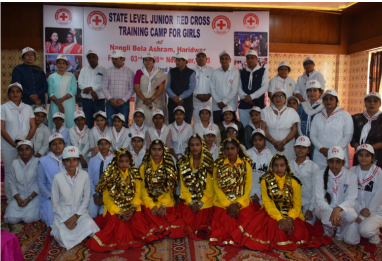
IRCS, Haryana State Branch organised State Level Junior Red Cross Training Camp for girls from 3rd to 8th November, 2023 at Haridwar. 260 participants from 43 schools of 22 districts of Haryana participated in the camp.