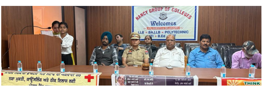
Indian Red Cross Society, Punjab State Drug De-addiction Centre, Patiala organised a seminar in Law Campus of Nancy Group of Colleges Samana on ANTI DRUG AWARENESS AND DRUG ABUSE.