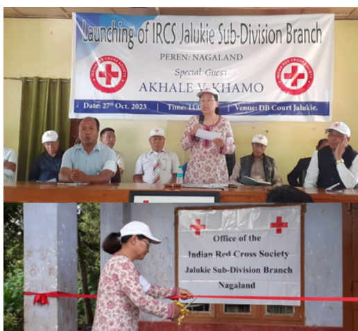
IRCS, Nagaland opened IRCS Jalukie Sub-Division branch to reach out to all parts of the state for creating awareness and giving humanitarian services