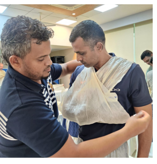
One day basic first aid workshop was conducted by IRCS Maharashtra state branch on 14 October for 30 teachers of St. JBCN International School, Mumbai.