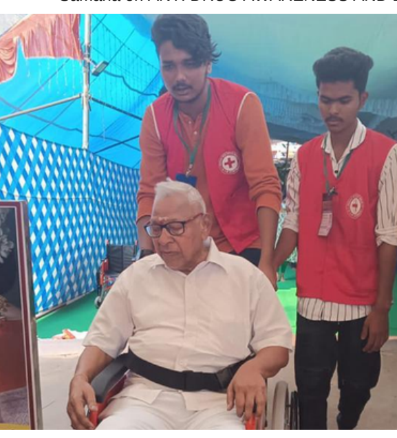
IRCS AP State Branch, NTR District Youth Red Cross Volunteers offering their services on the 4th Day for the lakhs of Devotees on the hill of Kanaka Durga Temple, Vijayawada.