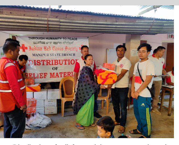
Distribution of relief material amongst needy and vulnerable people affected by the conflict in Manipur