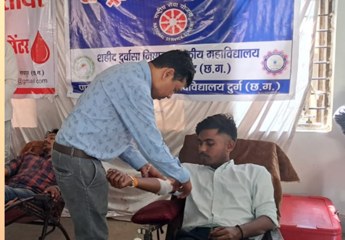
Blood donation camp, Durg, Chhattisgarh

Blood donation camp at Red Cross, Patna, Bihar