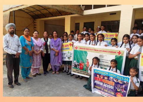
IRCS, Drug De Addiction Centre, Gurdaspur and Nawansheher, Punjab organised a massive cleanliness drive on the eve of Gandhi Jayanti