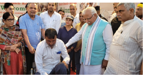
Distribution of artificial aids and appliances, Rohtak, Haryana. Hon'ble Chief Minister of Haryana Sh. Manohar Lal Khattar was also present during the event