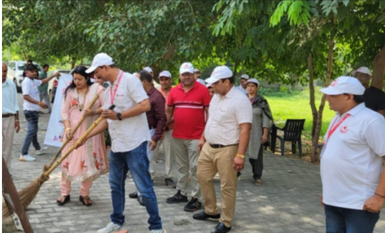
Cleanliness drive, Faridabad, Haryana