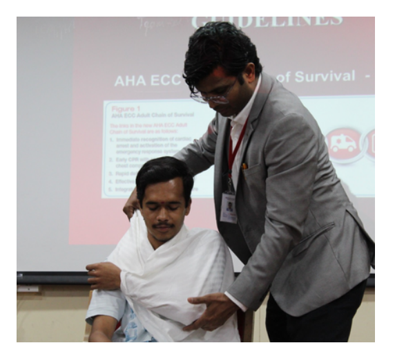
Indian Red Cross Society, Karnataka State Branch, conducted First Aid awareness at Seshadripuram Commerce & Management College, Bangalore