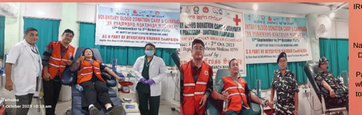
National Voluntary blood donation day was observed by Karnataka state branch

IRCS Imphal West District Branch, Manipur organised Voluntary Blood Donation camp on 1st October at RIMS Hospital on National Voluntary Blood Donation Day and as a part of Ayushman Bhavah Campaign 'Seva Pakhwada -Raktdaan Mahadaan which started from 17 September to 2nd October. 37 units of Blood was collected.