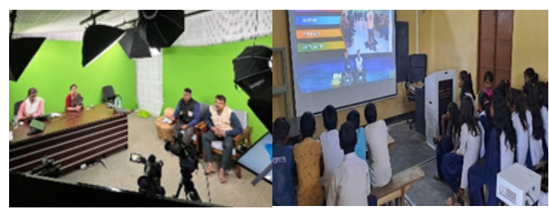
The Indian Red Cross Society, Assam State Branch, collaborated with the Rashatriya Madhyamik Shiksha Abhiyan and showcased an online session on First Aid in Emergencies at the Assam Tele Education Centre, Govt. of Assam. 2064 schools participated and 1,85,875 students (grades 6-10) were benefited.