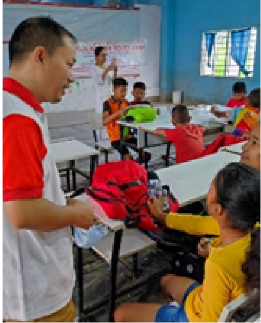
IRCS, Manipur state branch provided psycho-social services to children of conflict victims in Manipur

Thalassemia detection camp was held at Mira High School in Palasey by the Indian Red Cross Society, Kaliganj Block, Branch of the Nadia District, West Bengal. 99 participants participated in this camp.