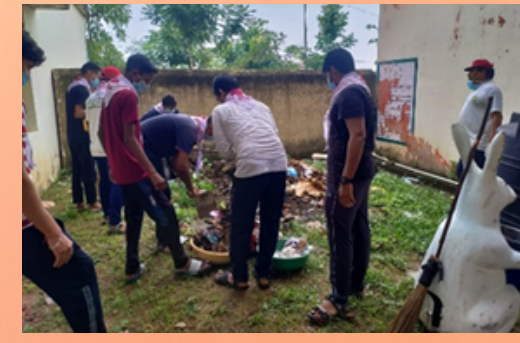
Swachhta Hi Seva programme was organised by Youth Red Cross unit of Boudh Panchayat College, Boudh Odisha on the eve of Gandhi Jayanti.