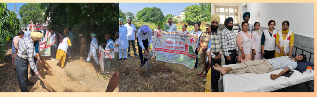
IRCS, Punjab Drug De-Addiction Centre Patiala organised various activities, including cleanliness drive, plantation drive, blood donation camp, movie presentation etc. under the campaign of Sawach Bharat Abhiyan and on the birth anniversary of Mahatma Gandhi