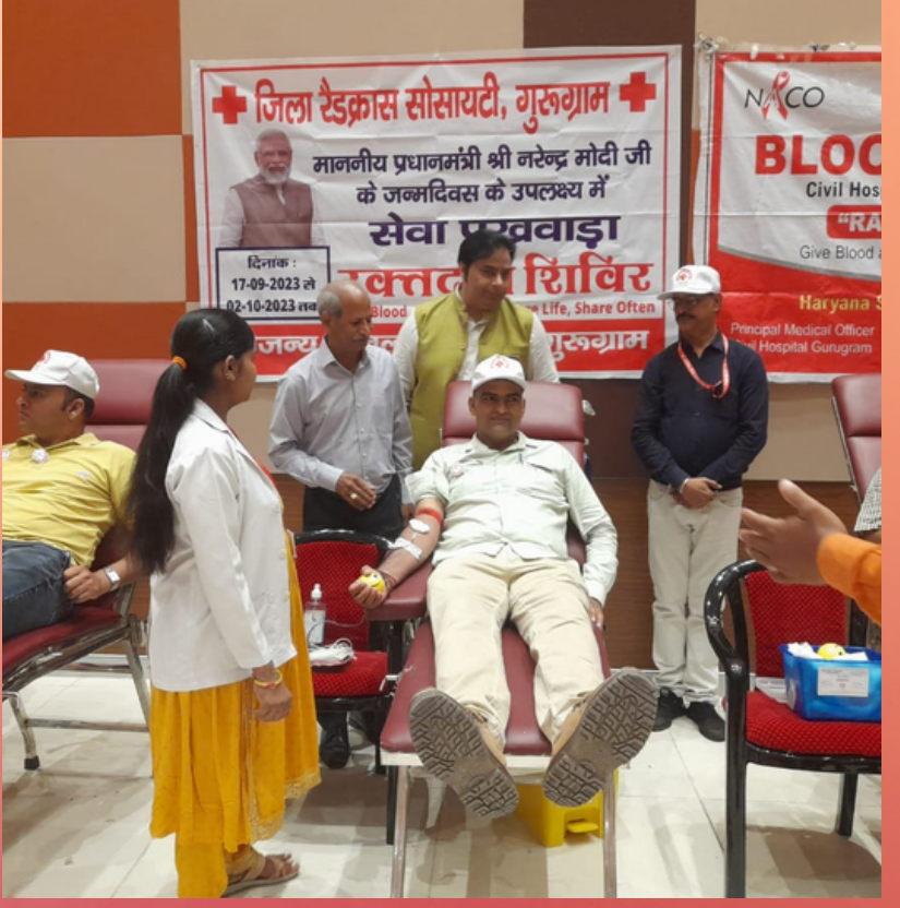
Haryana Red Cross state branch organised blood donation camp on the occasion of Seva pakwada from 17 September to 2nd October, 2023