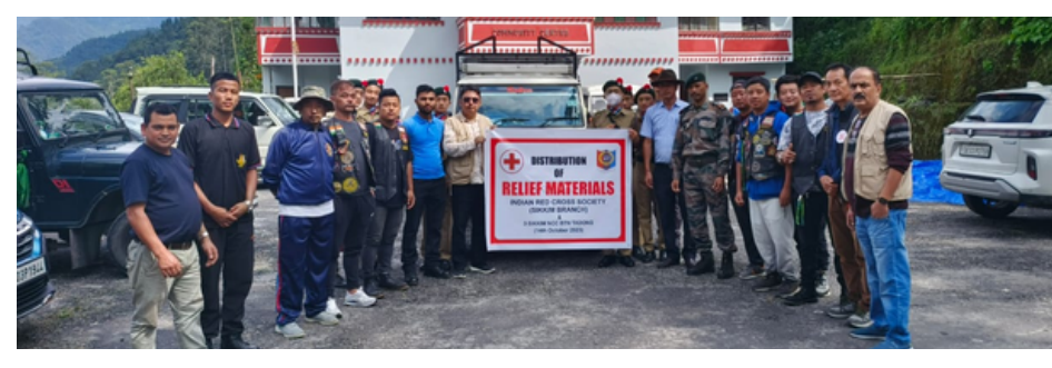
Distribution of relief material amongst flood victims, IRCS, Sikkim