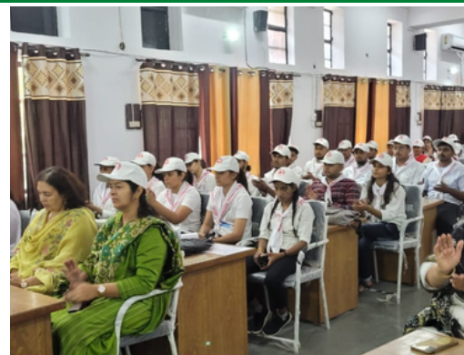
Five days YRC camp was organised by Rohtak, district branch, Haryana