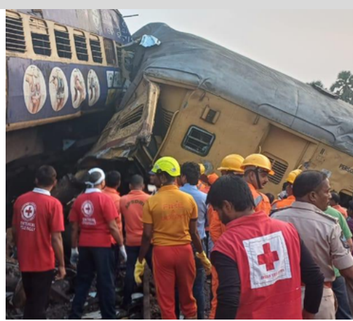
Vishakhapatnam YRC volunteers had rushed to the train accident spot near Kothavalasa and participated in rescue operations. Vizianagaram district branch sent ambulances and hundreds of YRC volunteers.