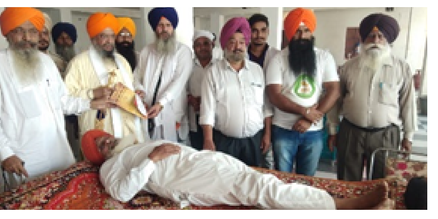
Red Cross Integrated Rehabilitation Center for Addicts, Siswan Road, Kurali, organized a "Nasha Mukt Bharat Abhiyaan" awareness and medical check-up camp in Vill. Makrouna Kalan.