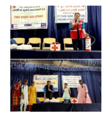
First Aid Awareness programs were held at youth Red Cross units of various colleges of the Davengere district branch, Karnataka.