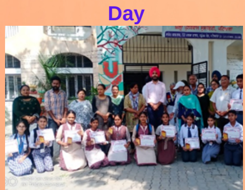
IRCS Punjab, IRCA Patiala celebrated World Mental Health Day