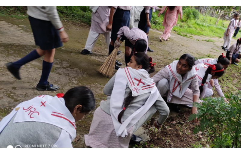
YRC volunteers participated in cleanliness drive, Meghalaya