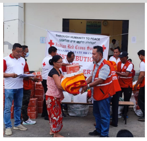
IRCS, Manipur state branch, supplied relief goods to innates who had their homes burned down and were now residing in Lamding High School in Thoubal District.