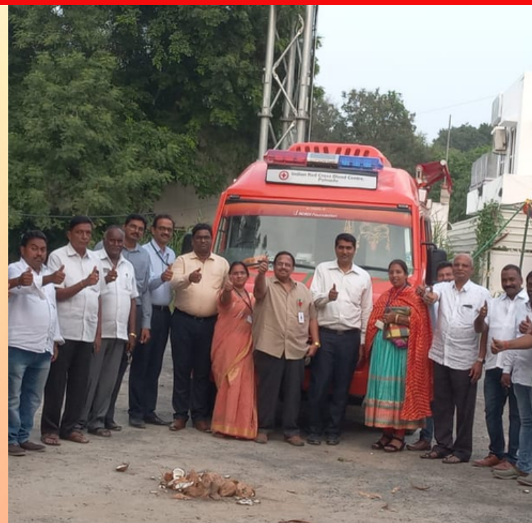
A blood donation camp was held in Haryana's Chautala village. The IRCS Haryana State Branch hosted this camp in partnership with the Relation Help Foundation National Trust. Raktaveers from 164 villages in Haryana, Punjab, Rajasthan, as well as many states and towns in India and bordering Nepal, took part and donated blood enthusiastically.