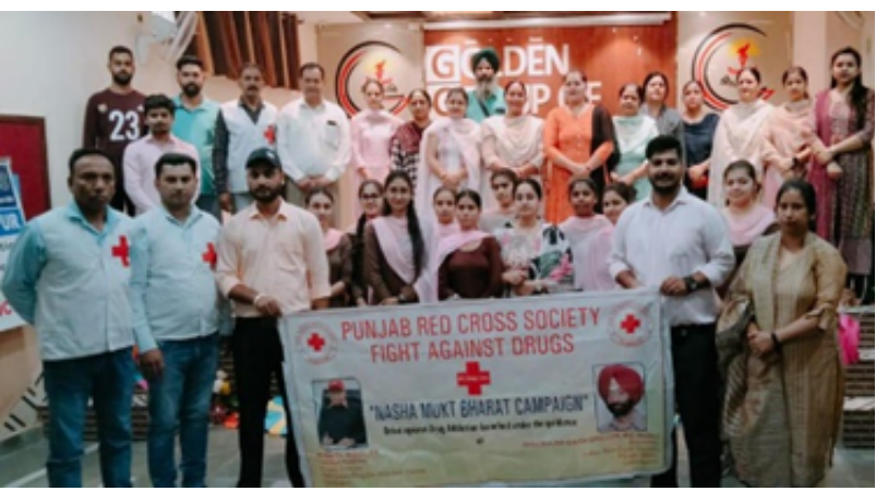
Awareness camp on Drug De -Addiction was held by RC-IRCA Gurdaspur at Golden group of institutes Gurdaspur, Punjab