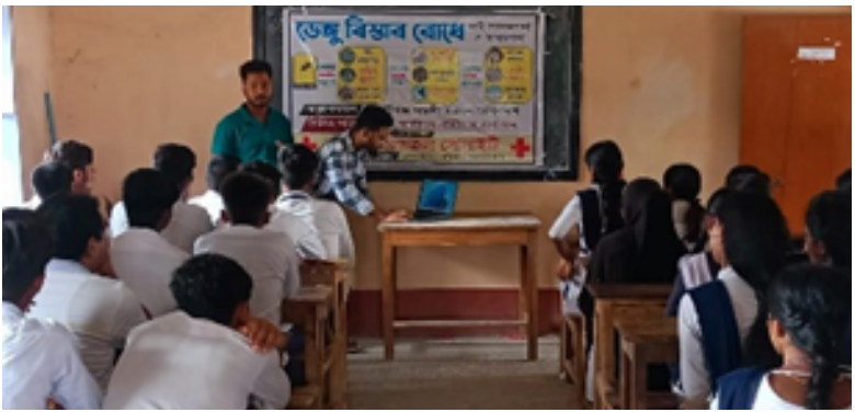
Dengue Awareness Program was organised by IRCS Kaliganj Block Branch, Nadia, West Bengal on 1st September '2023 at Kaliganj Satyacharan Pal Girls High School & Bara Kulberia High School