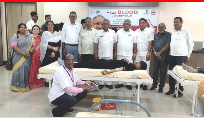
Blood Donation camp, Jalgaon, Maharashtra