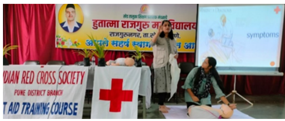
First aid training, Hutatma Rajguru Mahavidyalaya, Rajgurunagar, Pune, Maharashtra