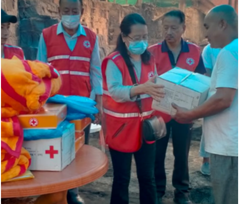
IRCS Nagaland state branch distributed relief material to the families who were affected by fire