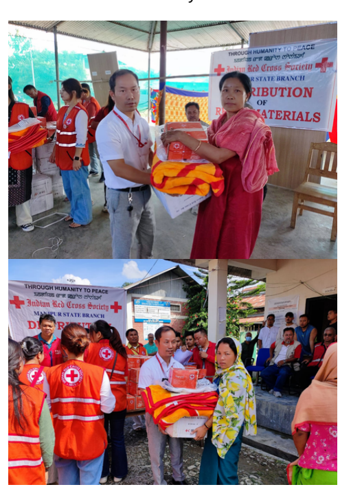
Distribution of relief materials in relief camps amongst the victims of Manipur ethnic conflict