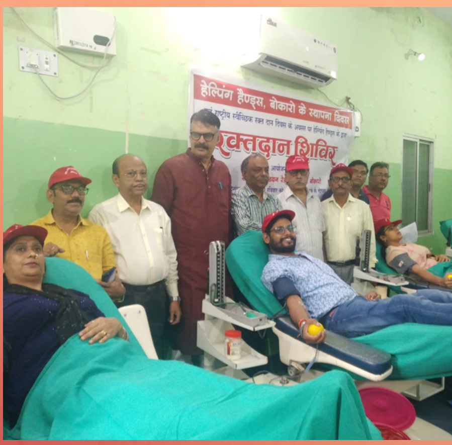
Blood Donation camp, Bokaro, Jharkhand