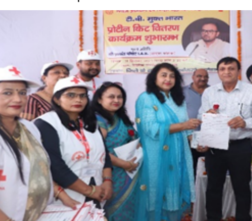
Distribution of protein kits amongst TB patients, Fatehabad, Haryana