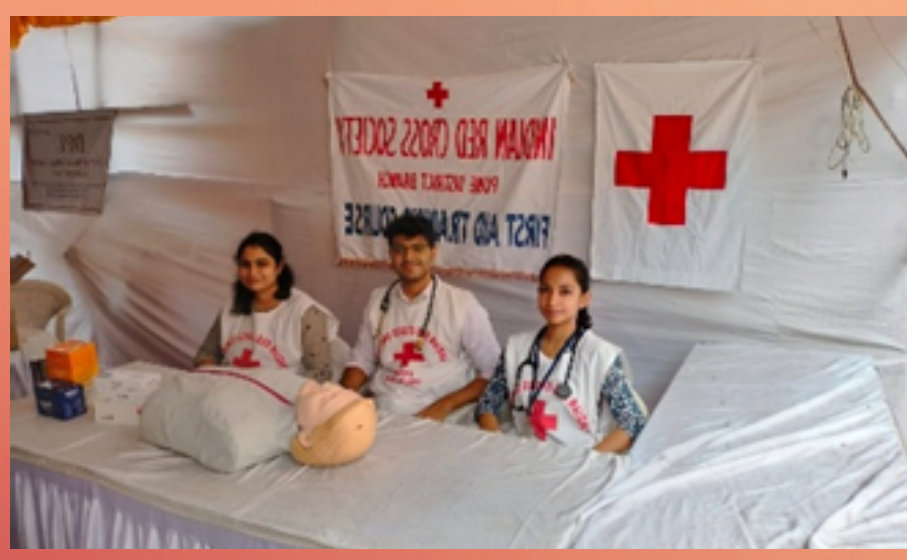
Red Cross Pune, Maharashtra held a First aid post at Dagdusheth Halwai Ganapati temple during Ganesh Festival.