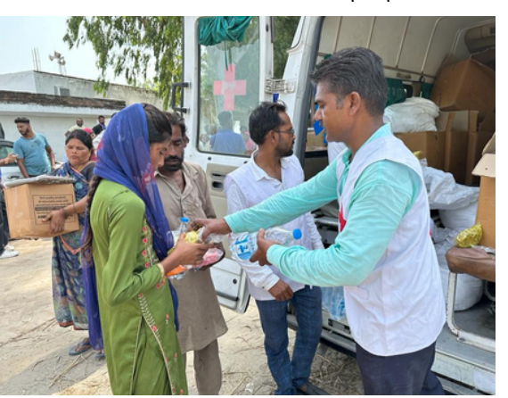
In the relief camps in Abdullapur Miani village, the IRCS, Hoshiarpur district branch, Punjab supplied hygiene kits, ration kits, mosquito nets, and sleeping mattresses amongst the flood affected needy and vulnerable.