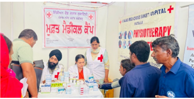
A free "Mega Multi-speciality Health" checkup camp was organised at Sec-39, Anajmandi, Chandigarh, in the spirit of "Seva Pakhwada.