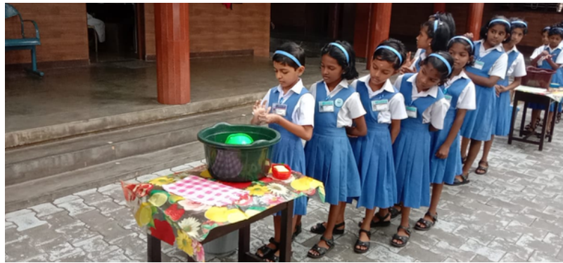
An awareness session on hand washing was conducted for the students of St. Joseph of Cluny, Puducherry