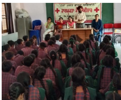
Red Cross Drug De-addiction and Rehabilitation Center Nawanshahr, Punjab organized an awareness camp under "Nasha Mukat Bharat Abhiyaan" at Government High School, Behram.