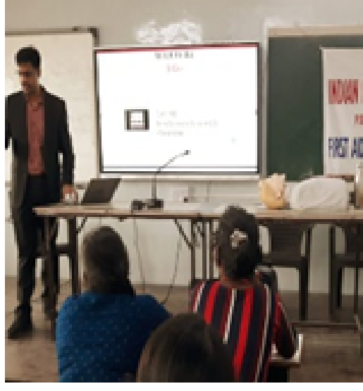
First Aid and CPR Awareness workshop, Modern College, Pune, Maharashtra