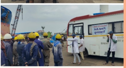
On World First Aid Day, first aid training camp was organized by Indian Red Cross Society Bhavnagar, Gujarat, for Alang workers. More than 2000 workers were trained free of charge.