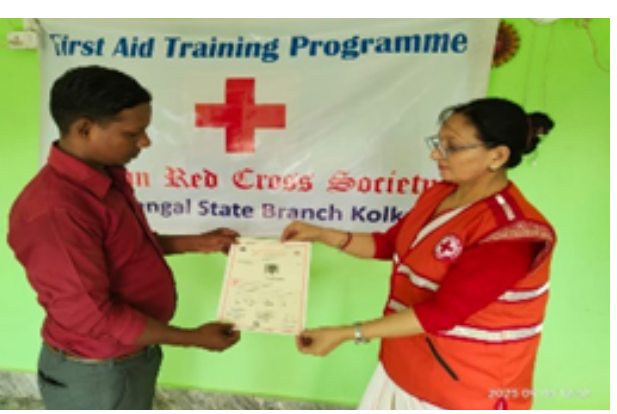
First aid training, Jalpaiguri, West Bengal