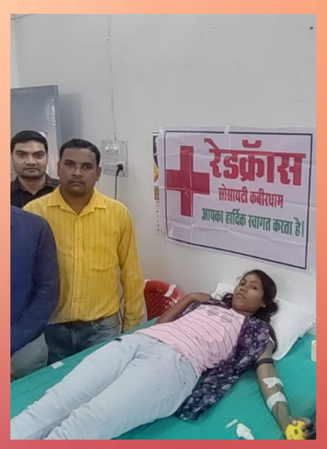
Blood Donation camp, Pipariya, Chhattisgarh