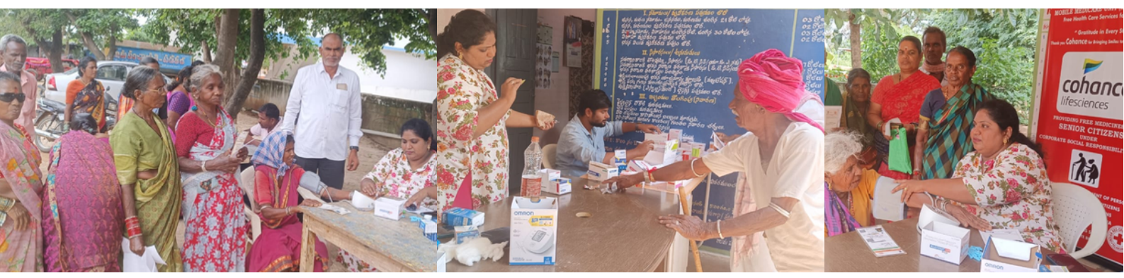
IRCS, Rangareddy District branch, Telangana organized a free medical camp for senior citizens under Mobile Medicare unit (MMU) project.