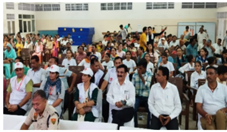
Awareness on Nasha Mukti Abhiyaan, Fatehabad, Haryana