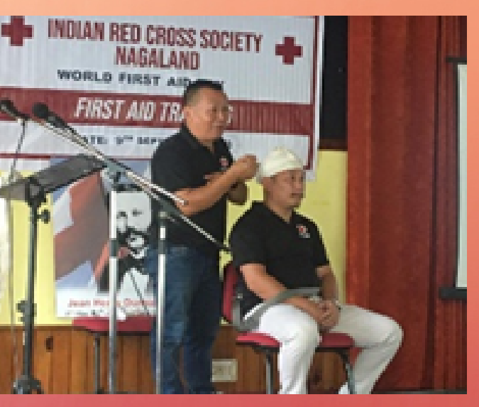
IRCS Nagaland observed World First Aid Day