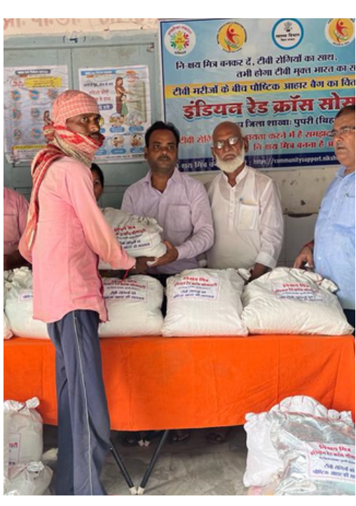
Distribution of protein kits amongst TB patients, Pupri, Bihar