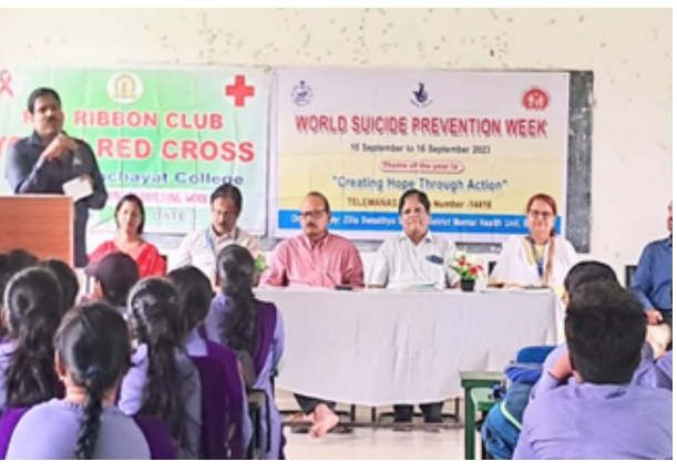
Suicide prevention and mental health workshop, Boudha Panchayat College, Boudh, Odisha