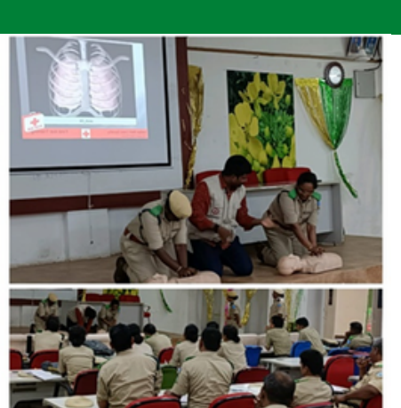
First aid and CPR training was imparted to the Police personnel, Telangana, State Branch.