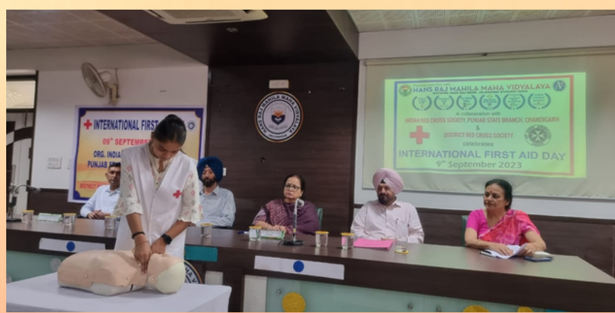
The IRCS Punjab State Branch organized International First Aid Day in collaboration with District Red Cross Branch, Jalandhar at HMV College Jalandhar.