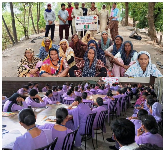
Indian Red Cross Society, Punjab State Branch, in collaboration with the Drug De-addiction Centre, Nawahseher, has launched a comprehensive drug de-awareness program, reaching out to various segments of the society through a series of awareness camps.