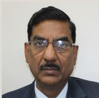
From the Desk of The Secretary-General

In recent weeks, our communities have faced profound challenges, and it is in these moments of adversity that our collective strength and compassion should be noticed. The recent tragic stampede in Hathras and the devastating landslides in Wayanad have brought debilitating hardship to people's lives.