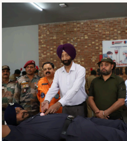
Indian Red Cross Society, Punjab State Branch, in collaboration with the NSS Department of Chandigarh University, organized a blood donation camp at the University campus.