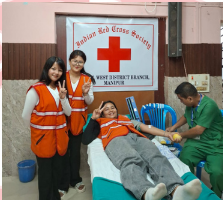
On National Doctors Day, the IRCS, Imphal West District Branch in collaboration with the Association of Voluntary Blood Donors, organized a voluntary blood donation drive at the Indian Medical Association Hall in Lamphel.