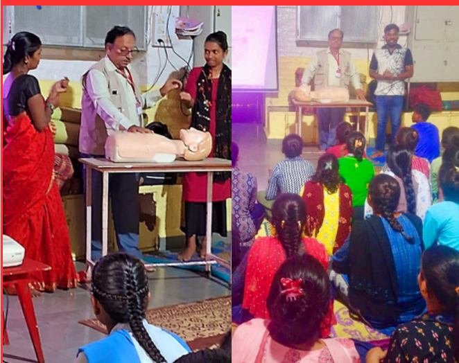
First aid training was organised by IRCS Pune District Branch, Maharashtra at Maher, shelter home, Pune