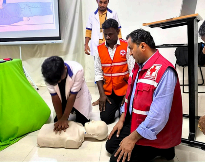
Training on BLS and First Aid for Paramedical students, IRCS Davengere District branch, Karnataka

THE DESIRE FOR THE WELL-BEING OF ONE'S OWN NATION CAN BE- AND MUST BE-MADE COMPATIBLE WITH THE WELFARE OF ALL HUMANITY.