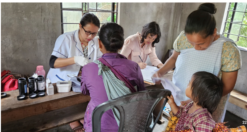
Medical Camp was held at Pynursla block Mynrieng Village, Goa