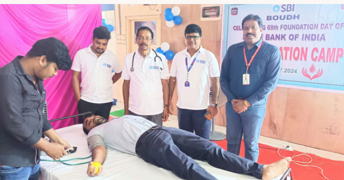
Voluntary Blood donation camp was held in SBI, Boudh on Bank Day, 01-07-24 in support of District Red Cross branch, Boudh, Odisha.

EMPATHY IN ACTION: WHERE EVERY DONATION BECOMES A LIFELINE.