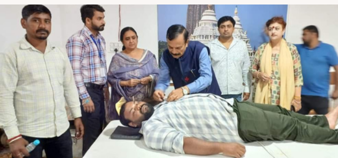
Blood donation camp organised By Chandra Shekhar Azad Charitable Trust Panchkula, Haryana in collaboration with the Haryana State Branch.