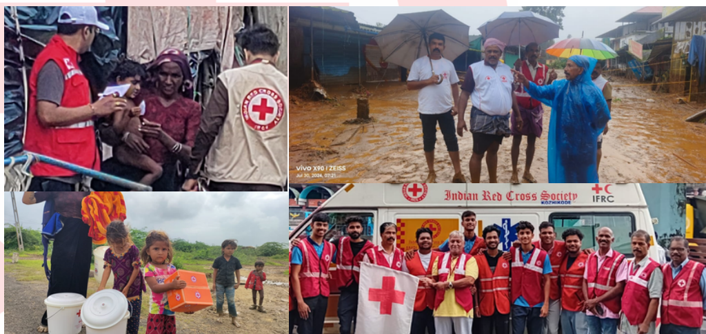
IRCS is mobilizing relief supplies and volunteers to supplement the rescue & relief being undertaken by the local administration for the survivors of the devastating landslide on 30th July in the Wayanad district of Kerala. In addition to the relief supplies and support by the Kerala State branch the NHQ has released kitchen sets, tents and tarpaulins to meet the urgent need.