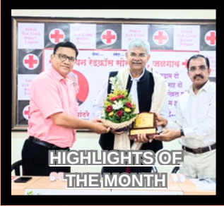
HIGHLIGHTS OF THE MONTH