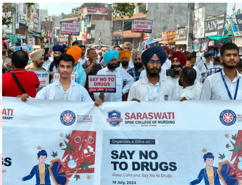
Under the Nasha Mukat Bharat Abhiyan, the Indian Red Cross Society, Punjab State Drug De-Addiction and Rehabilitation Center, Nawanshahr, organized an anti-drug awareness camp at Government Senior Secondary School,