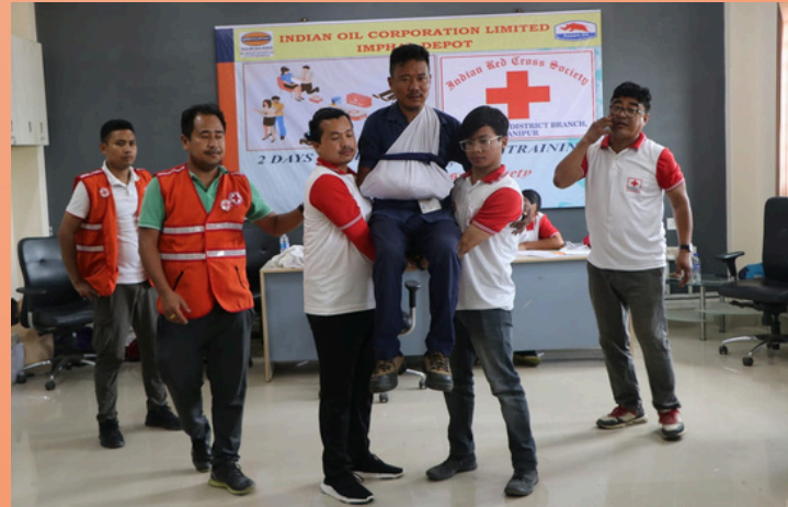
IRCS Imphal West district branch conducted first aid training for the employees and workers of IOCL Malom Oil Depot.

THE DESIRE FOR THE WELL-BEING OF ONE'S OWN NATION CAN BE- AND MUST BE-MADE COMPATIBLE WITH THE WELFARE OF ALL HUMANITY.