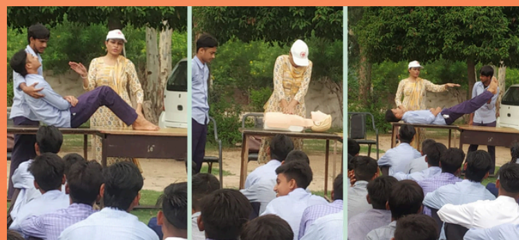
First aid awareness programme at Govt. Sec School Ismailpur Ambala, Haryana