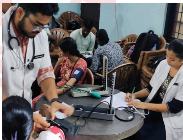
IRCS Salcete Branch,Goa along with Rotary Club and Sarthak Foundation Jointly organised awareness cum health camp. 79 people benefitted from the eye check up, ayurvedic & bone density consultations. Free medicines were also provided to some patients.