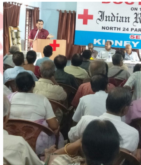
North 24 Parganas District Branch, West Bengal observed National Doctors Day