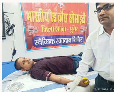
Blood donation camp, Munger, Bihar

IRCS NHQ BLOOD CENTER TIMINGS FOR BLOOD DONATION: MONDAY- SATURDAY (EXCEPT 2ND SATURDAY): 9 AM - 7 PM 2ND SATURDAY, SUNDAY, PUBLIC HOLIDAYS: 10 AM - 6 PM NOTE: THE NHQ BLOOD CENTER IS OPEN 24/7 FOR ISSUE OF BLOOD