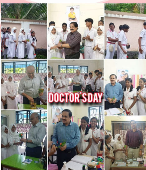
Celebration of National Doctors Day at Malippuram Hospital Vypin JRC unit Santa Cruz HS Ochanthuruth