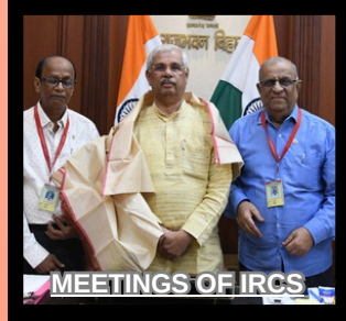
MEETINGS OF IRCS