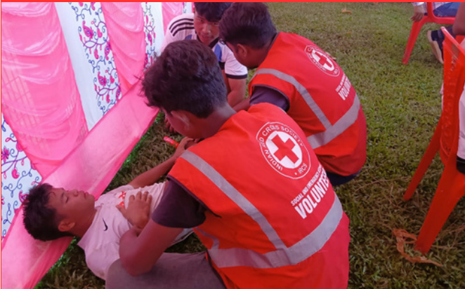
Volunteers of IRCS, Sonamura Sub-Divisional Branch gave first aid to players at State Football tournament of Tripura