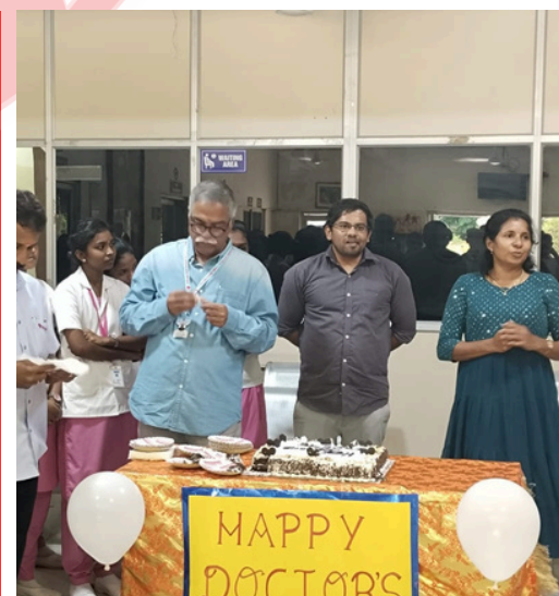
Celebration of National Doctors Day at IRCS Tamil Nadu State Branch