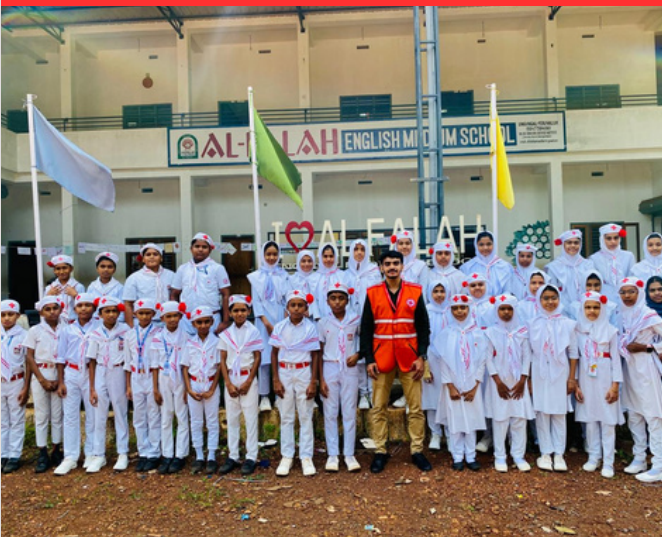
JRC First aid training, Peruvallur, Kerala

EVERY DAY SEES HUMANITY MORE VICTORIOUS IN THE STRUGGLE WITH SPACE AND TIME.