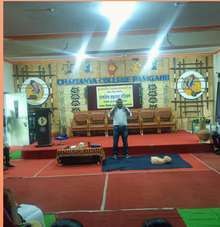
First Aid Training, IRCS, Janjgir, District Branch, Chhattisgarh