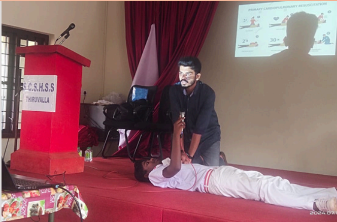
Pathanamthitta district counsellors meet and first aid training, Kerala

THE EARTH IS THE CRADLE OF HUMANITY, BUT MANKIND CANNOT STAY IN THE CRADLE FOREVER.