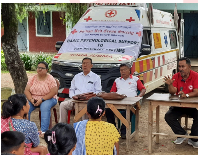
IRCS Manipur State Branch conducted 3 days basic psychological support awareness cum health camp programmes at Bishnupur district, Imphal West district, Thoubal district and Kakching district respectively in relief camps for IDPs inmates.