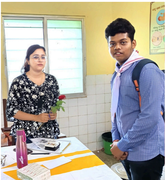
National Doctors Day celebration by Youth Red Cross of Boudh Panchayat College, Boudh, Odisha