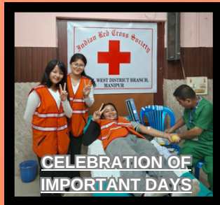
CELEBRATION OF IMPORTANT DAYS