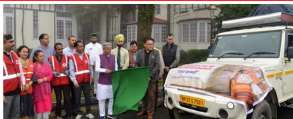
Hon'ble Governor & President of HP State Red Cross Society flagged off relief materials to the District Red Cross Branch Kullu.