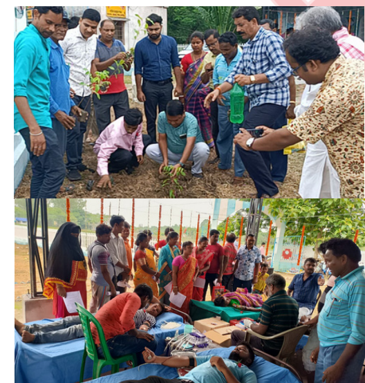
Dakshin Dinajpur District, Purulia District, Ghatal Sub Division branch, West Bengal observed National Doctors Day by holding blood donation camp and plantation drive.