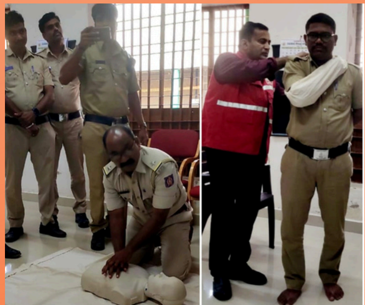
IRCS Chitradurga District branch, Karnataka conducted first aid/CPR training for jail police personnel.