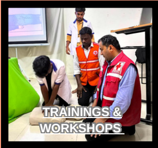
TRAININGS & WORKSHOPS