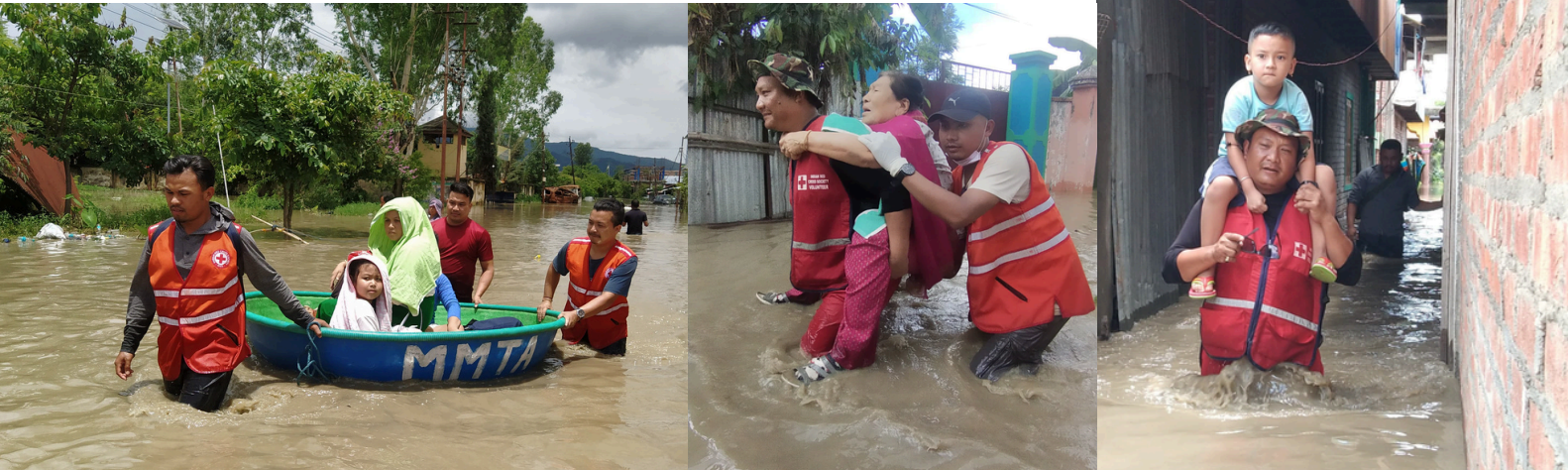
Volunteers of Emergency Response Team of IRCS IMPHAL WEST DISTRICT branch along with NDRF, SDRF and MMTA helped in evacuation of the stranded people affected by flood at Sinjamei, Kakwa and Khonangpheidekpi districts of Imphal.

LOVE AND COMPASSION ARE NECESSITIES, NOT LUXURIES. WITHOUT THEM HUMANITY CANNOT SURVIVE.