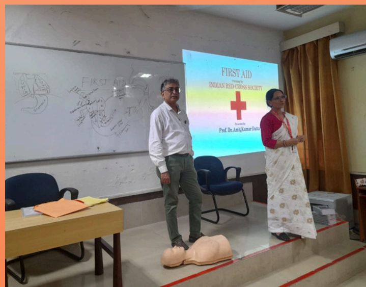
IRCS, West Bengal State Branch conducted first aid and disaster management training for the employees of NTPC Kahalgaon