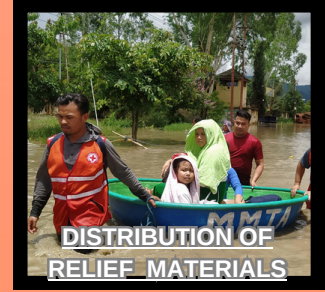
DISTRIBUTION OF RELIEF MATERIALS