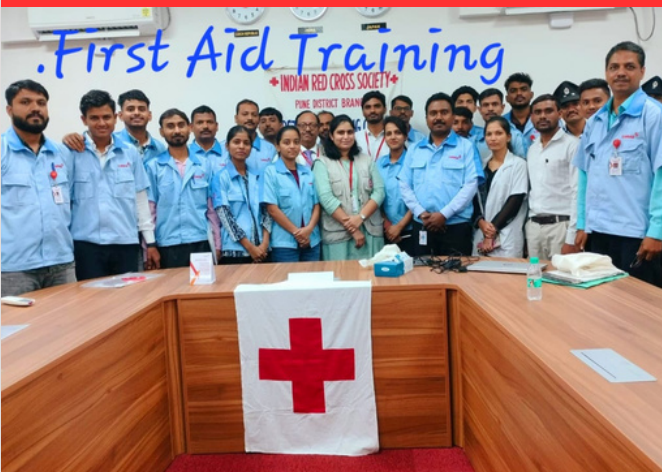
First aid training, Pune, Maharashtra