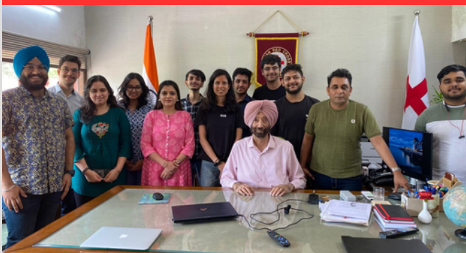
Students from BITS Pilani successfully completed their 2-month summer internship at the Indian Red Cross Society, Punjab State Branch