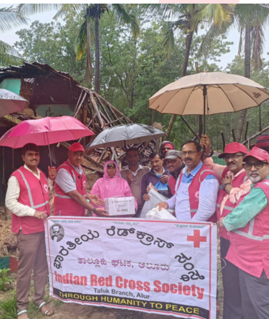
Those impacted by the rainfall received humanitarian aid from the Red Cross Hassan District Branch, Karnataka