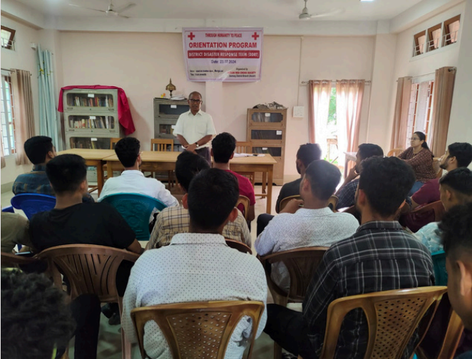
Darrang District Branch, IRCS organised orientation programme on first aid