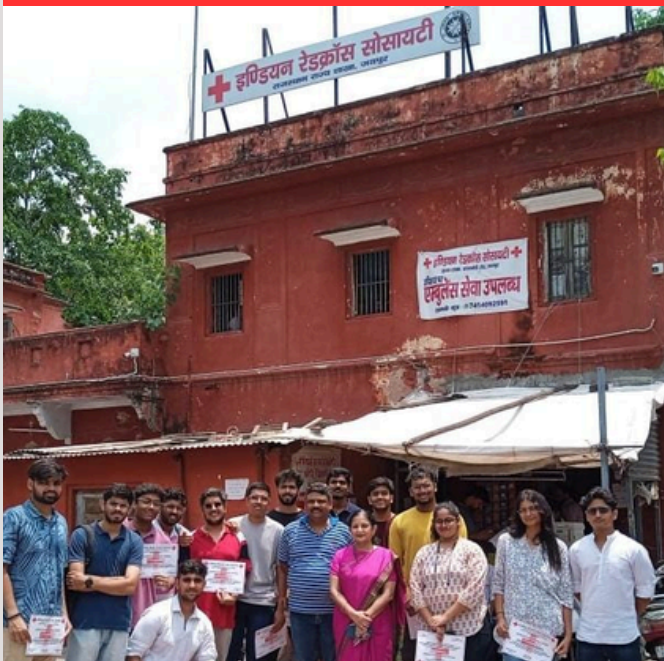
Students from BITS Pilani successfully completed their 2-month summer internship at the Indian Red Cross Society, Rajasthan State Branch.

THE EARTH IS THE CRADLE OF HUMANITY, BUT MANKIND CANNOT STAY IN THE CRADLE FOREVER.