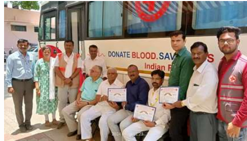
IRCS Davengere district branch, Karnataka organised series of blood donation camps at several cities through the blood mobile buses donated by IRCS NHQ.