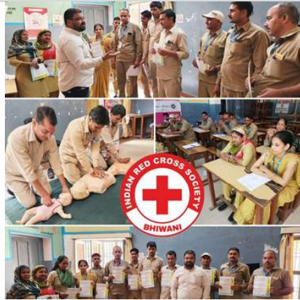
First aid training to drivers and conductors in Bhiwani district, Haryana.