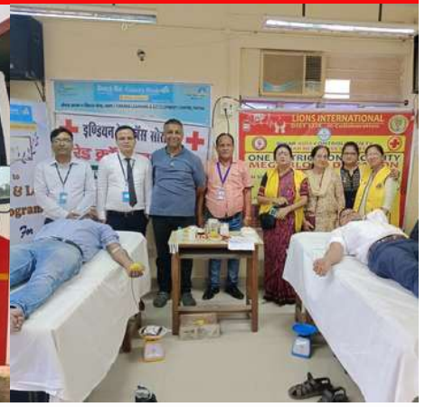
IRCS Bihar state branch organised voluntary blood donation camp in collaboration with Lions club, Patna, Bihar