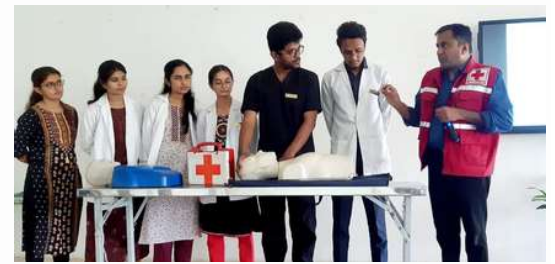
Training program on life saving BLS and CPR for post Graduate students and interns of Ambedkar Dental College and Hospital. Bangalore