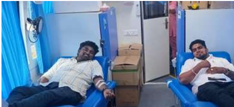
Blood donation camp, Kundrathur bus stand, Chennai,