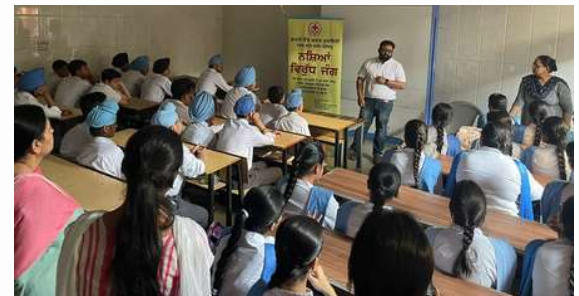
An awareness lecture was organized by Red Cross Drug De-addiction Centre, Patiala, Punjab at Shri Harkrishan Public School Patiala. 100 people benefited from this session.