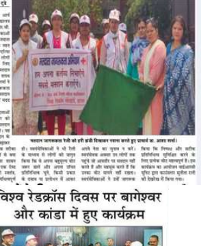
आज का दिन हमारे लिए एक विशेष दिन है, जहाँ हमने अपने समाज के लिए एक अच्छा काम किया है।