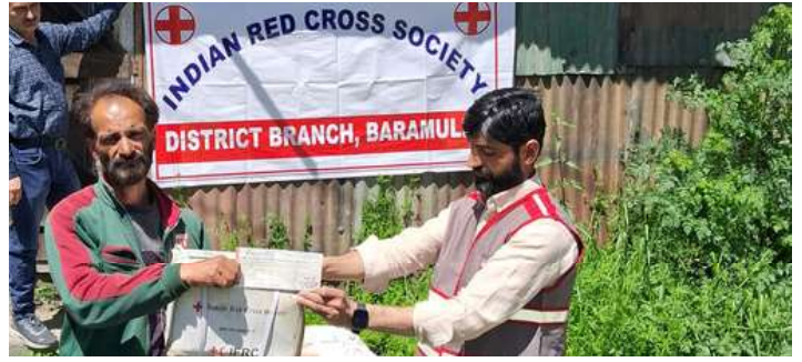
Rs 40000/- through cheques along with 4 kitchen sets, blankets, tarpaulins, buckets etc. were provided by the Chairman of District Red Cross, Baramulla to 04 fire victims of village Thajal Uri.