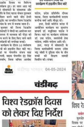
आज का दिन हमारे लिए एक विशेष दिन है, जहाँ हमने अपने समाज के लिए एक अच्छा काम किया है।