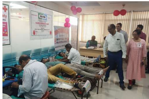
IRCS West Bengal state branch organised a blood donation camp in collaboration with IFFCO TOKIO GIC Park Street Kolkata