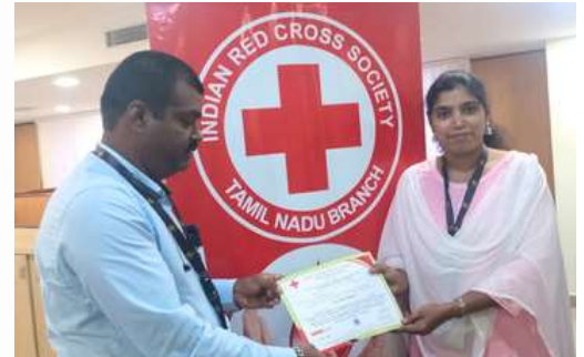
Blood donation was held at UPS, American multinational shipping & receiving and supply chain management company, Chennai