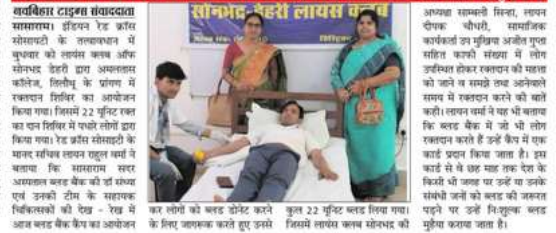
आज का दिन हमारे लिए एक विशेष दिन है, जहाँ हमने अपने समाज के लिए एक अच्छा काम किया है।