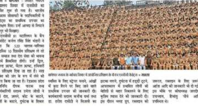
आज का दिन हमारे लिए एक विशेष दिन है, जहाँ हमने अपने समाज के लिए एक अच्छा काम किया है।