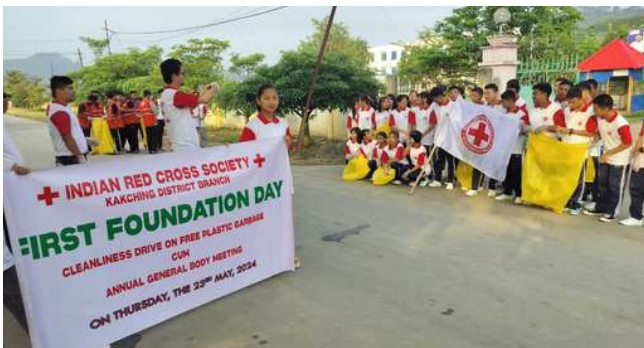
A plastic free campaign was organised on the first foundation day of IRCS, Kakching district branch, Manipur.