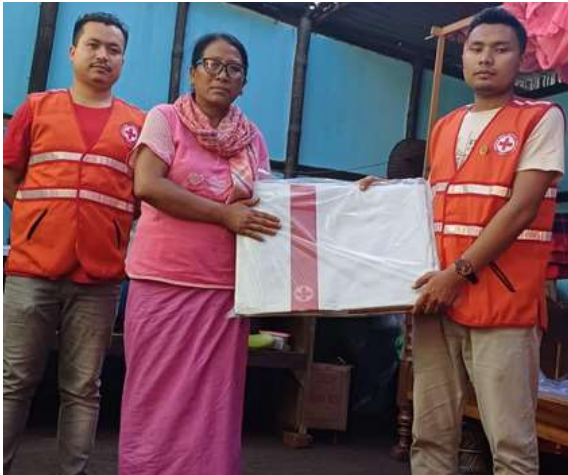
Families affected by hailstorms received tarpulins by the volunteers of Imphal West District Branch.