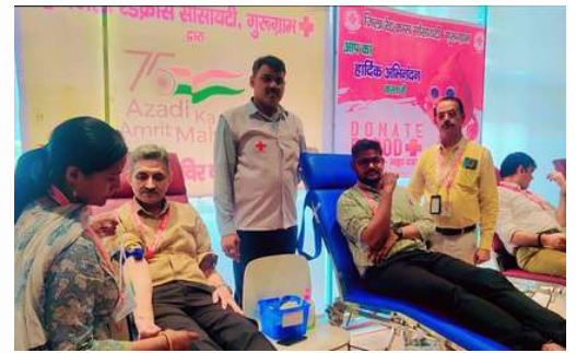
Blood donation camp organised by team DRCS Gurugram at Air India Office