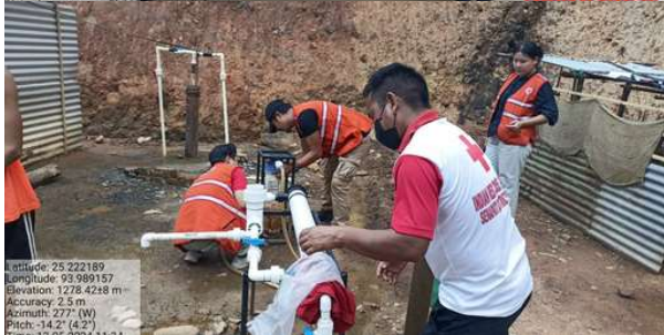
IRCS Senapati Branch youth volunteers held an awareness campaign about child safety and child feeding at several relief centers in Kangpokpi District. They also undertook social work on solid waste and drainage in relief centers in Kangpokpi.