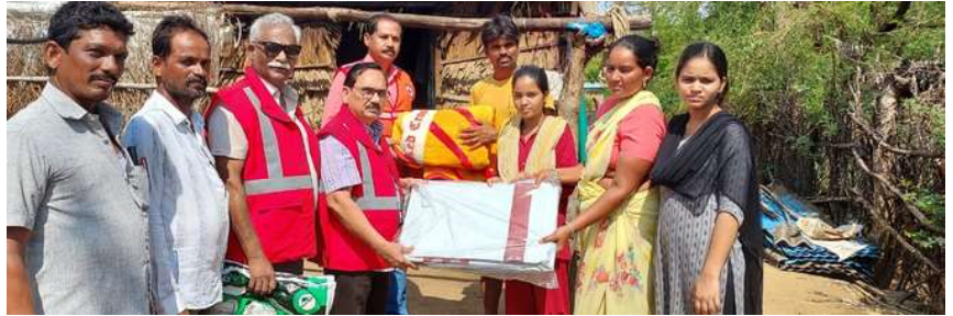
Distribution of tarpulins, blankets and mosquito nets amongst needy and poor of Garla Mandal, Mahabubabad, Telangana