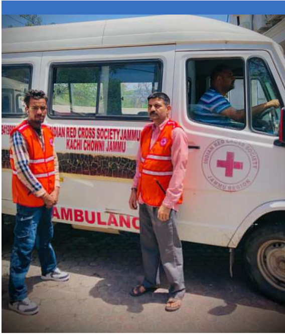
IRCS J&K branch provided essential relief to the victims of land sinking incident in Ramban.