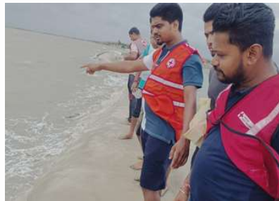
River and dams were monitored by the volunteers of IRCS North 24 Parganas district branch. Rescue operation were carried out and relief items were provided to the vulnerable.