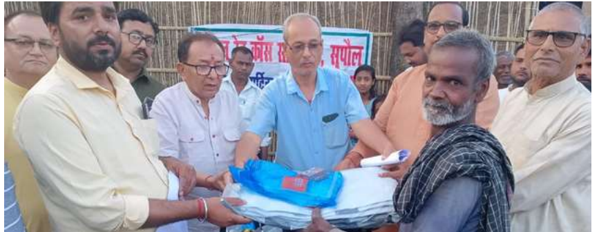
Distribution of tarpulins and mosquito nets amongst needy and poor, Supaul, Bihar