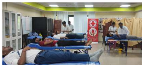
Blood donation camp at Valeo India, Chennai