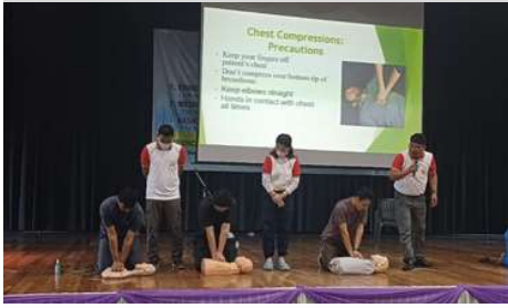
Programs in basic life support and CPR awareness were offered to medical postgraduate (MD/MS) students by IRCS Imphal West District, Manipur.