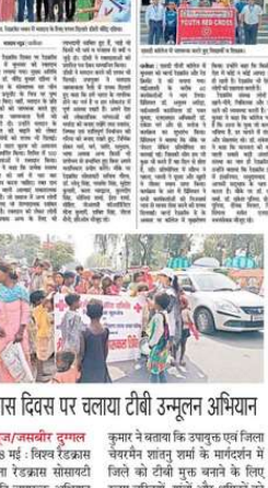
आज का दिन हमारे लिए एक विशेष दिन है, जहाँ हमने अपने समाज के लिए एक अच्छा काम किया है।