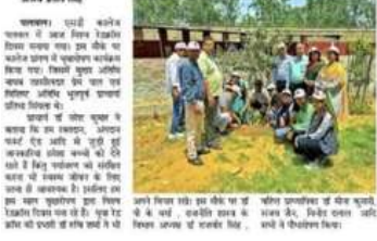
आज का दिन हमारे लिए एक विशेष दिन है, जहाँ हमने अपने समाज के लिए एक अच्छा काम किया है।