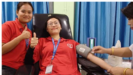
IRCS Manipur Branch together with CMC College of Nursing conducted a voluntary blood donation camp at RIMS.