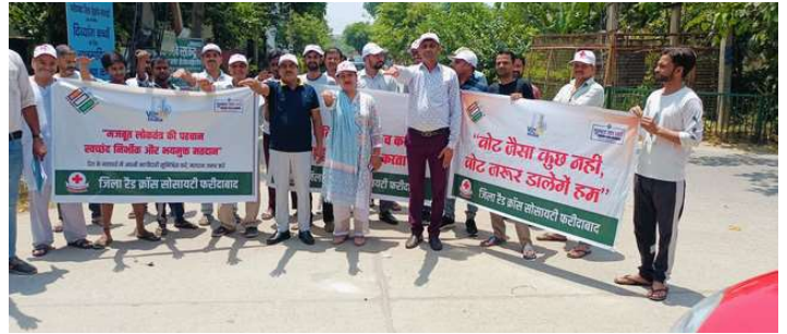
Employees of various projects located in Red Cross De-addiction Complex, Sector 14 Faridabad, Haryana were appealed to vote and everyone was made to take the voter oath.