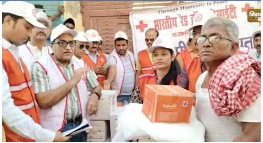
Distribution of relief items amongst the fire victims in Ratanpura village of Darbhanga district of Bihar