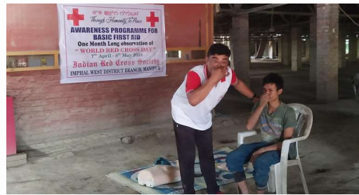
Volunteers of IRCS, Imphal West district branch conducted Awareness Programme for basic first aid to the workers of brick laying field at Lamsang.