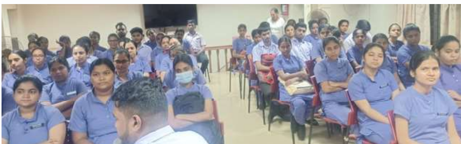
Students of the Institute of nursing education, Bambolim visited IRCS state branch at Panaji, Goa