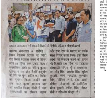
आज का दिन हमारे लिए एक विशेष दिन है, जहाँ हमने अपने समाज के लिए एक अच्छा काम किया है।