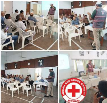
Professional First Aid Training at Hindustan Gum & Chemicals Limited, Bhiwani, Haryana