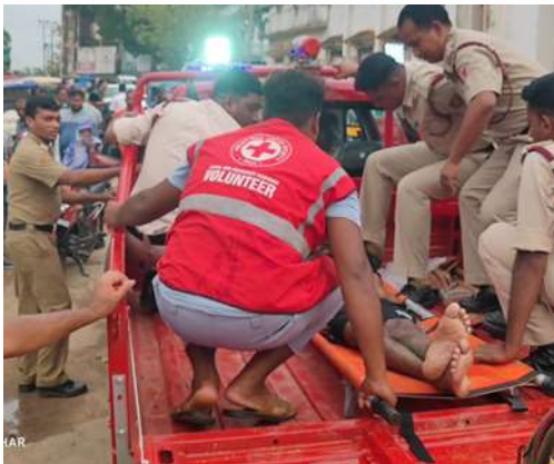
Mock drill exercise & awareness program on disaster management was held by IRCS, Sonamura Sub Divisional Branch, Tripura in collaboration with NDRF, fire service, TSR & other line departments on 18th May, 2024.