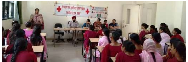
Red Cross Drug De-Addiction and Rehabilitation Center Nawanshahr, Punjab organized a drug awareness camp under "Nasha Mukat Bharat Abhiyan" at Government Industrial Training Institute, Nawanshahr (Punjab)