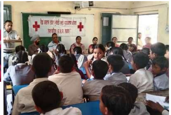
Red Cross Drug De-addiction and Rehabilitation Center Nawanshahr, Punjab organized an awareness camp under "Nasha Mukat Bharat Abhiyan" at Government High School, Bhin (Nawanshahr).