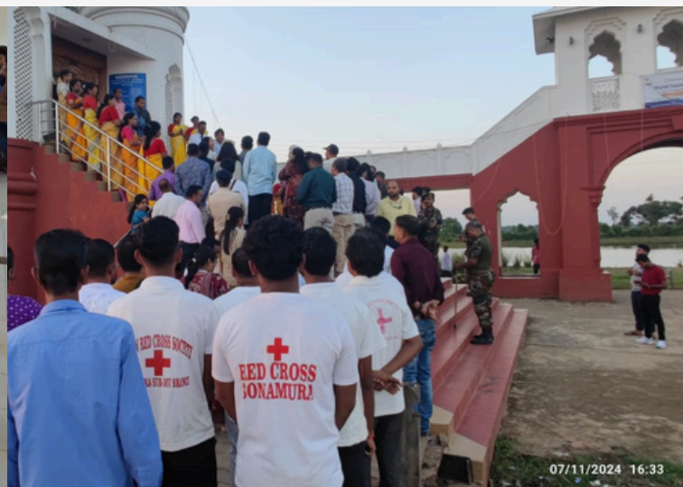
Volunteers from the IRCS Sonamura Sub-Divisional Branch served as a support/rescue team in Rudra Sagar/Neermahal during the National Director TRLM visit.