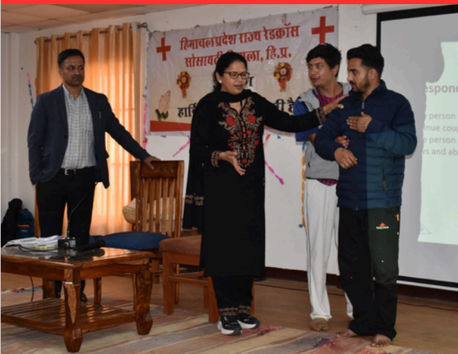
The HP State Red Cross Branch provided first aid training to prisoners in Model Central Jail, Kanda District Shimla.

THE EARTH IS THE CRADLE OF HUMANITY, BUT MANKIND CANNOT STAY IN THE CRADLE FOREVER.