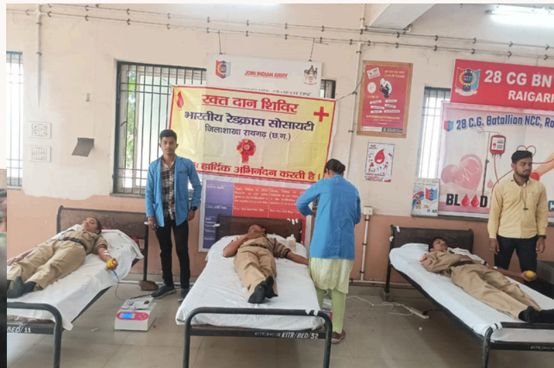
Blood donation camp, Raigarh, Chhattisgarh