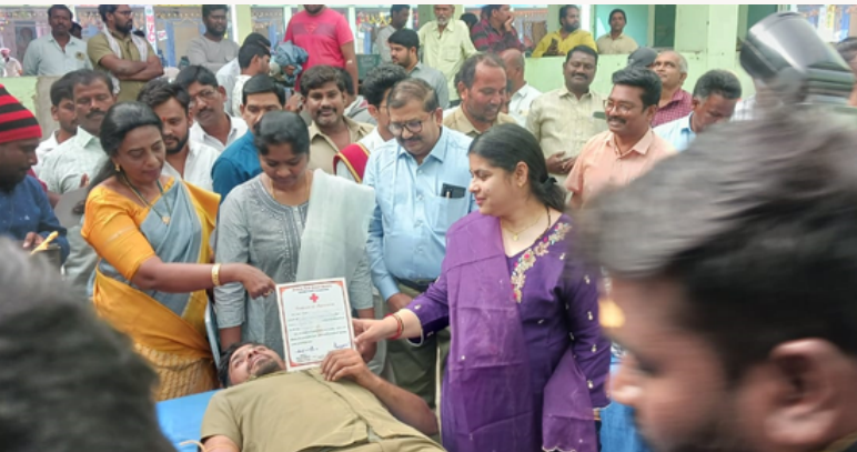
Blood donation camp, Hanumakonda, Telangana