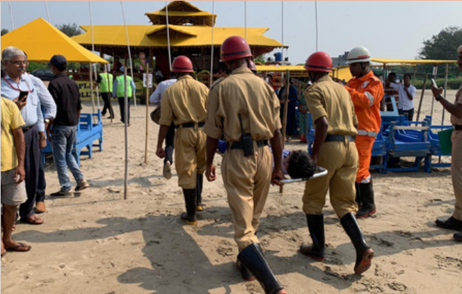
YRC Volunteers participated in the National Tsunami Mock exercise at Turtle Beach Morjim, Goa

THE GREATNESS OF HUMANITY IS NOT IN BEING HUMAN, BUT IN BEING HUMANE