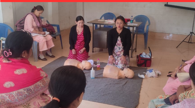
First Aid training of the ANM/GNMs of Imphal East was conducted at IRCS, Manipur state branch