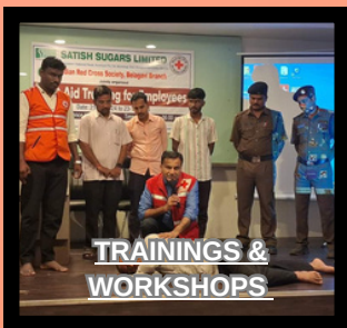
TRAININGS & WORKSHOPS