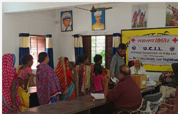
Eye check up camp in collaboration with UCIL was held at Badiya Panchayat, Jamshedpur, Jharkhand