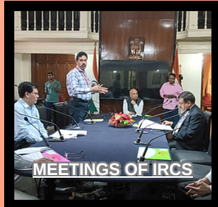
MEETINGS OF IRCS