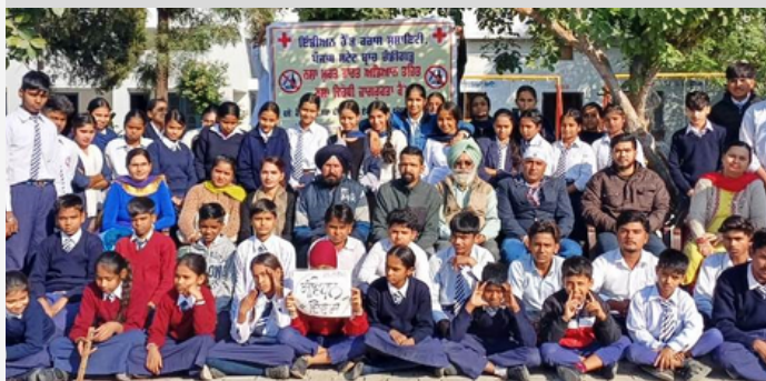
IRCS, Punjab State Branch, had the privilege of hosting a Karate team from Nepal at its Integrated Rehabilitation Centre for Addicts in Nawanshahr, Punjab