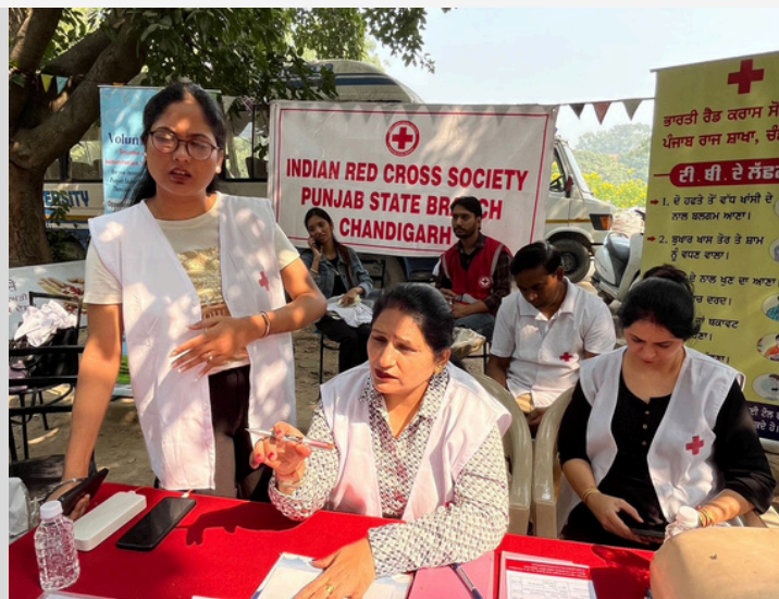
IRCS, Punjab State Branch participated in the event TARANG organised by Punjab University, Chandigarh. More than 450 people benefited from the event.