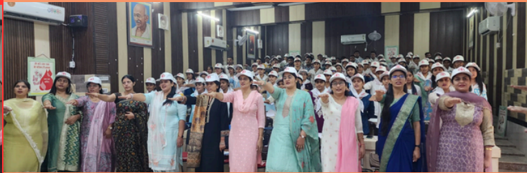
District Red Cross Branch, Bhiwani, Haryana organised District Level Youth Red Cross Training Camp from 5th to 9th November, 2024 at Pt. Sita Ram Shastri College, Bhiwani.