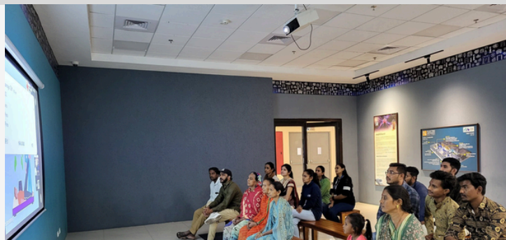
Online physiotherapy seminar was held by IRCS Gujarat.