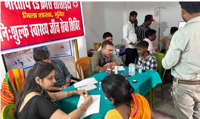
Free health check up camp, Munger, Bihar