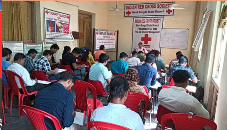
Training on first aid/disaster management, West Bengal State Branch

THE DESIRE FOR THE WELL-BEING OF ONE'S OWN NATION CAN BE- AND MUST BE-MADE COMPATIBLE WITH THE WELFARE OF ALL HUMANITY.