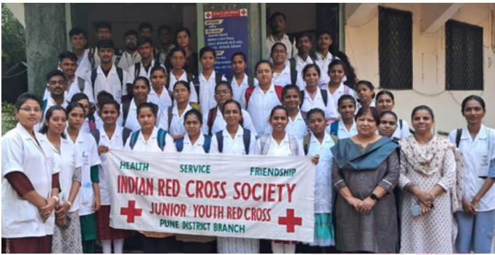
IRCS Pune, Maharashtra conducted an awareness session on Red Cross activities at Shrimati Subhadra K. Jindal College of Nursing, Pune,