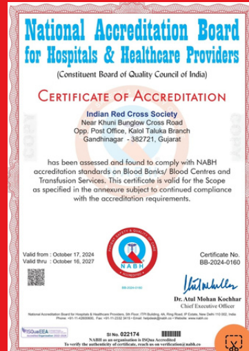
IRCS Gandhinagar, district branch blood centre and transfusion services has received the accreditation certificate from NABH.