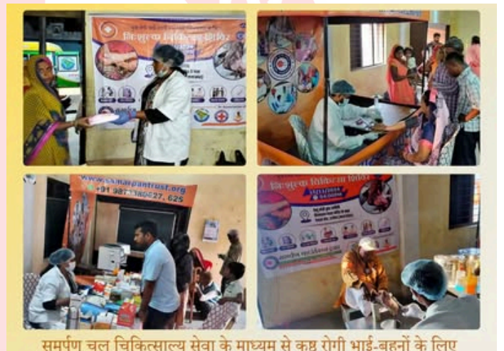
समर्पण चल चिकित्सालय सेवा के माध्यम से कृष्ट रोगी भाई-बहनों के लिए