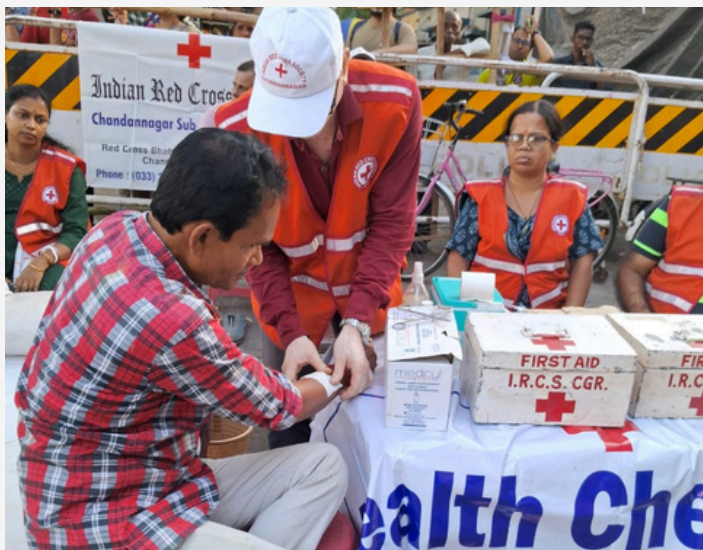
IRCS Chandannagar S.D. Branch, Hooghly District, is conducting a first aid post during the immersion of Jagadhatri Idol.