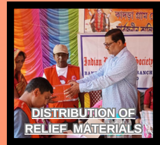
DISTRIBUTION OF RELIEF MATERIALS