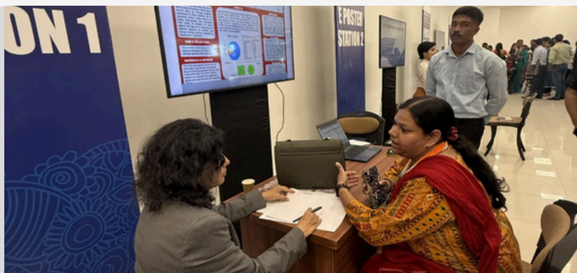
Staff of Ahmedabad Red Cross attended National Conference held at Gandhinagar, Transcon 2024.

“WE MAKE A LIVING BY WHAT WE GET, BUT WE MAKE A LIFE BY WHAT WE GIVE.” - WINSTON CHURCHILL