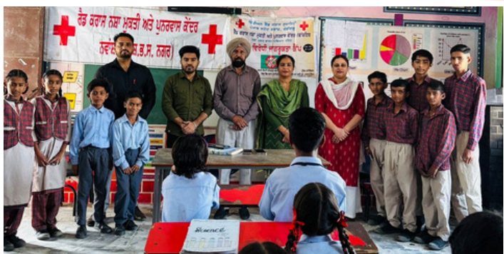
The Indian Red Cross Society, Punjab State Branch, organized a drug awareness camp at Government Middle School, village Raipur, Balachaur block, under the "Nasha Mukat Bharat Abhiyan" initiative.