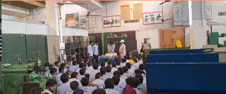
District Red Cross Branch, Ambala, Haryana organised First Aid Training for Industrial Workers on 10th November 2024.