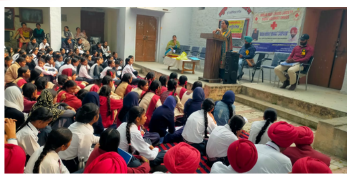
IRCS, Punjab State Branch Integrated and Rehabilitation Center for Addicts, Gurdaspur, staged a mass drug awareness program under the "Nasha Mukat Bharat Abhiyan" and a mass counseling camp at Eminence School at Shri Hargobindpur. Over 30 schools from the Gurdaspur district attended the camp.