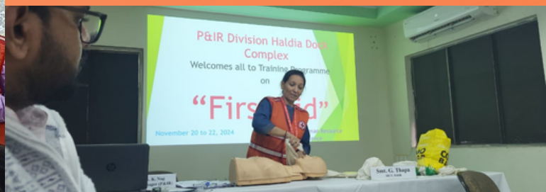
The IRCS WBSB provided three days of first aid training to the Haldia Dock Complex (Corporate) staff.