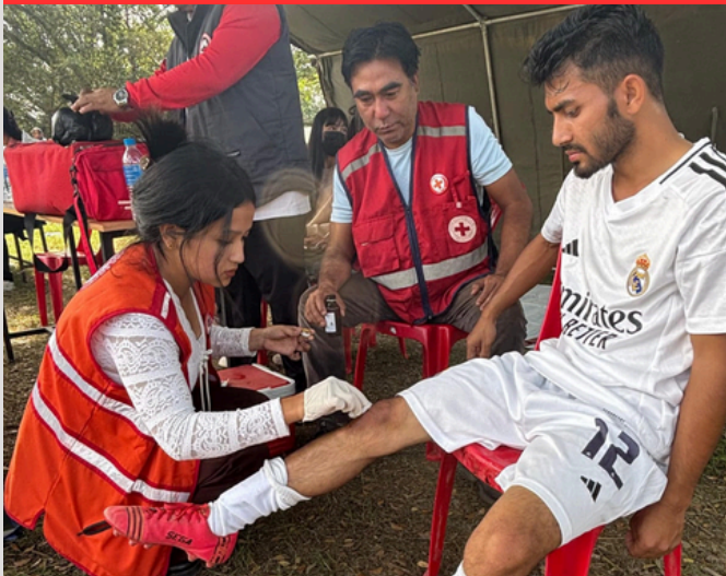
IRCS Imphal West District Branch opens first aid post on the occasion of DM University sports week from 7th to 9th November at DM University complex.