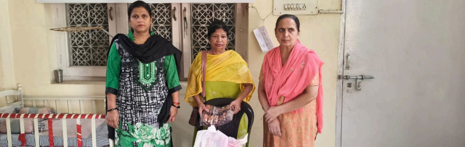
The Indian Red Cross Society, Punjab State, District Branch Amritsar, distributed ration kits to needy families in the city, continuing its humanitarian efforts.