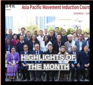
HIGHLIGHTS OF THE MONTH

SPECIAL COVERAGE- ASIA PACIFIC INDUCTION COURSE 2024 HELD AT SOZHOU, CHINA, FROM 26TH TO 30TH OF NOVEMBER