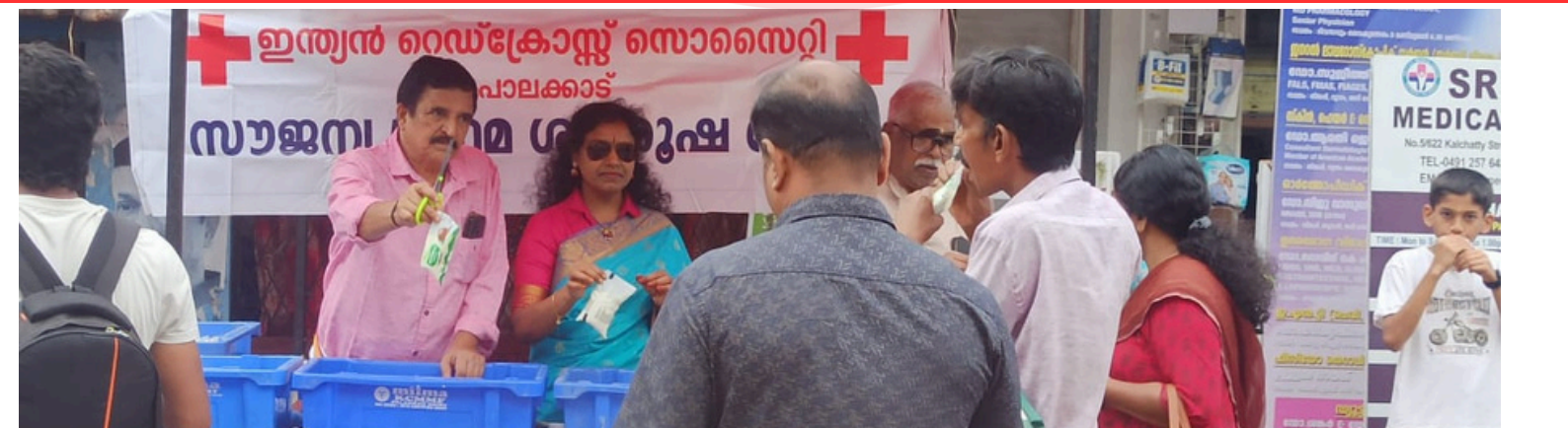
IRCS Palakkad district branch distributed buttermilk to the pilgrims of the great car festival of Kalpathy Palakkad.