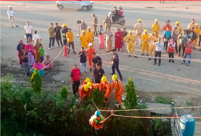
IRCS IMPHAL WEST DISTRICT BRANCH, MANIPUR, in collaboration with NDRF, CRPF, Manipur Fire Service, Airport Fire Service, Local Police personnel, Traffic Police personnel, local leaders, and IOCL Imphal Depot personnel, conducted an offsite emergency response drill (mock drill) at IOCL Imphal Depot, Manipur