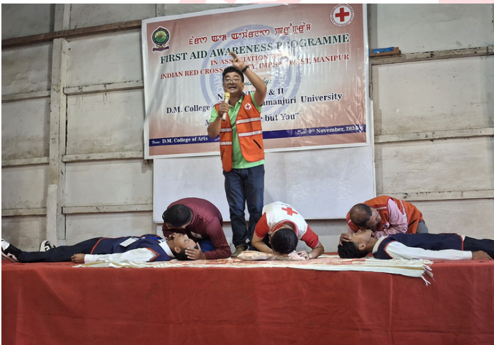
IRCS Imphal West Manipur conducted first aid awareness programme in association with D.M college of Arts, Dhanamanjuri University.