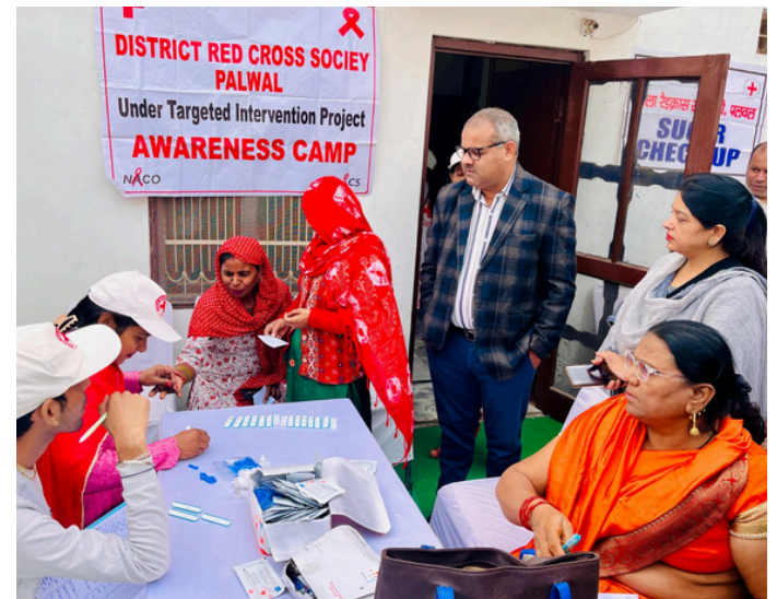
District Red Cross Branch, Palwal, Haryana organised various activities i.e. Voluntary Blood Donation Camp, TB Awareness Programme, Drug-de-addiction workshop.