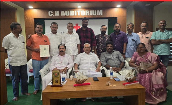
First aid training, Vatakara Sub district branch, Kerala

Indian Red Cross Society, Haryana State Branch organised various events and programmes like health awareness programme, TB Awareness campaign, Voluntary Blood Donation Camp, Membership Drive etc. through its District Red Cross Branches (Ambala, Jind, Bhiwani, Fatehabad, Gurugram, Kaithal, Karnal, Palwal, Panchkula & Rohtak from 6th to 12th November, 2024.