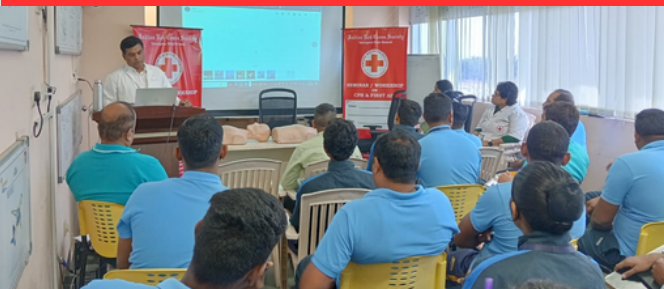
A three day First Aid Training program was held at Rajeev Gandhi International Airport, Hyderabad