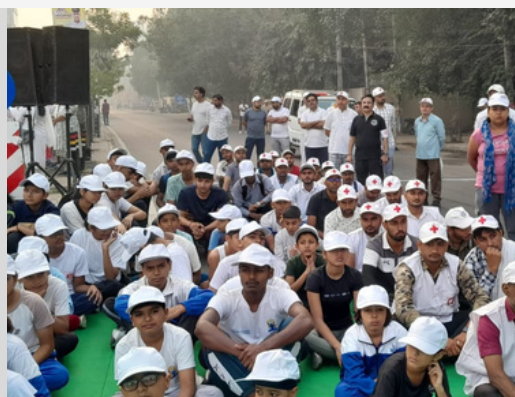
Run For Unity, Red Cross Rohtak Haryana