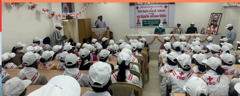
District Red Cross Branch, Fatehabad, Haryana organised District Level Youth Red Cross Training Camp from 7th to 11th November, 2024 at Manohar Memorial College, Fatehabad.