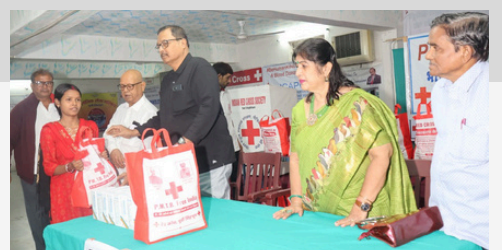
Distribution of nutritious kits to TB patients, Jamshedpur, Jharkhand