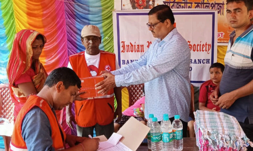
IRCS, Bankura District Branch, West Bengal distributed hygiene kits, kitchen sets, buckets, bed sheets, tarpaulins & towels to the needy & vulnerable people at Kadra Village.

LOVE AND COMPASSION ARE NECESSITIES, NOT LUXURIES. WITHOUT THEM HUMANITY CANNOT SURVIVE.