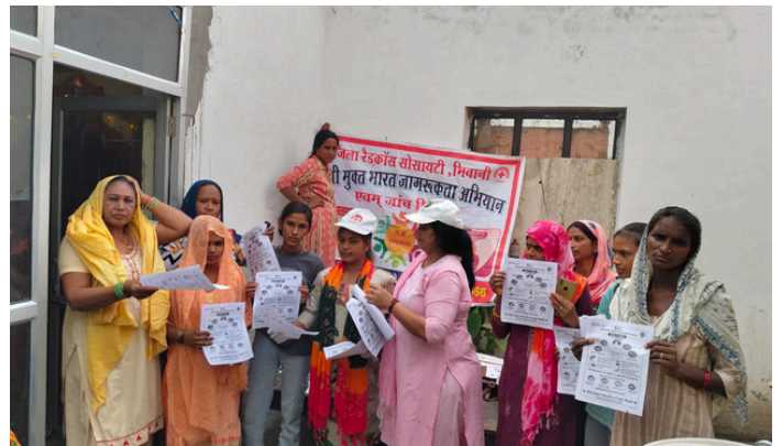
TB awareness programme, Bhiwani, Haryana