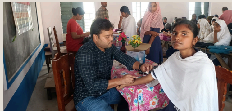
Two Thalassemia Detection Camps were held at Kamari, Nadia, West Bengal ; at Kamari High School (H.S.) & Kaliganj Rural Hospital, Kaliganj. These camps were organized by IRCS Kaliganj Branch & carried out by the Sadar Hospital's Thalassemia Control Unit in Krishnanagar, Nadia.