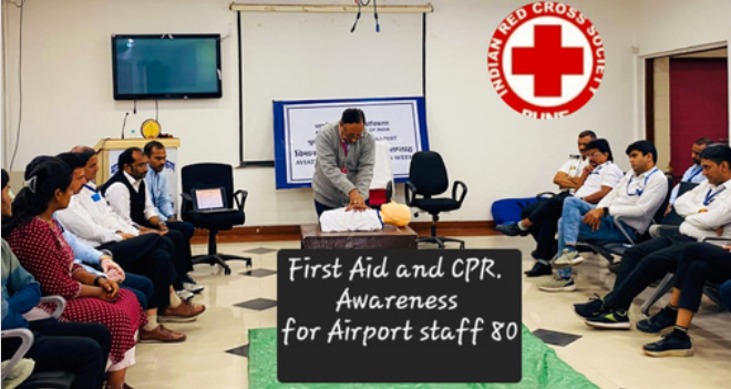
On the occasion of Aviation Safety Awareness Week 2024 first aid training was imparted to the officers and staff of all departments and sections working at AAI Pune airport