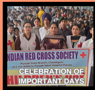
CELEBRATION OF IMPORTANT DAYS