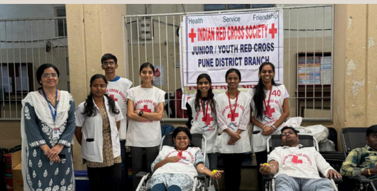
Blood donation camp, Pune, Maharashtra