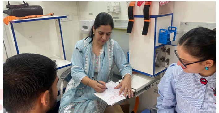
Indian Red Cross Society J&K Organized Medical and Eye Check-up Camp at Govt. Boys Pahari Hostel, Jammu