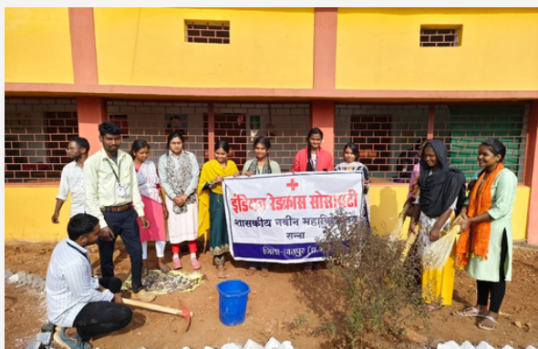
Cleanliness drive was conducted in Government College Sanna District Jashpur by the Red Cross students along with Eco Club