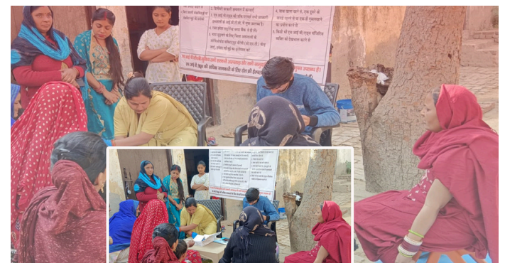
HIV/AIDS awareness and testing camp organised by TI run by District Red Cross Society Palwal in Kailash Nagar.