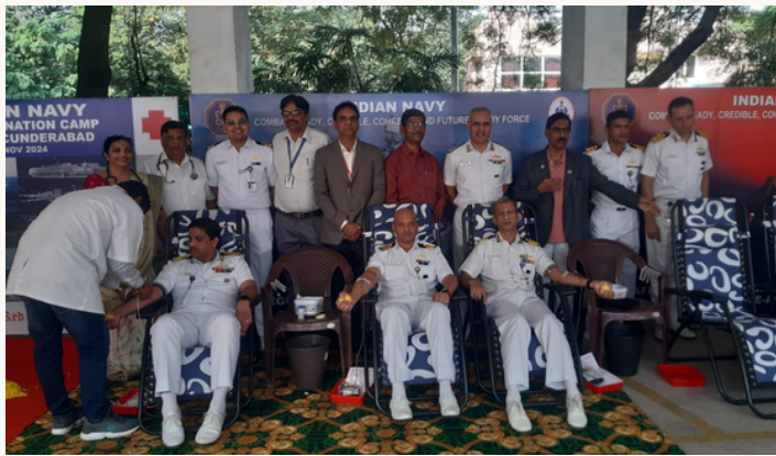
The CEO of the IRCS Telangana State Branch and the Director of the Defence Machinery Development Establishment (DMDE) inaugurated a blood donation camp in Bowinpalli, Hyderabad.