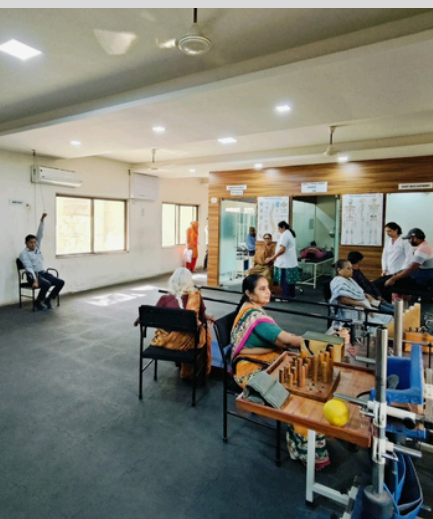
Physiotherapy session was held by Gujarat Sate branch