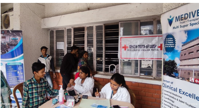
Health Check up camp at Red Cross Bhawan, Patna, Bihar