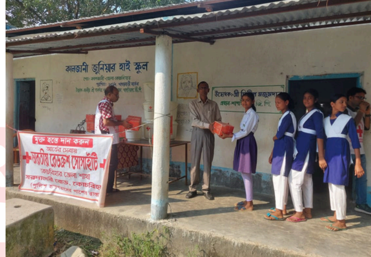
The IRCS Cooch Behar District branch, West Bengal distributed hygiene kits, plastic buckets, and other supplies to underprivileged and needy students at a junior high school in Kaljani, Cooch Behar District.