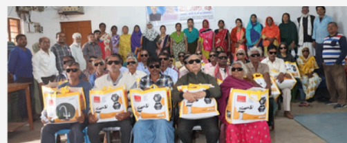
Eye check up camp, Jamshedpur, Jharkhand