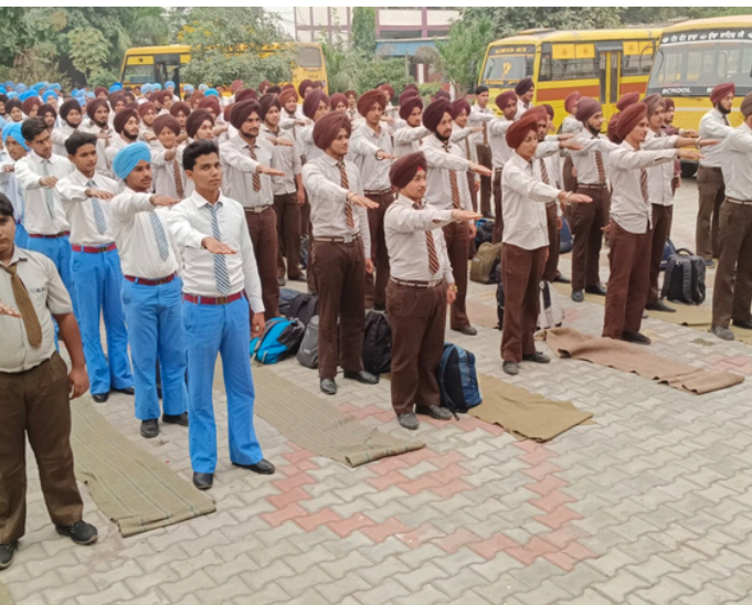
IRCS Punjab State Branch Chandigarh organised an awareness camp at Golden view Public Sr. sec. school, village Tarpalla block Dera Baba Nanak.