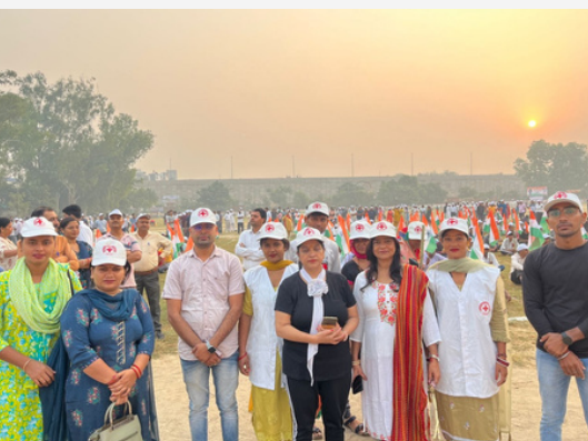
Run For Unity, Red Cross Palwal, Haryana