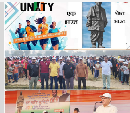
Run For Unity, Red Cross Bhiwani, Haryana