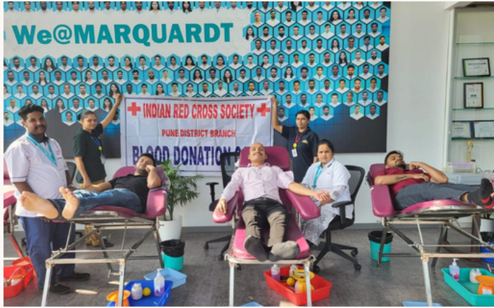
IRCS Pune organized blood donation camp at Hinjewadi

EMPATHY IN ACTION: WHERE EVERY DONATION BECOMES A LIFELINE.