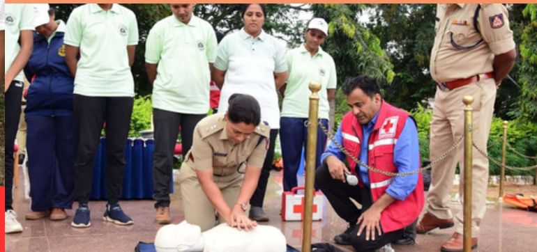
IRCS Davanagere District branch, Karnataka organised training for police officers of Davanagere Police Department and civilians on life-saving techniques for road accidents, fires, water emergencies, and health-related emergencies.