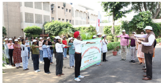
University Youth Red Cross of Guru Jambheshwar University, Hissar celebrated National Voluntary Blood Donation Day