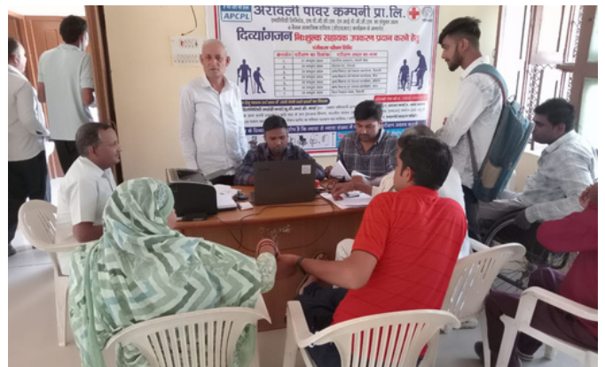
District Red Cross Branch, Bhiwani, Haryana organised assessment camps for physically challenged persons of the community in association with ALIMCO (A Unit of Govt. of India)