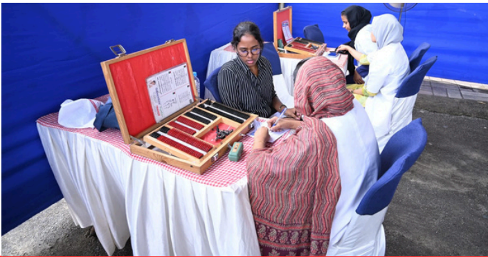
Eye Checkup camp, IRCS, Malappuram district branch, Kerala