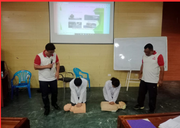
First aid program was conducted for foundation course 2024-25 for 1st year MBBS students, Imphal West District Branch.