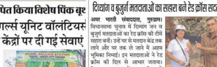
आईजी कॉलेज वॉलंटियर्स ने मतदान में दिव्यांगों व बुजुर्गों को दी सहायता।

आईजी कॉलेज वॉलंटियर्स ने मतदान में दिव्यांगों व बुजुर्गों को दी सहायता। The students of the college actively participated in the election process, ensuring that all eligible voters had a smooth experience.