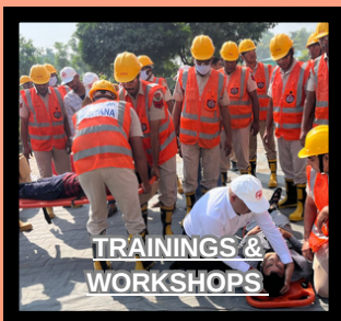
TRAININGS & WORKSHOPS