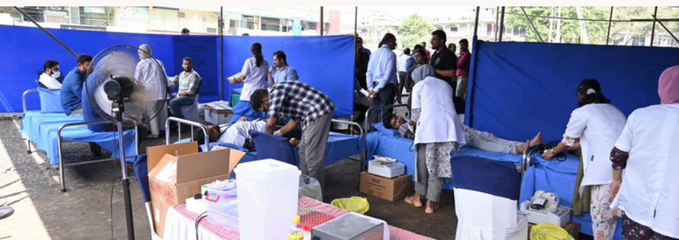
Blood donation camp, IRCS, Malappuram district camp, Kerala