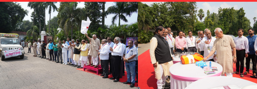
Hon'ble Governor of Bihar and President of IRCS, Bihar State Branch Sh. Rajendra Vishwanath Arlekar flagged off relief materials to 17 flooded districts of Bihar.

For more details click below; https://tinyurl.com/bdd36tjk