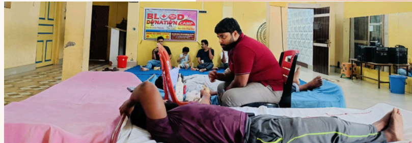
Blood donation camp was jointly organised by Golden Wings English Medium School, Debagram, Nadia, West Bengal & IRCS, Kaliganj Block Branch, Nadia District at school premises