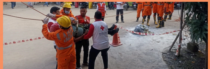
Mock Drill was held at Imphal West DC complex in collaboration with NDRF, DC office staff, Manipur Fire Service, Imphal West Police, CMO Imphal West and IRCS Imphal West District Branch.