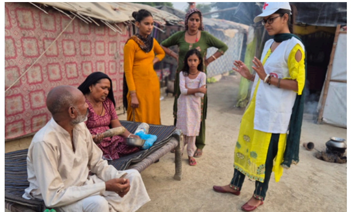
District Red Cross Branch, Narnaul, Haryana organised TB awareness campaign. During this campaign volunteers of Red Cross visited in the slum areas of the community and share important information about TB.