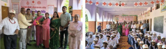
शिविर के चौथे दिन जूनियर्स को मोबाइल के दुष्प्रभाव, स्वच्छता, प्राथमिक सहायता, कापड़ा अपरिहार इत्यादि के बारे में जानकारी दी गयी।