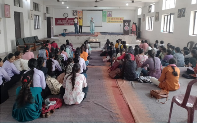
First Aid Training and awareness campaign about drug-de-addiction organised by District Red Cross Branch, Kurukshetra Branch, Haryana at Government Women College Kurukshetra.

THE DESIRE FOR THE WELL-BEING OF ONE'S OWN NATION CAN BE- AND MUST BE-MADE COMPATIBLE WITH THE WELFARE OF ALL HUMANITY.