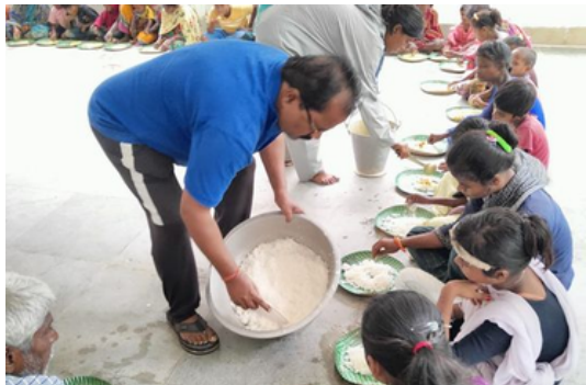
Red Cross volunteers served food at the temporary shelters created for the Dana affected people.