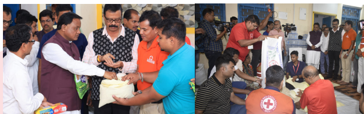
Hon'ble Chief Minister of Odisha Shri Mohan Charan Majhi and Hon'ble Minister of Revenue and Disaster Management Shri Suresh Pujari visited the Red Cross Bhawan to see preparations being made to respond to the Dana cyclone. Shri Mohan Charan Majhi appreciated the preparedness activities at Red Cross Bhawan and inspected the material being packed for the needy of Dana cyclone.