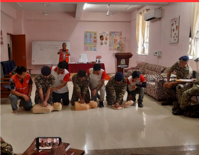
IRCS Imphal West District Branch conducted first aid training program for CRPF jawans of Nagaland & Manipur at Group Centre Manipur and Nagaland Sector CRPF Langjing, Imphal