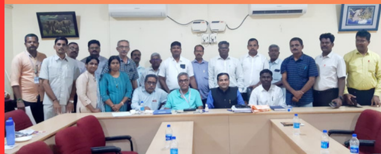
Assessment of First Aid Lay Lectures of IRCS Tamilnadu state Branch and st John Ambulance Tamilnadu was conducted at Chennai.