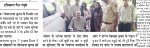
दिव्यांग जन व बुजुर्ग मतदाताओं का सहरा बने रेड क्रॉस के सदस्य।

दिव्यांग जन व बुजुर्ग मतदाताओं का सहरा बने रेड क्रॉस के सदस्य। The members of the Red Cross organization are dedicated to providing support and assistance to all voters, regardless of their physical abilities.