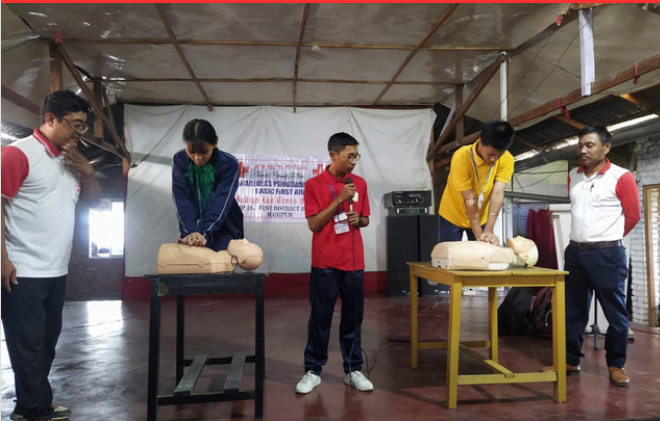
IRCS Imphal West District and 12 BN NDRF conducted one day school safety program at Vale Academy

THE GREATNESS OF HUMANITY IS NOT IN BEING HUMAN, BUT IN BEING HUMANE