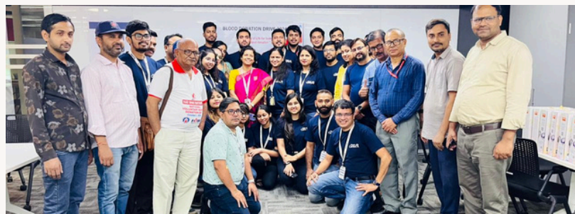
Blood donation camp at Fluor Danials in Gurugram, Haryana

IRCS NHQ BLOOD CENTER TIMINGS FOR BLOOD DONATION: MONDAY- SATURDAY (EXCEPT 2ND SATURDAY): 9 AM - 7 PM 2ND SATURDAY, SUNDAY, PUBLIC HOLIDAYS: 10 AM - 6 PM NOTE: THE NHQ BLOOD CENTER IS OPEN 24/7 FOR ISSUE OF BLOOD