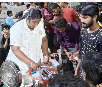
IRCS, Thiruvallur district branch, Tamil Nadu provided relief items to the needy and vulnerable.