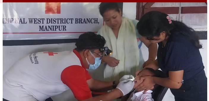
Dental camp was held at HD Foundation, Lamdeng, Manipur,