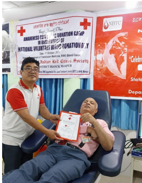
IRCS, Imphal East & Imphal West District Branches of Manipur organised Voluntary Blood Donation programmes in different centres