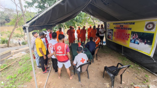
Volunteers of IRCS, Sonamura Sub-Divisional Branch, participated in drowning rescue Drill at Goumati River, Sonamura, Tripura

THE GREATNESS OF HUMANITY IS NOT IN BEING HUMAN, BUT IN BEING HUMANE