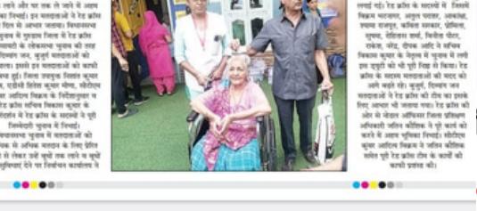
मतदाताओं ने रेड क्रॉस की दल से जताया आभार।

मतदाताओं ने रेड क्रॉस की दल से जताया आभार। The voters expressed their gratitude for the assistance provided by the Red Cross team during the election process.