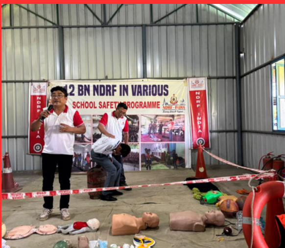
IRCS Imphal West District and 12 BN NDRF Conducted one day school safety program at AJAD english school

THE EARTH IS THE CRADLE OF HUMANITY, BUT MANKIND CANNOT STAY IN THE CRADLE FOREVER.