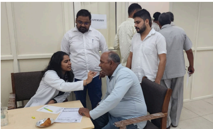
District Red Cross Branch, Bhiwani, Haryana organised health checkup camp for the community. During this camp eye check up and general health check-up was conducted for the underprivileged persons of the society.