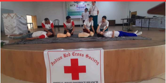
One Day Awareness program for Blood Donation and Basic First Aid conducted for General Nursing and Midwifery (GNM) and Bachelor of Science in Nursing (BSc nursing) Students at RDO Nursing Institute Lamsang, Imphal West District Branch, Manipur.