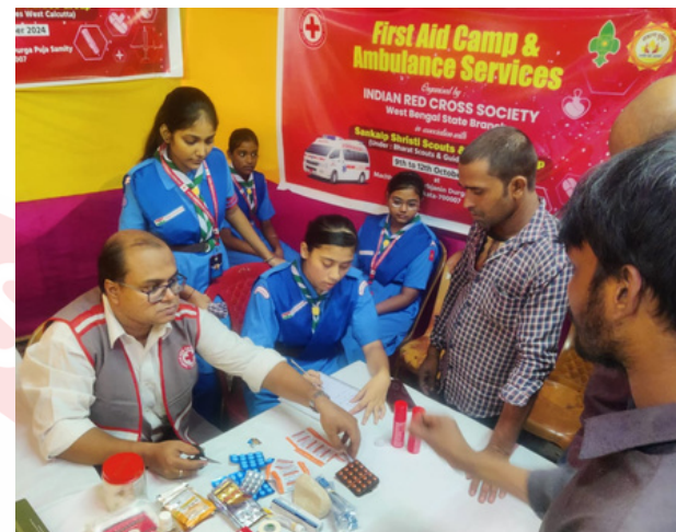
First aid Post and Ambulance team was deployed at Mechua Bazar Sarbojanin Durga Puja Pandal, Bara Bazar, Kolkata for Medical/ Firt Aid Support to the visitors at the puja pandal.