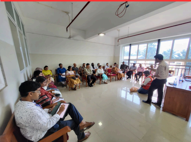
First Aid Training, IRCS Kerala State Branch

THE DESIRE FOR THE WELL-BEING OF ONE'S OWN NATION CAN BE- AND MUST BE-MADE COMPATIBLE WITH THE WELFARE OF ALL HUMANITY.