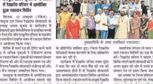
थैलेसीमिया से ग्रस्त बच्चों को नया जीवन देने के लिए 50 युवाओं ने किया रक्तदान।

थैलेसीमिया से ग्रस्त बच्चों को नया जीवन देने के लिए 50 युवाओं ने किया रक्तदान। The donors' selfless act will help improve the quality of life for many children suffering from the disease.