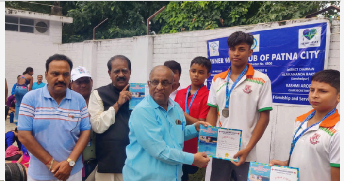
Indian Red Cross Bihar State Branch felicitated the winners of the school swimming champion, Patna City, Bihar