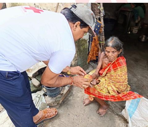
Distribution of fruits and dry food in Leprosy Colony on Gandhi Jayanti, Boudh, Odisha