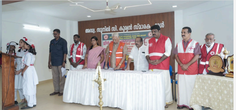
In memory of Jean Henry Dunant, the founder of the Red Cross, the Kerala state branch conducted Jean Henry Dunant Memorial Quiz and also Elocution competition at Kottayam, Kerala.