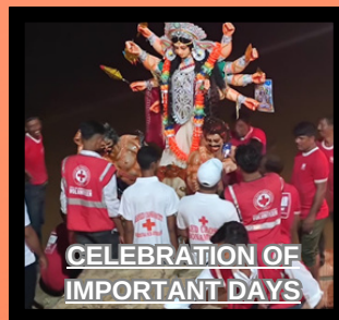
CELEBRATION OF IMPORTANT DAYS