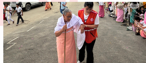
IRCS Imphal West District Branch opened first aid post at Hiyangthang temple, from 10th to 11th October on the occasion of Durga Puja