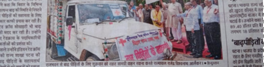
बाहू पीड़ितों की मदद सराहनीय कदम: राज्यपाल।

बाहू पीड़ितों की मदद सराहनीय कदम: राज्यपाल। The government's initiative to support victims of violence is a commendable step towards justice and rehabilitation.