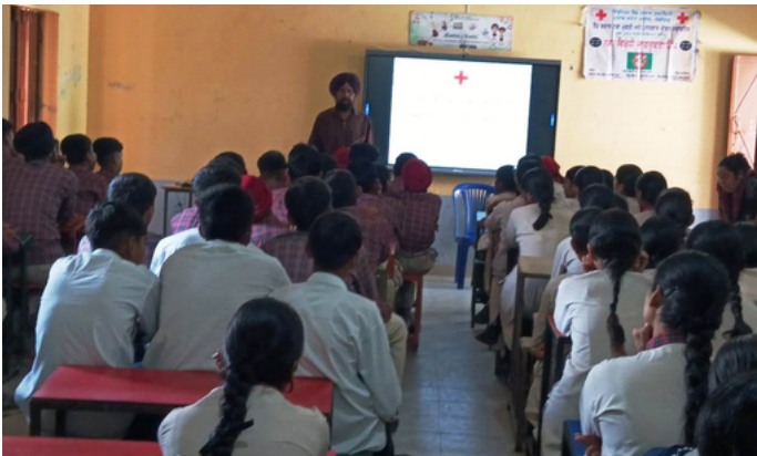
Red Cross Integrated Rehabilitation Center for Addicts, Nawanshahr organized a drug awareness camp under "Nasha Mukat Bharat Abhiyan" at Government Sen. Sec. School, Musapur (S.B.S. Nagar).