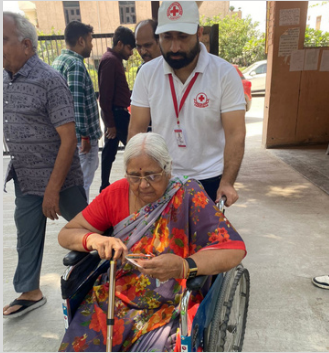
Volunteers from Haryana State Branch rendered their selfless services during Haryana Assembly Elections. They provided assistance to the senior citizens and physically challenged persons during this period.