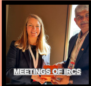
MEETINGS OF IRCS