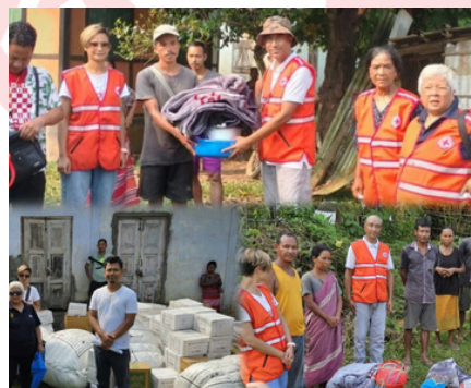
Distribution of relief materials amongst flood victims at South Garo Hills, Meghalaya. For more details click on the link ; https://tinyurl.com/5n6a6m5v