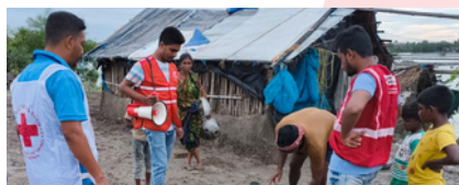
IRCS, North 24 Parganas District, West Bengal deployed disaster management trained Red Cross volunteers at Sandeshkhali -II Block areas to disseminate early warning messages to the vulnerable communities of the Sundarban coastal areas.