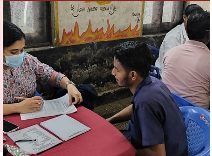
On account of Goa State Road Safety Week, IRCS Salcete Branch along with Sarthak Foundation and South Goa Directorate of Transport organised a medical and eye check up camp for the staff of Kadamba Transport Corp. Margao Depot.