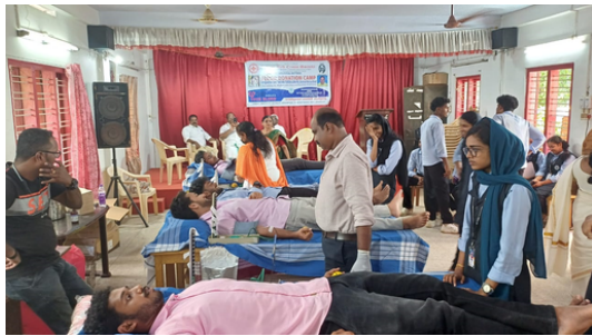
Blood donation camp, kollam, kerala