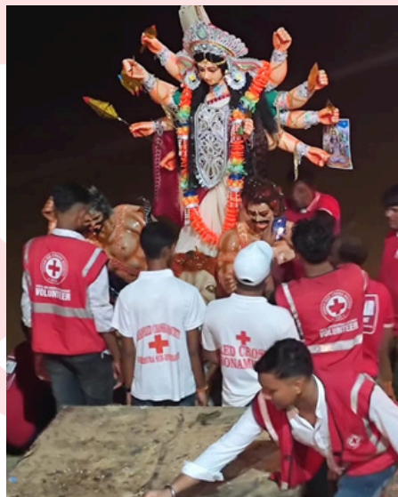
IRCS, Sonamura Sub-Divisional Branch, Tripura, assisted administration for Durga idol immersion