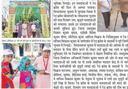
हॉलिय में स्थापित किया विशेष पिक बस एन.एस.एस. गर्स यूनिट वॉलंटियर्स द्वारा मतदान केंद्रों पर दी गई सेवाएं।

हॉलिय में स्थापित किया विशेष पिक बस एन.एस.एस. गर्स यूनिट वॉलंटियर्स द्वारा मतदान केंद्रों पर दी गई सेवाएं। The special bus service is a valuable addition to the election infrastructure, ensuring that voters can reach their polling stations easily.