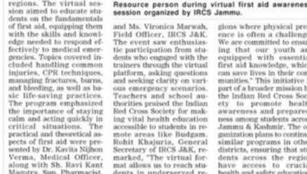
Resource person during virtual first aid awareness session organized by IRCS Jammu.

Indian Red Cross Society organizes virtual first aid awareness session. The session was held on a virtual platform, where participants learned about various first aid techniques and the importance of staying calm in critical situations.