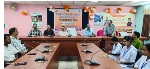
District Level National Voluntary Blood Donation Day celebration Keonjhar, Odisha