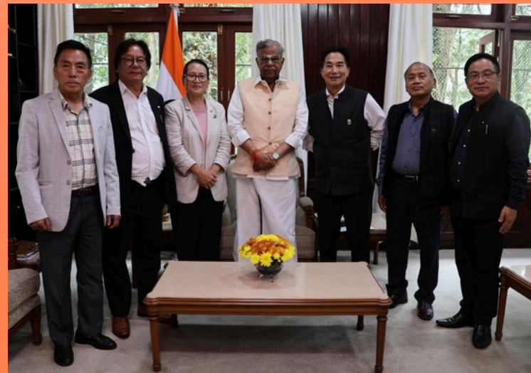
The members of IRCS Nagaland Managing Committee were called on by the Hon'ble Governor and President of IRCS, Nagaland. They updated the Hon'ble President on the activities of the State Branch.