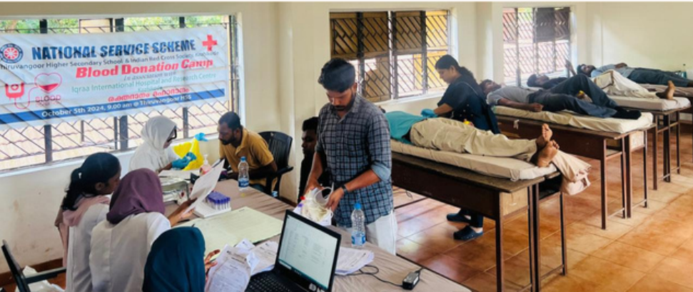
IRCS, Kozhikode in association with NSS unit of Thiruvangoor HSS and Iqra Hospital organised a blood donation camp at Thiruvangoor HSS.

EMPATHY IN ACTION: WHERE EVERY DONATION BECOMES A LIFELINE.