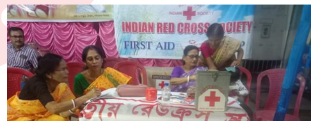
First aid post, IRCS, Malda District Branch during Durga Puja