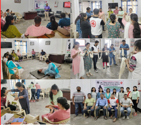
First aid training, Guwahati, IRCS, Assam State Branch