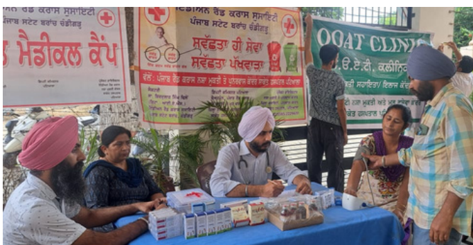
Indian Red Cross Society, Punjab State Drug de-addiction & Rehabilitation Centre, Patiala held a health check up camp. The camp provided general checkups, fever evaluations, BP/sugar testing etc. 70 beneficiaries received the benefits of this free medical camp.