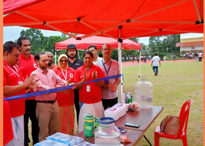
First Aid Centres at Sub Districts of IRCS Vatakara, Kuttiyadi and Kozhikode, Kerala