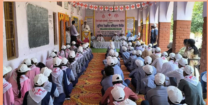
Junior Red Cross JRC five-day camps, Chandigarh, Haryana State Branch

THE EARTH IS THE CRADLE OF HUMANITY, BUT MANKIND CANNOT STAY IN THE CRADLE FOREVER.