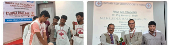
First aid training, Poona College campus, Pune District Branch, Maharashtra