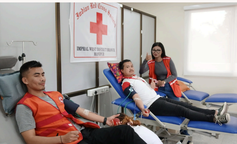
Blood donation camp, Imphal West District Branch, Manipur