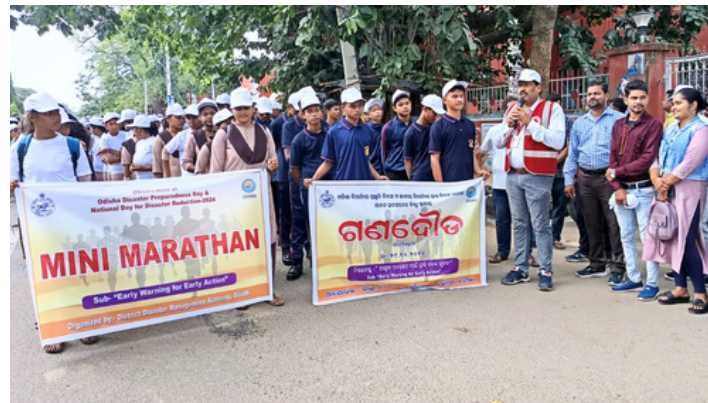
International Day for Disaster Risk Reduction was observed at Boudh, Odisha