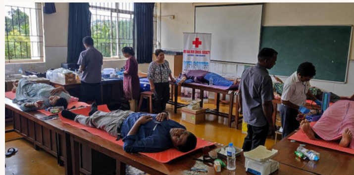
Blood donation camp was held by Goa State Branch at Parvatibai Chowgule College, Goa