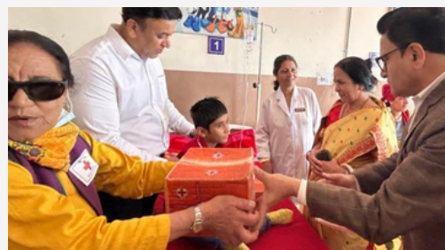
Governor & Chairman, Hospital Welfare Section & General Secretary, HP State Red Cross distributed 250 hygiene kits to the patients & sanitary workers at Deen Dyal Upadhyay Hospital under "Swachta hi Seva" Programme.