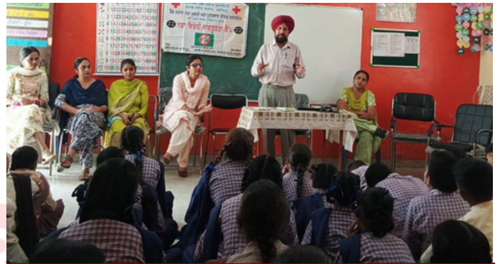
Under the "Nasha Mukat Bharat Abhiyan," the Red Cross Drug De-addiction Centre, Nawanshahr, held a drug awareness camp at Government High Smart School, Sarhala Ranuan.