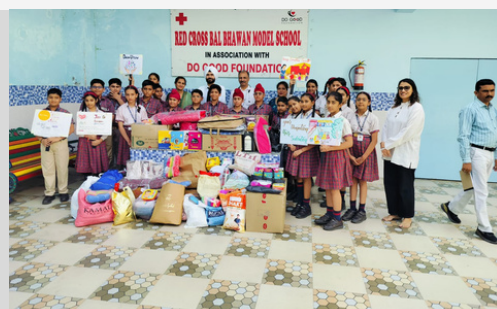
Chief Judicial Magistrate visited Red Cross Home and spreads joy among senior citizens and children through several welfare activities, district branch Ludhiana, Punjab

IRCS, Haryana through its District Red Cross Branches and YRC & JRC wings organised various first aid trainings, Health Checkup Camps, blood donation camps and cleanliness drive during 11-19 October, 2024.