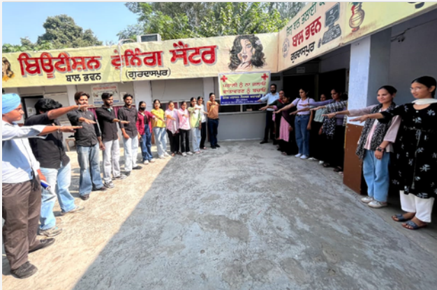
IRCS, Punjab State Branch Drug De-addiction & Rehabilitation Centre, Gurdaspur carried out several awareness activity to save the environment in regard to the stubble burning of paddy leading to rise in air pollution. The State Branch started this campaign by motivating the youngsters against the stubble Burning and explained its harmful effects on soil, water and human health. Numerous flexes have been displayed by the team at conspicuous places.