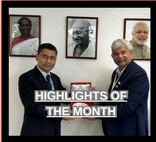
HIGHLIGHTS OF THE MONTH

SPECIAL COVERAGE-STATUTORY MEETINGS OF RED CROSS RED CRESCENT MOVEMENT HELD IN GENEVA FROM 23RD TO 31ST OCTOBER 2024.