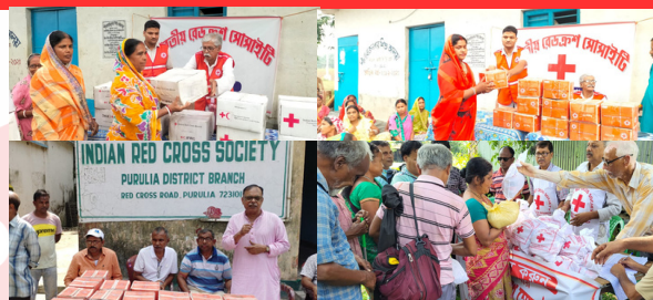
Due to the release of dam water, the district of Purba Medinipur, Paschim Medinipur, Howrah, Hooghly, Kandi- Murshidabad were affected. SHQ sent relief materials for response works. Branches distributed bleaching powder, HP kits, kitchen sets, tarpaulins, dry foods. The District of Coochbehar, Alipurduar, Darjeeling, Kalimpong, Malda, Murshidabad were affected by flood, landslide. They have responded in coordination with local Government Administration