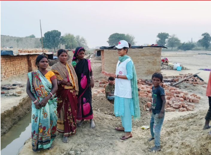
TB eradication awareness session, Red Cross, Rohtak, Haryana