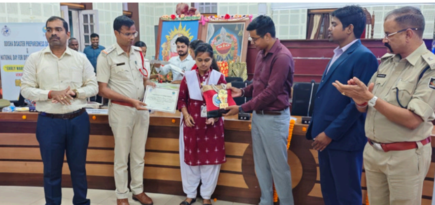
International Day for Disaster Risk Reduction was observed at Keonjhar, Odisha