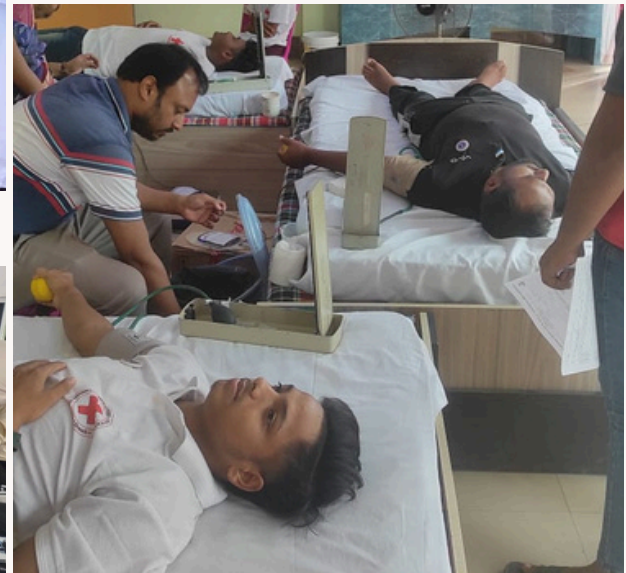
IRCS, Sonamura Sub-Divisional Branch organized a blood Donation camp at sonamura & sepahijala districts of Tripura.