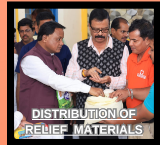
DISTRIBUTION OF RELIEF MATERIALS