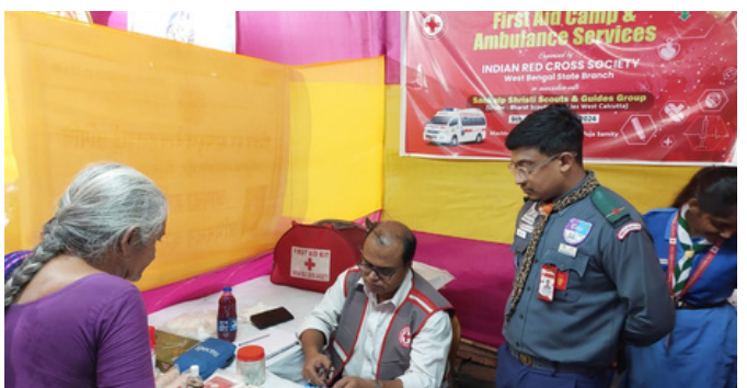
First Aid camps & Ambulance Services, IRCS, West Bengal State Branch.