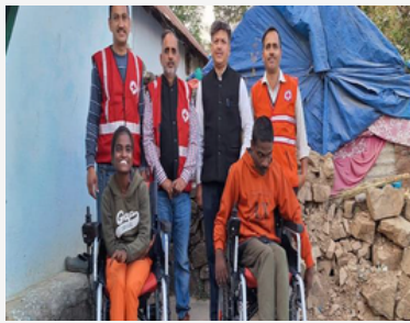
Hon'ble Governor & President HP State Red Cross donated fully battery operated 02 Wheel Chairs to the 100% disabled children