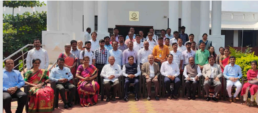
IRCS Bagalkot district branch & Bagalkot University, Jamkhandi, jointly hosted a one day Youth Red Cross Program and officers meeting cum training.