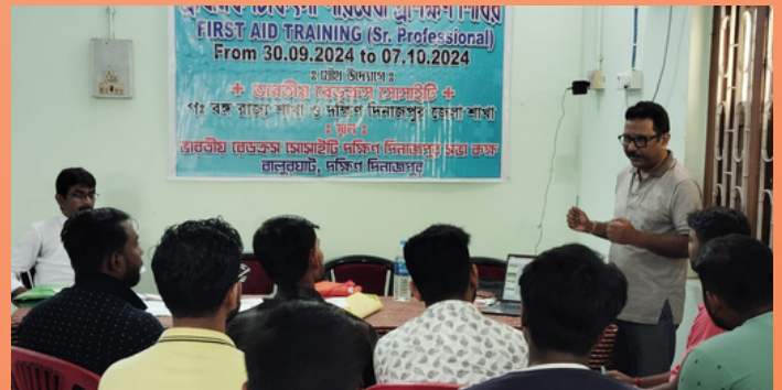
First aid training, IRCS Dakshin Dinajpur District Branch, Balurghat, West Bengal