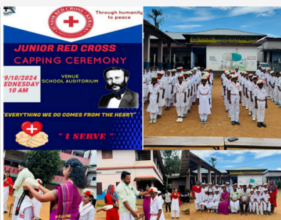
Junior Red Cross cadets visited old age home and attended capping ceremony conducted by the Kerala state branch