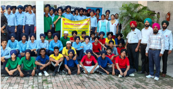
IRCS, Punjab State Integrated Rehabilitation Center for Addicts, Siswan, Punjab carried Safayi Abhiyan Activity. This Abhiyan was held at village, Arnauli to clean the Rural assets like water bodies.

“WE MAKE A LIVING BY WHAT WE GET, BUT WE MAKE A LIFE BY WHAT WE GIVE.” - WINSTON CHURCHILL