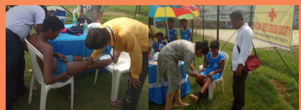
First aid post at 68th State School Games 2024 was organised by IRCS, Purba Bardhaman, District Branch, West Bengal