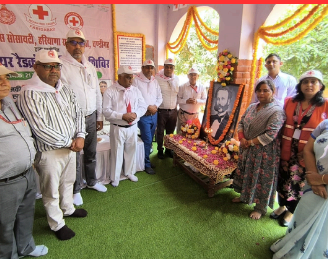
Inauguration of JRC five days junior Red Cross Camp by district education officer of Faridabad district, Haryana.