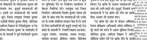
धर से मतदान के तब तक एंड ड्रीम कार्ड में निर्वाह मिलाक हरियाणा सेल व्यूरो।

धर से मतदान के तब तक एंड ड्रीम कार्ड में निर्वाह मिलाक हरियाणा सेल व्यूरो। The initiative aims to streamline the voting process and ensure that all voters have access to necessary services.