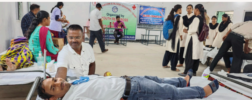
YRC & NCC volunteers during blood donation camp at D D University, Keonjhar, Odisha