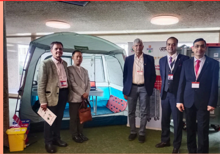
Demonstration of Bharat Health Initiative for Sahyog Hita & Maitri (BHISHM) Cube. State of the art made in India portable units are aimed at rapid deployment of medical facilities in emergency situations. Indian delegation of IRCS visited the stall of BHISM CUBE.