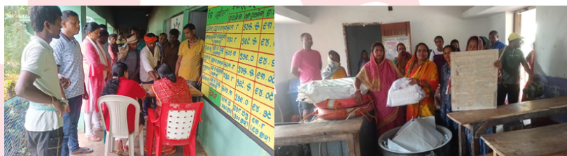
IRCS Odisha State Branch volunteers, including Junior and Youth Red Cross counsellors, supplemented the efforts of the local government in evacuation of the people rescued due to cyclone Dana