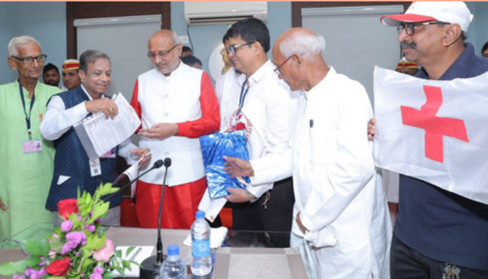
Hon'ble Governor of Maharashtra Sh. C P Radhakrishnan visited Bhandara District Branch in Maharashtra where staff and officials engaged in an interactive session with him to discuss the branch's activities.