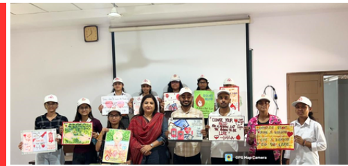
Awareness Rallies were organised and Blood Donation Pledge were taken by the volunteers on the occasion of National Voluntary Blood Donation at Sanatan Dharma College, Ambala CanTT.