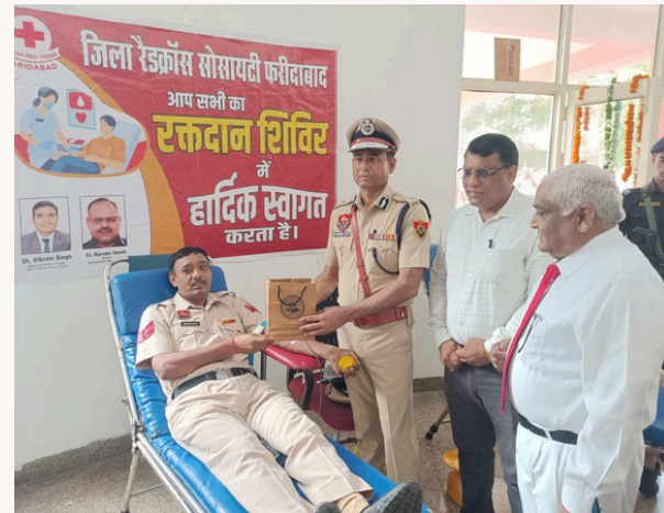
Blood donation camp, Faridabad, Haryana.