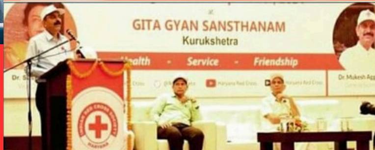
IRCS Haryana State Branch organised State Level Junior Red Cross training camp for boys from 30th August to 4th September, 2024 at Kurukshetra. 220 participants from 21 districts of Haryana participated in this camp.

THE GREATNESS OF HUMANITY IS NOT IN BEING HUMAN, BUT IN BEING HUMANE