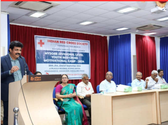
The YRC Divisional level camp of Mysore Division was conducted at Piliikula Regional Science Center, Vamanjoor, Mangalore, Karnataka