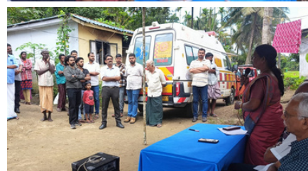
IRCS, Kottayam District Branch organized Onakody, Onakit distribution at Mariyasadanam on Onam.