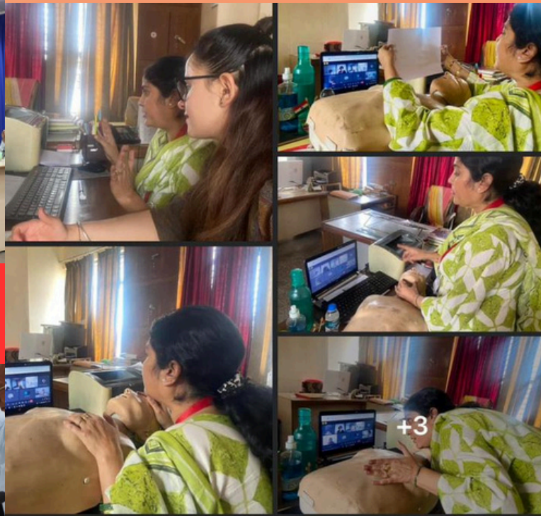
IRCS J&K organised first ever virtual first aid awareness session for students of Foundation World School, Budgam, J&K.