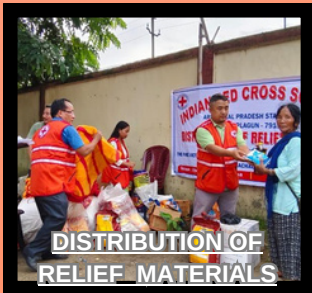
DISTRIBUTION OF RELIEF MATERIALS