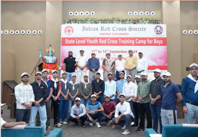
IRCS, Haryana State Branch organised State Level Youth Red Cross Training Camp (For Boys) from 11th to 16th September, 2024 at Geeta Gyan Sansthanam, Kurukshetra. 209 participants from 13 Universities and 25 Colleges of 19 Districts of Haryana participated in this camp.

THE GREATNESS OF HUMANITY IS NOT IN BEING HUMAN, BUT IN BEING HUMANE