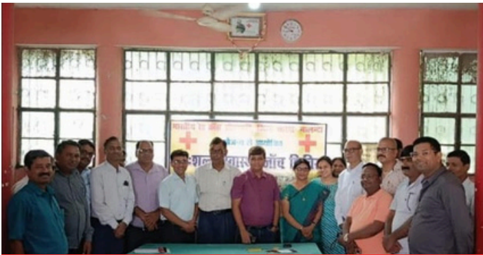
Health Camp was organised by IRCS, Nalanda district branch, Bihar