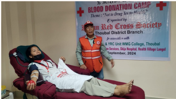
Blood donation camp was organised by IRCS, Thoubal District Branch in association with YRC unit WMG College, Thoubal