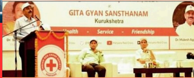
IRCS Haryana State Branch organised State Level Junior Red Cross training camp for boys from 30th August to 4th September, 2024 at Kurukshetra. 220 participants from 21 districts of Haryana participated in this camp.

THE GREATNESS OF HUMANITY IS NOT IN BEING HUMAN, BUT IN BEING HUMANE