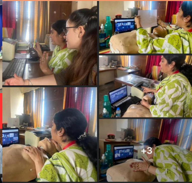
IRCS J&K organised first ever virtual first aid awareness session for students of Foundation World School, Budgam, J&K.