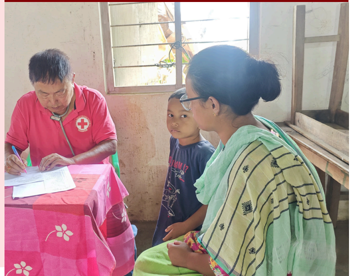
A basic psychological support program was conducted for the IDPs at Laphupat Tera Relief Camp, a very interior camp in Imphal West District. Treatment with medications were also done.