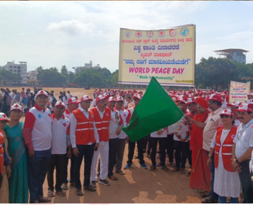
On International Day of Peace district branches of IRCS, Karnataka conducted Walkathons in several districts with the theme "Walk for Humanity".