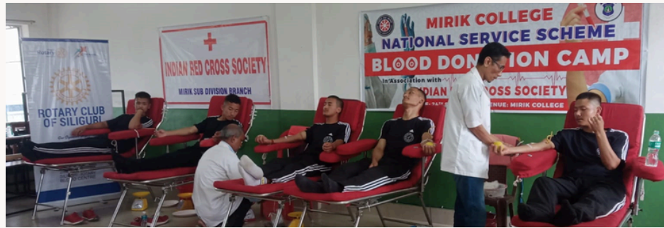
IRCS Mirik SD Branch, Darjeeling District organized a blood donation camp at Mirik College in collaboration with NSS Unit I & II of Mirik College.

IRCS NHQ BLOOD CENTER TIMINGS FOR BLOOD DONATION: MONDAY- SATURDAY (EXCEPT 2ND SATURDAY): 9 AM - 7 PM 2ND SATURDAY, SUNDAY, PUBLIC HOLIDAYS: 10 AM - 6 PM NOTE: THE NHQ BLOOD CENTER IS OPEN 24/7 FOR ISSUE OF BLOOD