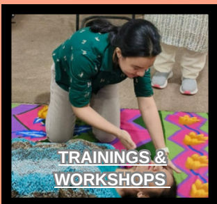
TRAININGS & WORKSHOPS