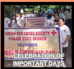
CELEBRATION OF IMPORTANT DAYS