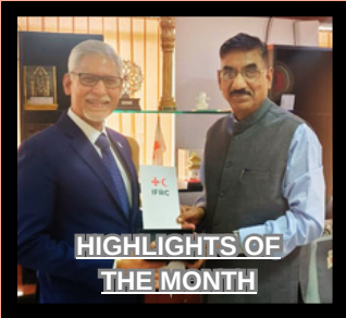
HIGHLIGHTS OF THE MONTH