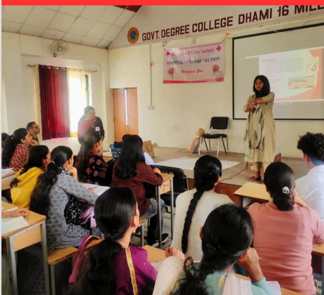
First Aid training was provided at Govt. Degree College, Dhami by IRCS H.P state branch