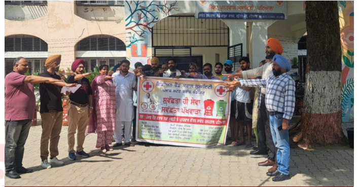
IRCS, Punjab State Drug De-Addiction & Rehabilitation Centre, Patiala, launched the Swachhata Hi Seva-2024 campaign under the guidance of the Ministry of Social Justice and Empowerment.