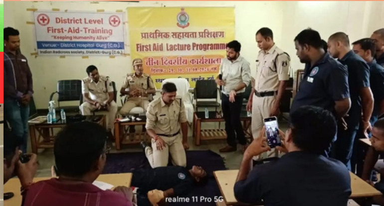
First aid training, Durg, Chhattisgarh

THE DESIRE FOR THE WELL-BEING OF ONE'S OWN NATION CAN BE- AND MUST BE-MADE COMPATIBLE WITH THE WELFARE OF ALL HUMANITY.