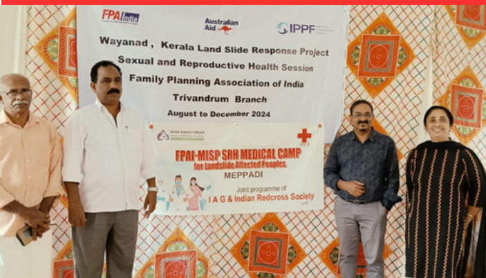
FPAI- MISP SRH Medical Camp for landslide affected people, joint program by IAG & Indian Red Cross, Kerala State Branch