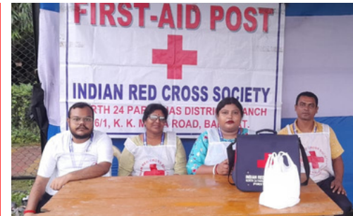
IRCS, North 24 Parganas District Branch, West Bengal observed World First-Aid Day by setting up first-aid post at BADC Block, Salt Lake for football match for girls.