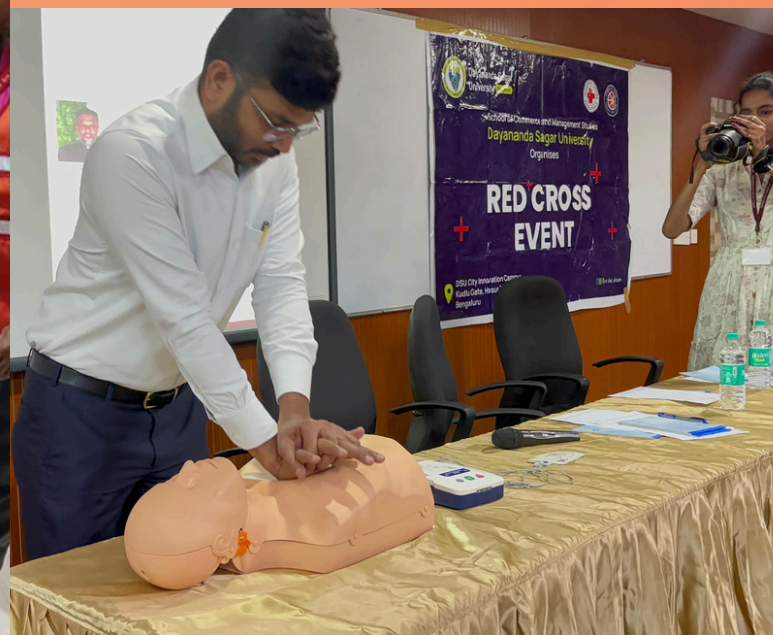
IRCS Karnataka State Branch conducted first aid awareness program at Dayananda Sagar University, Bangalore.