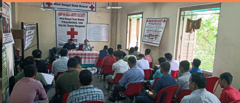
First aid training for Corporate concluded at IRCS SHQ Kolkata, West Bengal