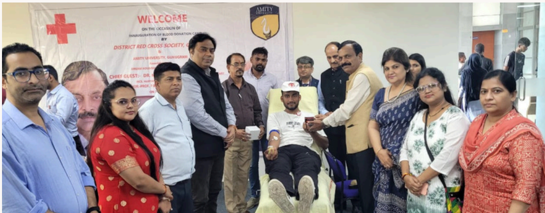
Mega Blood Donation camp at Amity University Gurugram, Haryana