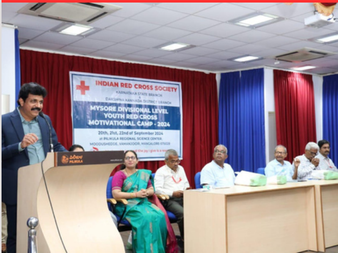
The YRC Divisional level camp of Mysore Division was conducted at Piliikula Regional Science Center, Vamanjoor, Mangalore, Karnataka