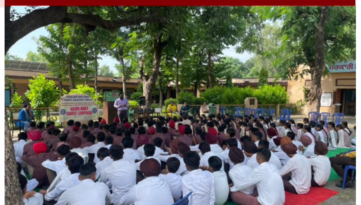
IRCS, Punjab State Drug De-Addiction & Rehabilitation Centre, Patiala, organized an anti-drug awareness session at Senior Secondary School, Yogipur