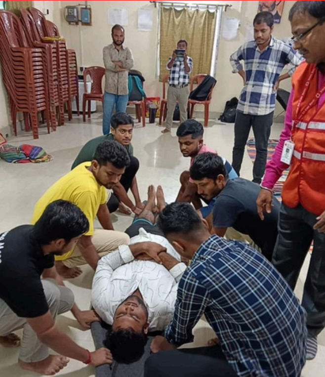
3 days Disaster Management Training was organized by IRCS Tehatta SD Branch, Nadia District in collaboration with IRCS West Bengal State Branch