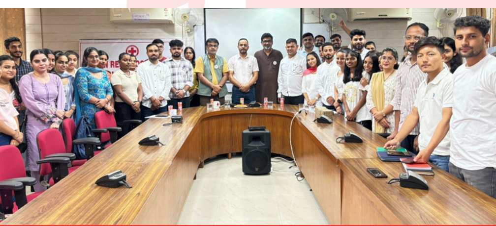
IRCS, Punjab State Branch, Chandigarh, in collaboration with Department of Sociology, Punjab University, Chandigarh celebrated International Day of Peace.