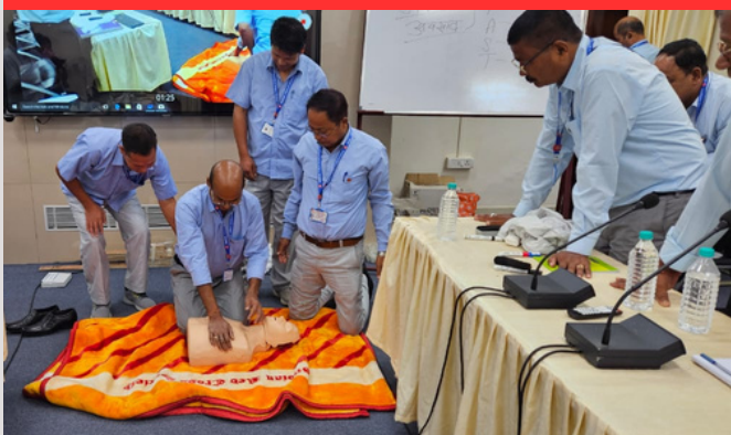
First aid training program at NEEPCO Power Station at Hoj in Arunachal Pradesh