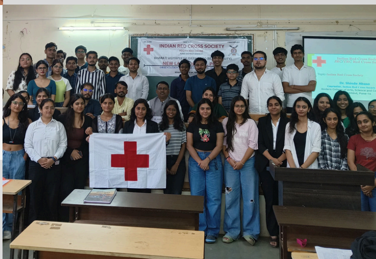
New Law College, Pune, launched its Youth Red Cross (YRC) wing with an orientation session, emphasizing humanitarian values and social responsibility.

“WE MAKE A LIVING BY WHAT WE GET, BUT WE MAKE A LIFE BY WHAT WE GIVE.” - WINSTON CHURCHILL