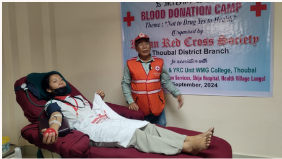
Blood donation camp was organised by IRCS, Thoubal District Branch in association with YRC unit WMG College, Thoubal