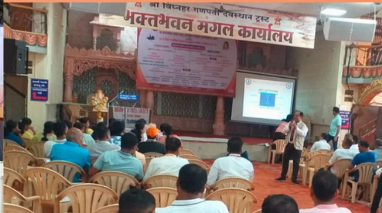
First aid training, Ozar, Maharashtra