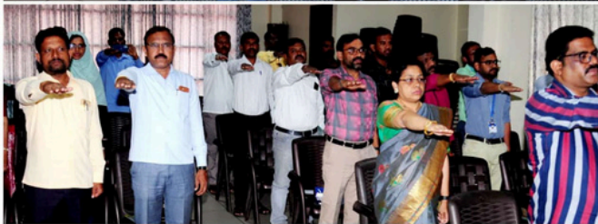
IRCS Chitradurga District branch, Karnataka held an orientation program on YRC activities for the youth Red Cross program officers. Assistant professors from various colleges of the university participated in the meeting.

THE EARTH IS THE CRADLE OF HUMANITY, BUT MANKIND CANNOT STAY IN THE CRADLE FOREVER.