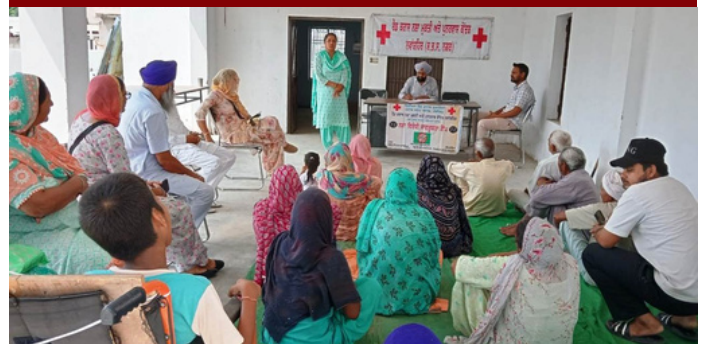
IRCS, Punjab State, Drug de-addiction and Rehabilitation Centre for Addicts, Nawanshahr, organized an awareness camp at village Rurki Kalan. The camp aimed to create awareness about the risks associated with drug abuse, its impact on individuals and families