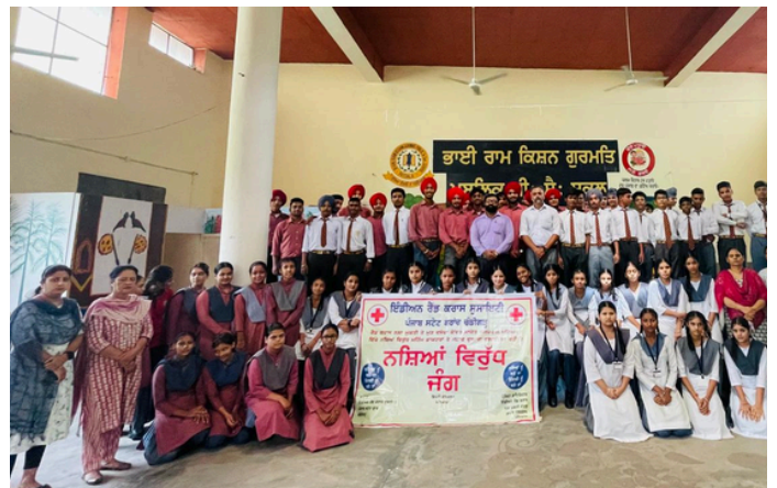
The Red Cross Drug De-Addiction and Rehabilitation Center, Patiala, organized an anti-drug awareness session at Bhai Ram Krishan Gumat Public Senior Secondary School.