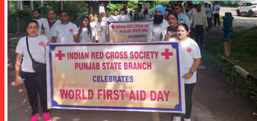
IRCS, Punjab State Branch Observed World First Aid Day with Walkathon