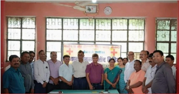
Health Camp was organised by IRCS, Nalanda district branch, Bihar