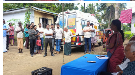
IRCS, Kottayam District Branch organized Onakody, Onakiti distribution at Mariyasadanam on Onam.