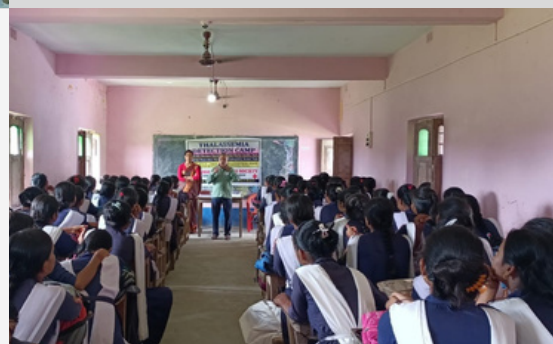
Thalassemia detection camp was held at Najrul Smriti Balika Vidyalaya by IRCS Kaliganj block of Nadia district in association with Thalassemia Control Unit, Sadar Hospital, Krishnanagar, Nadia, West Bengal