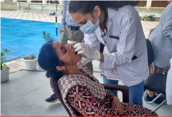
Free dental camp at Govt YRC Degree College Dhama Shimla by HP State Red Cross Branch