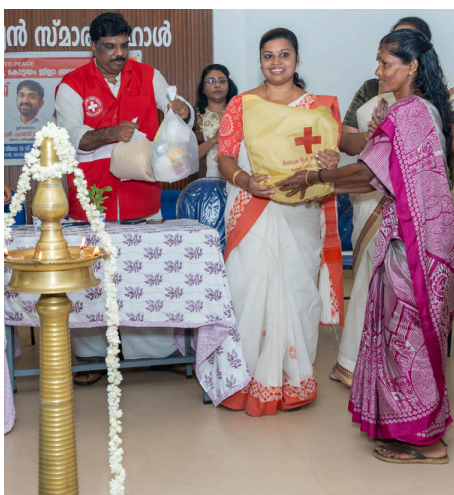
Distribution of relief items to needy by Kottayam District Branch, Kerala on the eve of Onam.