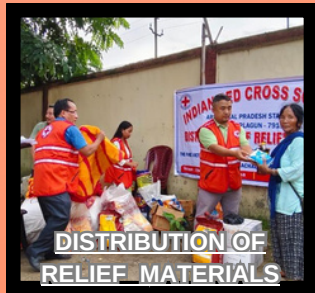
DISTRIBUTION OF RELIEF MATERIALS