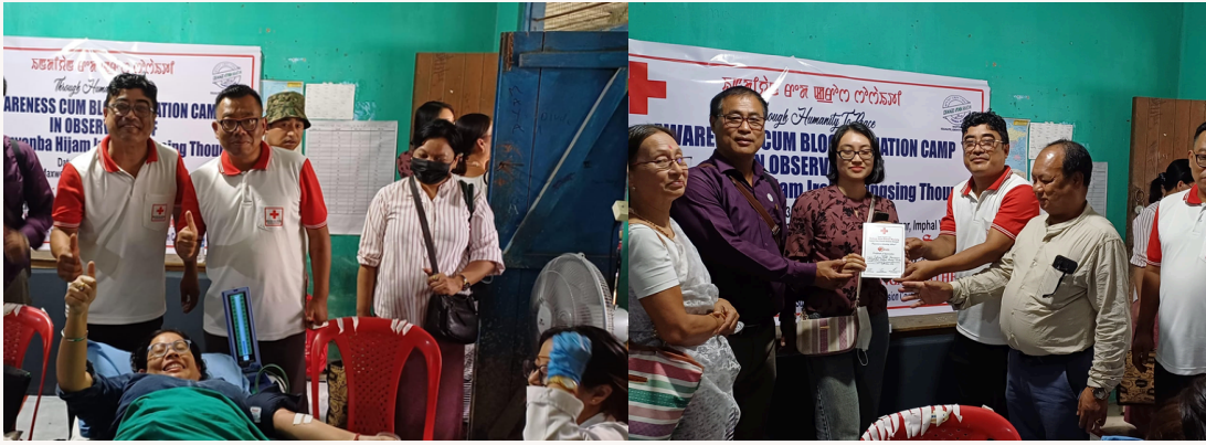
Awareness cum blood donation camp in observance of 128th Lamyamba Hijim Irabot Ningsing Thouram, Imphal West. 15 persons donated their blood.

THE GIFT OF BLOOD IS THE GIFT OF LIFE. SHARE THAT PRECIOUS GIFT TODAY