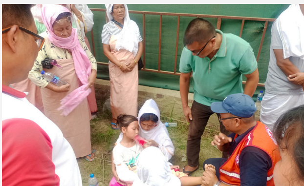
Volunteers of IRCS Imphal West district branch, Manipur provided the first aid and helped in transporting them. The injuries were caused by the ongoing situation at Imphal West District from 9th to 11th September 2024