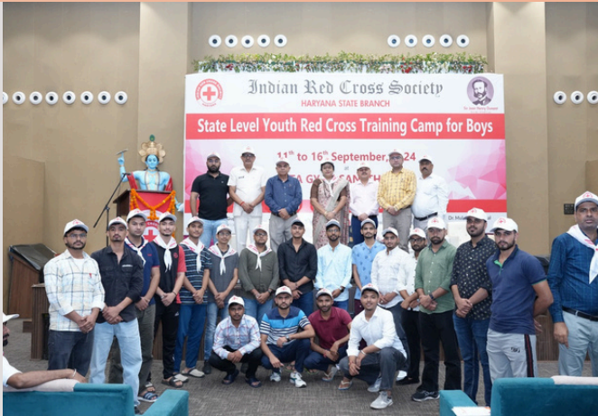
IRCS, Haryana State Branch organised State Level Youth Red Cross Training Camp (For Boys) from 11th to 16th September, 2024 at Geeta Gyan Sansthanam, Kurukshetra. 209 participants from 13 Universities and 25 Colleges of 19 Districts of Haryana participated in this camp.

THE GREATNESS OF HUMANITY IS NOT IN BEING HUMAN, BUT IN BEING HUMANE