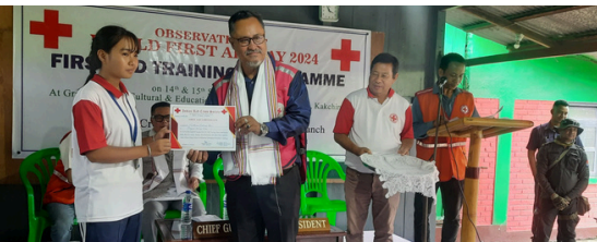
IRCS, Manipur State Branch in association with IRCS, Kaching District Branch conducted a First Aid Training Program