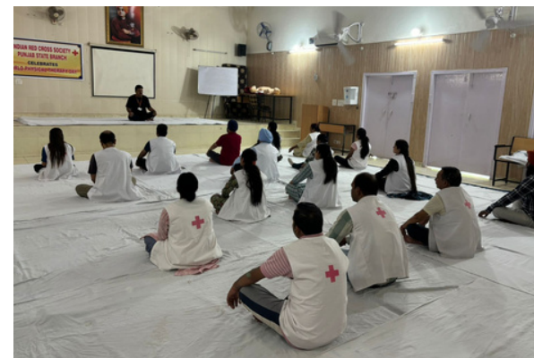
IRCS, Punjab State Branch, Chandigarh, celebrated World Physical Therapy Day to promote physical wellness & awareness among the staff.