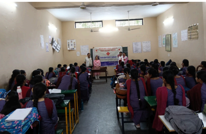
An awareness camp was held at Government Girls Sr Sec School, Gurdaspur under NMBA by IRCS Punjab State Drug De-addiction Centre.