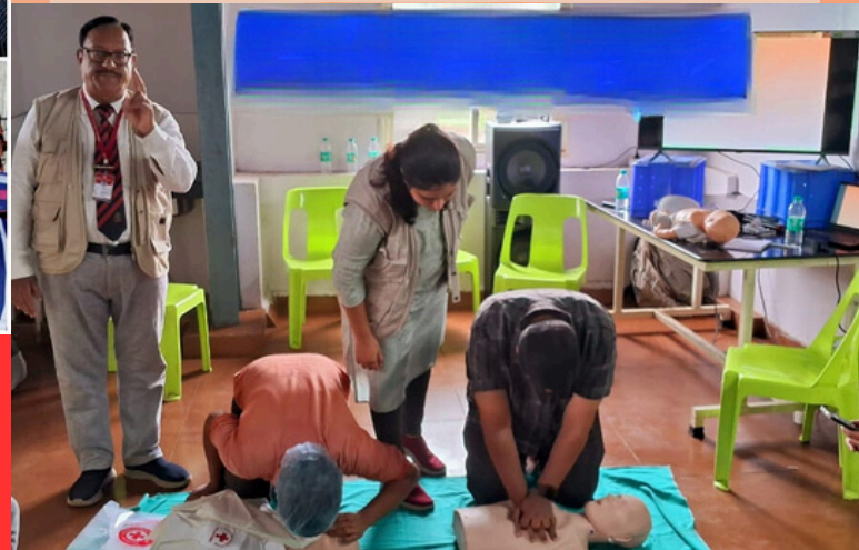
First aid training, Beejapuri Dairy Private Limited, Kharabwadi, Maharashtra

THE EARTH IS THE CRADLE OF HUMANITY, BUT MANKIND CANNOT STAY IN THE CRADLE FOREVER.