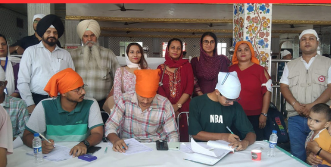
IRCS, Punjab State Branch, Chandigarh, held a Mega Health Checkup and TB Screening Camp at Gurudwara Sahib Chevin Patshahi, Lamba Pind, Jalandhar in collaboration with the IRCS, Jalandhar; District Health Society, Jalandhar; Gurudwara Sahib Chevin Patshahi, Lamba Pind, Jalandhar; and Humsafar Youth Club.