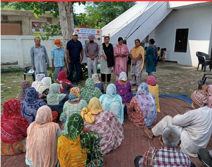
IRCS, Punjab State Branch, Chandigarh, and Nasha Mukta Bharat Abhiyan, in collaboration with the Red Cross Drug De-addiction Center Nawanshahr, organized an anti-drug awareness camp at Guruduwara Guru Ravidass Ji, Begampur.