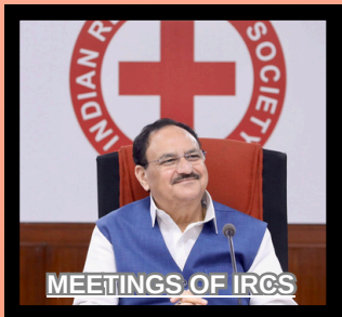
MEETINGS OF IRCS