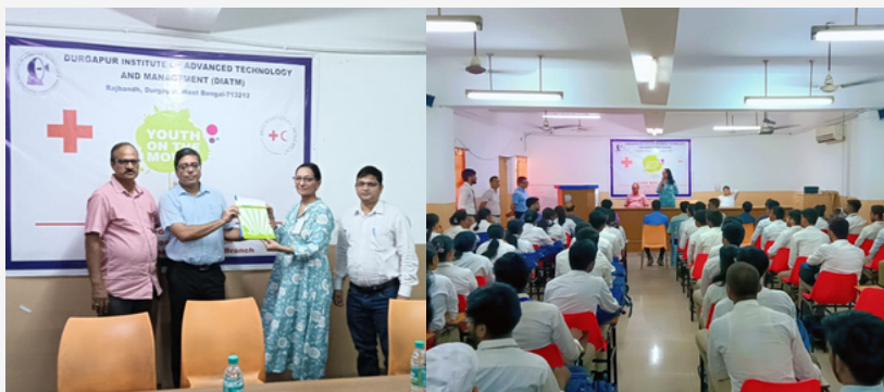
YRC unit was opened at Durgapur Institute of Advance Technology and Management, Rajbandh, Paschim Bardhaman District, West Bengal