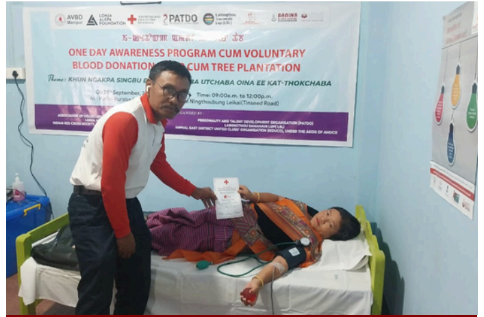
One day awareness program cum voluntary blood donation cum tree plantation, Khurai Ningthoubung Leikai, Imphal, Manipur,