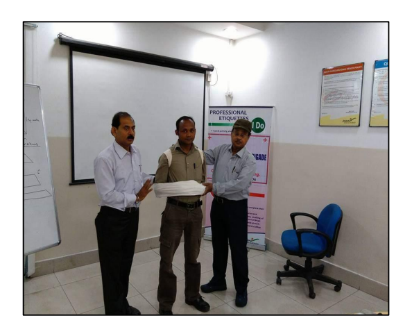
Photographs of Annual Training Camp & First Aid Training Class