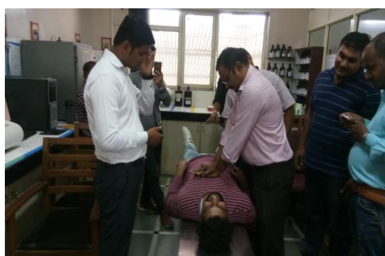
View of the First Aid training Sessions