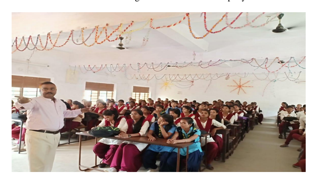
View of First Aid Training at Schools, ó JHARKHAND