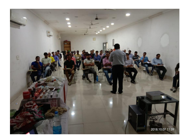
First Aid Training at R.R. Ispat Industry Urla, Raipur Chhattisgarh