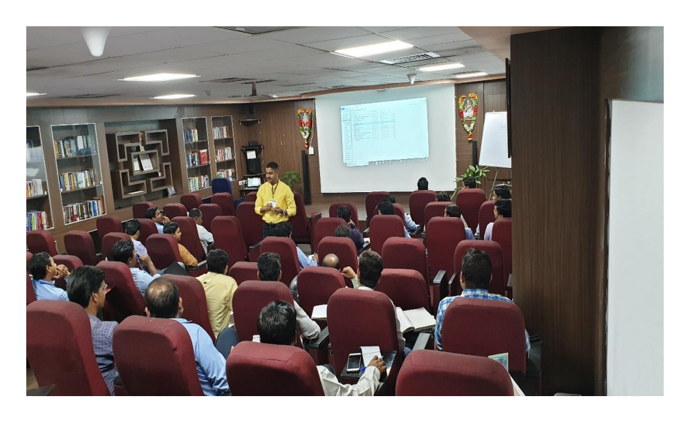
First Aid Training at Multi National Company

New Cloths (Shirt / Trousers / Saree / Ladies Suites) distributed in slum areas. Organized free Medical Camp at Akash Hospital & Research Centre, Chas ó Bokaro.