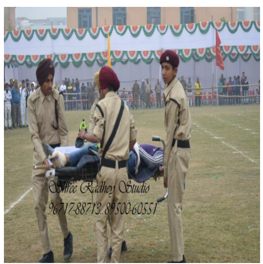
First Aid demo by Brigade Cadets Panipat