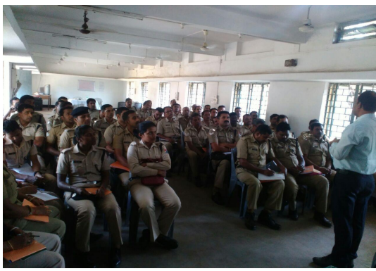
First Aid Awareness-cum-Hands on CPR

South Eastern Railway, the Brigade Wing No.22 (S.E.Rly.) District continued to serve the trained passengers in trains & at Railway Stations as well as the general public at large gatherings, emergencies and catastrophic situations by providing first aid at stat and transporting serious casualties to hospitals. The members attended the National Service Camp at PURI during Car Festival like every years. They extended their helping hands during the Pulse Polio Immunization progaramme organized by the medical department of S.E. Railway, over Adra Division, Chakradharpur Division, Kharagpur Division and Ranchi Division.