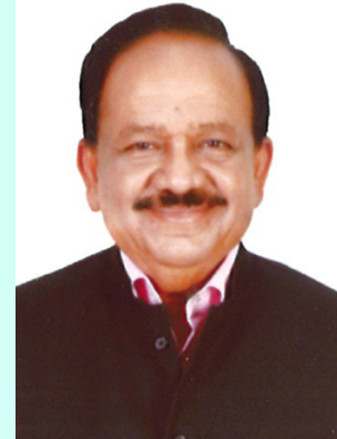
Dr Harsh Vardhan, Hon'ble HFM