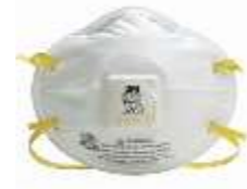
N95 mask (respirator mask)