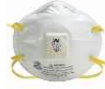
N95 mask (respirator mask)