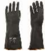
Cleaning gloves (Heavy duty)

International Federation of the Red Cross Red Crescent Societies