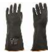
Cleaning gloves (Heavy duty)

International Federation of the Red Cross Red Crescent Societies