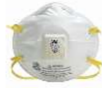
N95 mask (respirator mask)