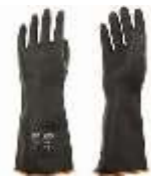
Cleaning gloves (Heavy duty)

International Federation of the Red Cross Red Crescent Societies