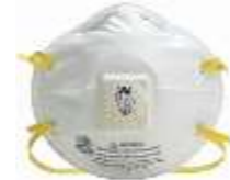
N95 mask (respirator mask)